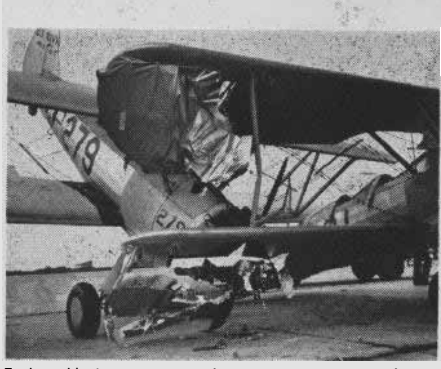
Taxi accident: "He taxied too fast and didn't look where he was going."

I refuse to get mad at this pilot -I'm glad he finally got the word. But it's tough to have to watch pilots learn everything the hard way. In this case, a little serious attention to Flight Safety