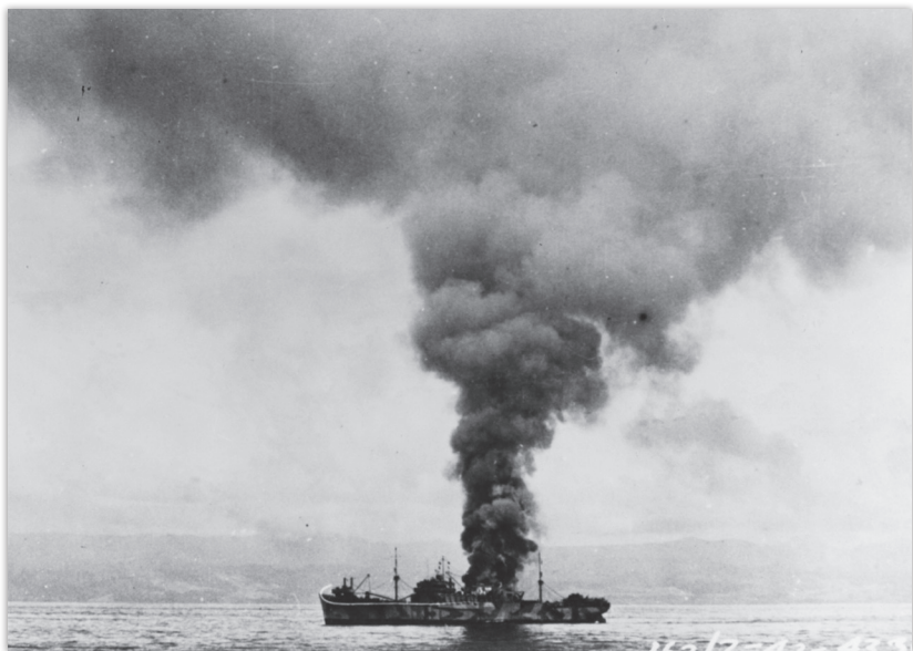
George F. Elliott (AP-13) burning off Guadalcanal after a Japanese strike on 8 August 1942. The withdrawal of Vice Admiral Frank Jack Fletcher's aircraft carriers left Rear Admiral Richmond Kelly Turner's transports open to Japanese attack.

with half their cargo still in their holds. 11 The 15,000 Marines of Major General Alexander Vandegrift's 1st Marine Division remained ashore with 17 days of food and ammunition, and few heavy weapons. 12