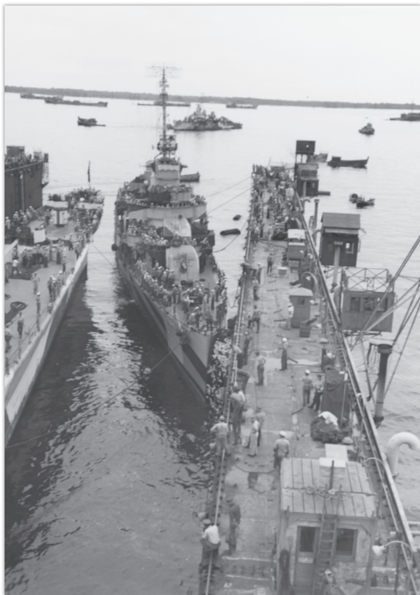
At Manus Island, Papua New Guinea, USS Claxton (DD-571) enters floating dry dock ABSD-2 in December 1944 for repairs. To Claxton's starboard is Canberra (CA-70). Kamikazes had damaged both ships. Killen (DD-593) appears in the center background, as well as a number of transports. By late 1944, the Navy's logistics apparatus had developed to provide mobile sustainment for naval forces, including the ability to complete repairs far forward, such as seen in this photograph. (NHHC, 80-G-359488)