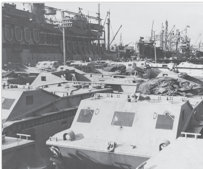
Marine Corps LVT-1 amphibian tractors await embarkation at Wellington, New Zealand, in July 1942. In the background are transport ships.

Turner arrived in Wellington, New Zealand on 17 July, boarded his flagship McCawley (AP-10), and took formal command of the amphibious force the next day. As noted in previous chapters, the line Navy had a history of ignoring combat logistics, meaning most surface warfare officers had little experience in amphibious operations. To make matters worse, Turner had never served at the Bureau of Personnel and had not interacted long enough with the bureau to establish a warm relationship. The result was that six out of seven Navy officers on his staff had no amphibious experience at all. Luckily, the four Marine officers did, which was of critical importance as Turner had only 20 days to finish planning the operation. The ensuing three weeks were a whirlwind of investigation, planning, and training. 7