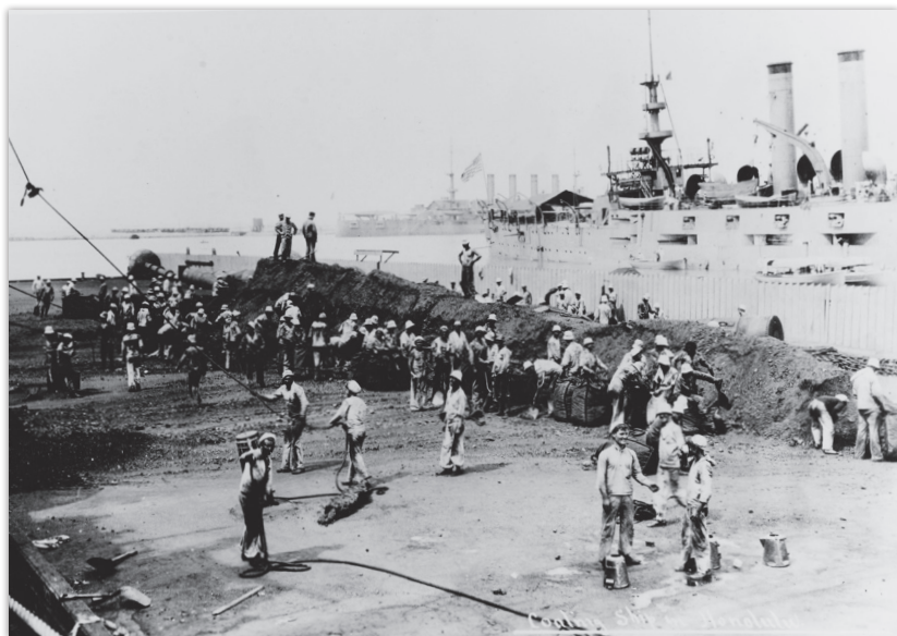
Sailors work to coal a ship in Honolulu, Territory of Hawaii, circa 1905. Early Navy logistics efforts centered on keeping ships fueled with coal. Providing warships with adequate supplies for operations presented a challenge for the Navy, as demonstrated in the Spanish-American War and the cruise of the Great White Fleet.

establishment of coaling and service stations in the Pacific following the Spanish-American War. It was little wonder, then, that the first chairman of the General Board, George Dewey, found it salutary that its work would ensure “that our commanders will go into action not only with a sufficiency of ammunition but with the confidence that they are part of a well-prepared force.” 22