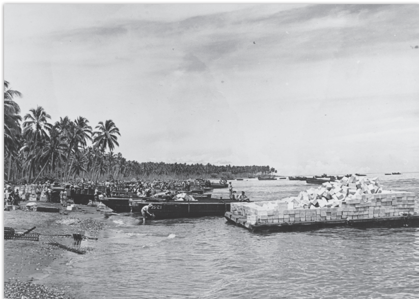
Unloading supplies at Guadalcanal in December 1942 or January 1943. As seen here, supplies to Guadalcanal came across the beach by hand to be loaded into trucks ashore. (NHHHC, 80-G-40796)

the 27 original cargo and troop ships assigned, 5 had been sunk, 3 had been sent back to the United States for extensive repairs and were ostensibly out of service, and 4 were undergoing repairs in Australia. The 15 remaining ships were “working continuously, carrying troops and freight through dangerous waters, and further losses are expected.” To make matters worse, the planned replacement of Marine regiments on Guadalcanal by Army troops—an exchange totaling about 26,000 men—would require about 20 trips by transports. If Turner lost the additional five ships it would make exchanging the Marines practically impossible. As he put it, “Cargo vessels for the support of Cactus are most inadequate in number, and, if even the ‘hand-to-mouth’ stage of support is maintained, require immediate increase. . . . More, not fewer, cargo vessels are required.” 12