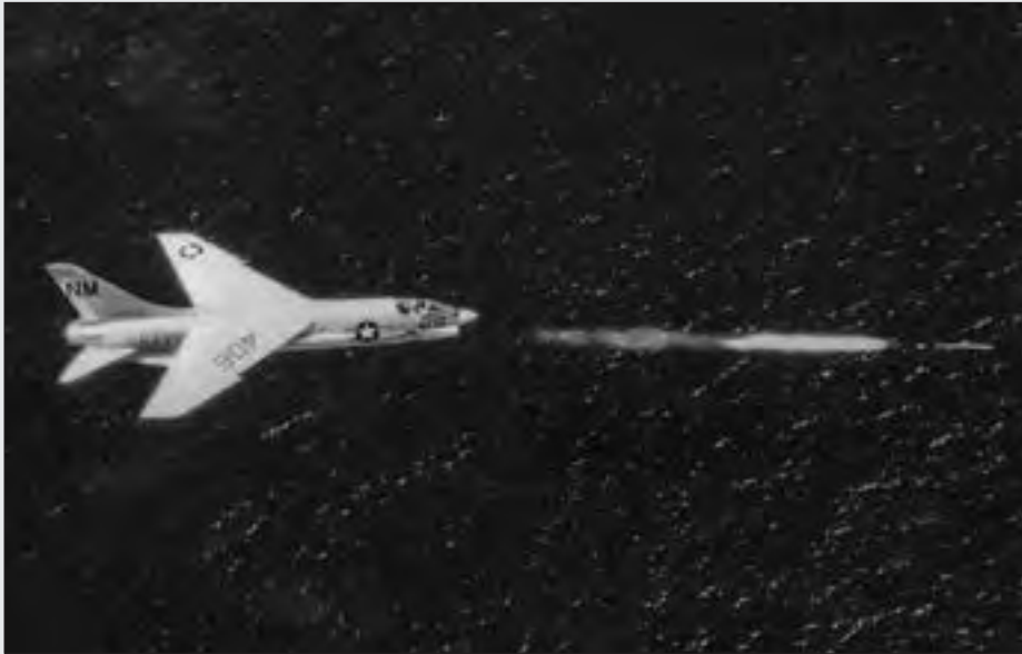
NHHC VN Collection