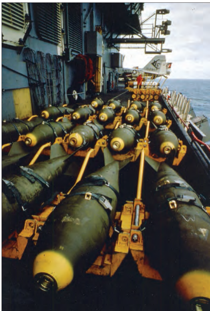
General purpose, or iron, bombs crowd the deck before ordnancemen load them onto Task Force 77 attack planes.

Enemy aircraft also took a toll on naval aircraft and aircrews. On 3 April 1965, strikes by Carrier Air Wing (CVW) 21 led by Commander Warren Sell from Hancock and CVW-15 led by Commander H. P. Glickman from Coral Sea (CVA-43) destroyed the Dong Phoung Thong highway bridge 65 miles south of Hanoi. Antiaircraft fire struck an A-4C