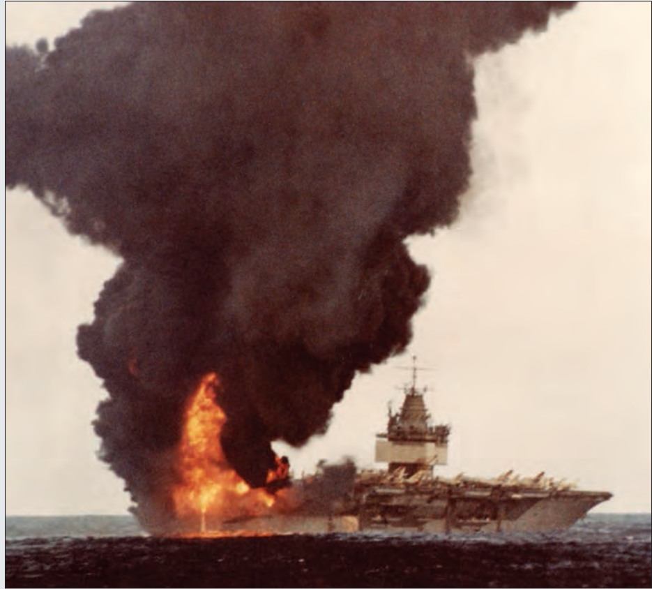
Fire ravages the carrier Enterprise (CVAN-65) preparing off Hawaii in January 1969 to join Task Force 77 at Yankee Station.

Nuclear-propelled Enterprise (CVAN-65) was the third carrier to be stricken by a major fire. On 14 January 1969, she was steaming off Hawaii on an exercise before deploying to the South China Sea. The accidental triggering of a Zuni rocket quickly transformed the flight deck into an inferno of burning planes and exploding ordnance. Damage control parties battled the flames for three hours before they brought the fire under control. This conflagration killed 28 men, seriously injured 62, and destroyed 15 aircraft. Repairs to the carrier and replacement of aircraft cost $56 million. Enterprise returned to Yankee Station in October 1969. ↴