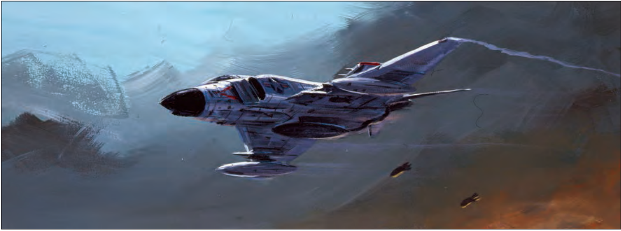
Navy Art Collection