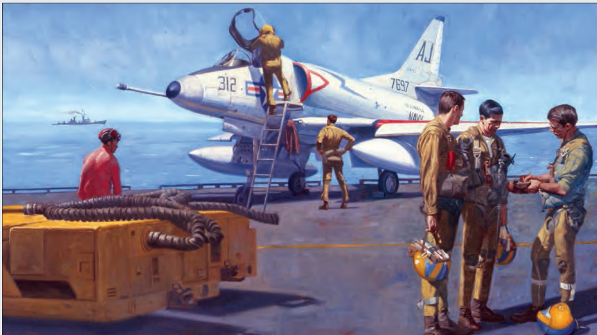
NHHC VN Collection