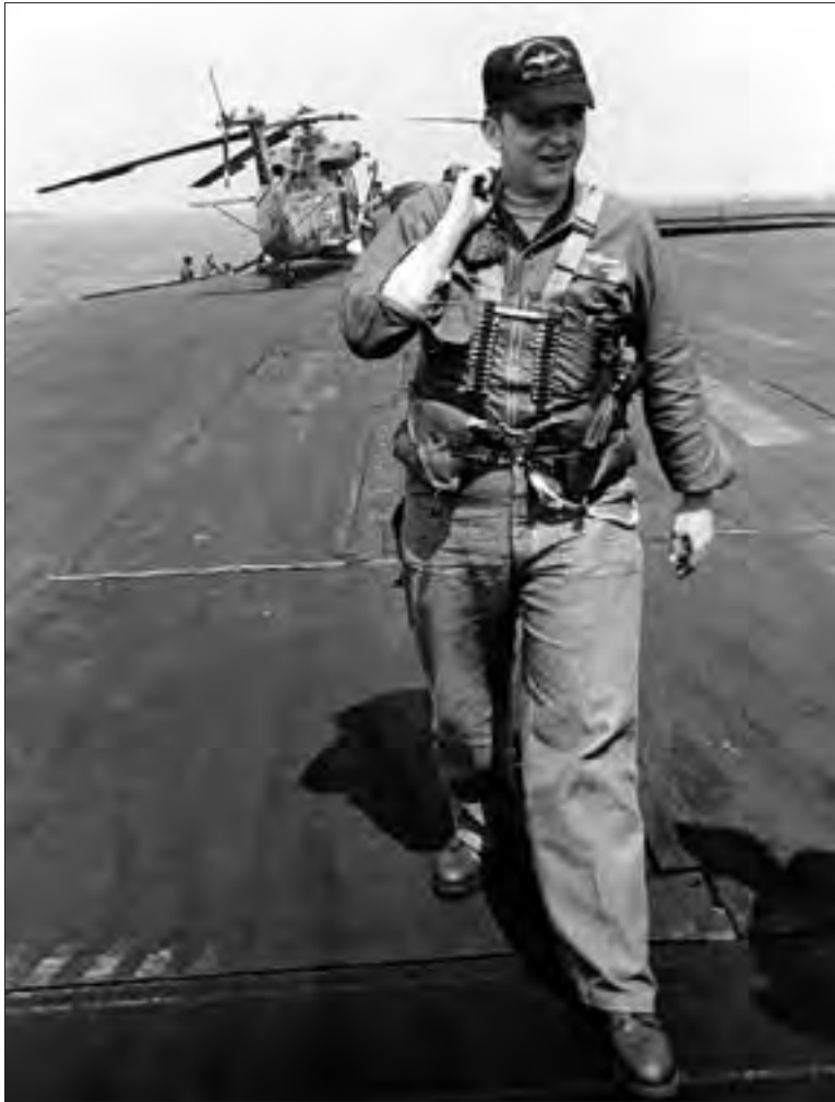
NHHC VN Collection