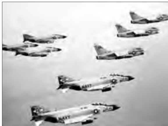
NHHC VN Collection

The operational experience of Rolling Thunder spurred the Navy to reinforce its carrier air wings with more advanced fighter, attack, and reconnaissance aircraft, and to redirect the older aircraft to missions in the less heavily defended skies over South Vietnam. F-4 Phantom IIs, A-6 Intruders, A-7 Corsair IIs, and RA-5C Vigilantes became the primary aircraft for operations over the Red River Delta of North Vietnam, while the Navy assigned bombing and SAR support missions in the South and in Laos to the older A-4 Skyhawks and propeller-driven A-1 Skyraiders. The EA-6B Prowler electronic countermeasures aircraft helped reduce Navy air losses. By the start of Rolling Thunder, the Navy had deployed improved air-to-air missiles, including upgraded Sidewinders and so-called dogfight Sparrow radar-guided weapons.