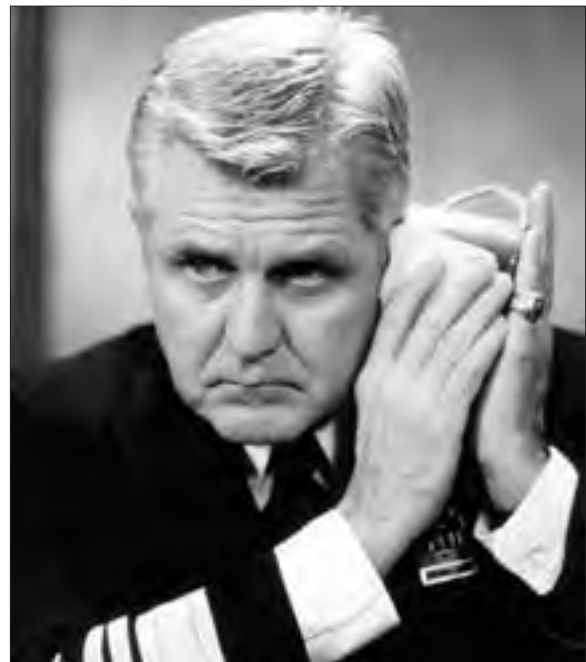
NHHC VN Collection

Stockdale's courage, dedication to duty, and leadership under great duress while in captivity