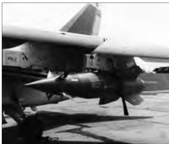
An AGM-12 Bullpup air-to-ground missile affixed to the wing of an A-7 Corsair.