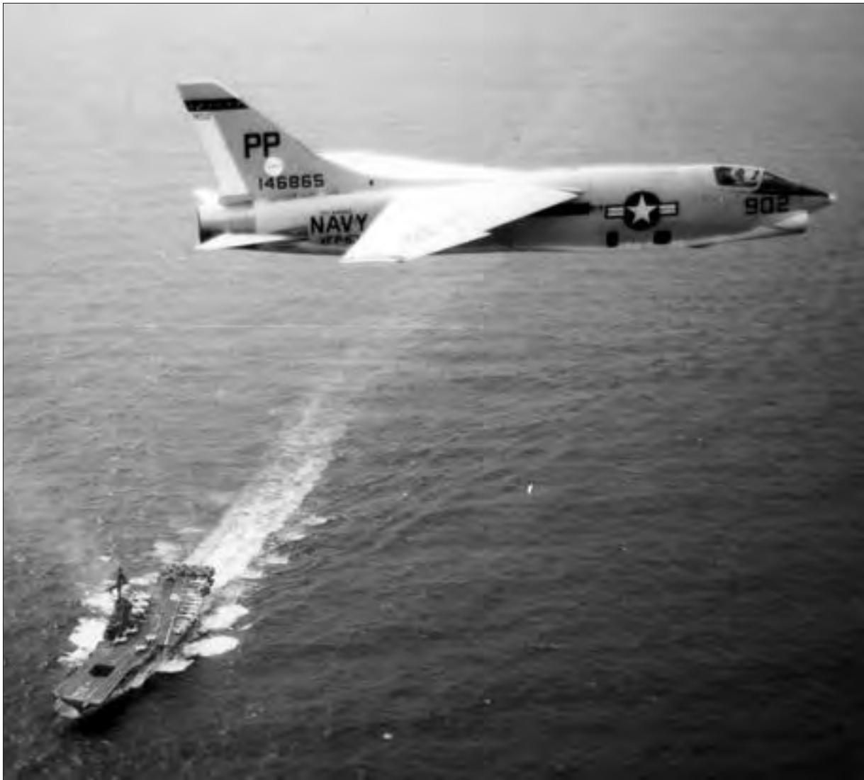
An RF-8A Crusader aerial reconnaissance plane of Light Photographic Squadron 63, involved in air operations in Laos during December 1964, flies over carrier Ticonderoga (CVA-14).

no-holds-barred air assault on North Vietnam to achieve victory. President Johnson, however, feared that a major war in Southeast Asia would derail his Great Society and other domestic programs. Secretary McNamara persuaded the President that a judicious, carefully controlled application of military force would bring success as it had in the Cuban Missile Crisis of 1962. Both men believed they could compel Hanoi to give up the fight through military pressure and diplomacy without triggering Chinese or Soviet intervention.