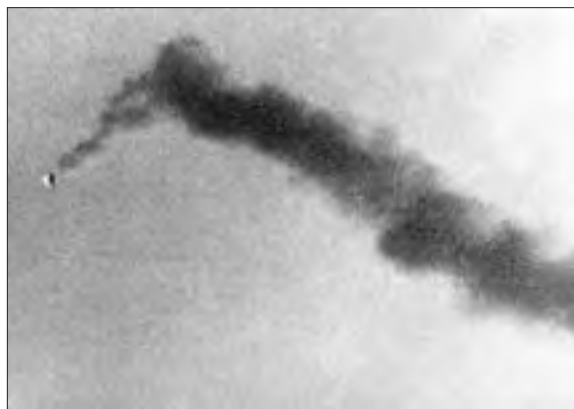
The mid-air destruction of a North Vietnamese MiG-17 by a Terrier missile fired from guided missile frigate Sterett (DLG-31).

weapon off North Vietnam shot down at least three MiGs, Biddle (DLG-34) destroyed two planes, and Sterett (DLG-31) claimed another. ♪