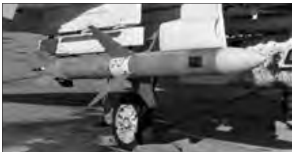
A pair of Attack Squadron 25 A-7 Corsairs, armed with AGM-45 Shrike antiradiation missiles and Mark 82 bombs carry out an Iron Hand mission in North Vietnam during 1969.