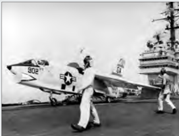
A catapult officer prepares to give the launch signal that will propel the RF-8A Crusader photographic reconnaissance plane skyward for its mission over Laos in mid-May 1965.

For its new mission, the Navy fitted the RA-5C with a sensor canoe under the fuselage that contained five cameras, side-looking airborne radar, infrared mapping, and electronic countermeasures gear. The plane could also carry an electronic countermeasures package in its bomb bay in place of one of three auxiliary fuel tanks. The aircraft also boasted two wing-mounted, high-intensity strobe flashes to illuminate ground targets during night missions. Integrated operational intelligence centers introduced to the large-deck carriers just before the war downloaded an RA-5C's mission information