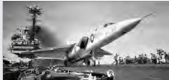
An RA-5C Vigilante reconnaissance plane ready for launch from carrier Independence (CVA-62).

Phantom II and Navy RA-5C Vigilante reconnaissance planes as strike operations, so Washington called them off after a few weeks. Afterward, Mach 3, high-altitude SR-71 Blackbird aircraft carried out the reconnaissance missions usually at altitudes up to 100,000 feet, far above the effective range of the SA-2 missile. On a standard mission, a Blackbird took off from Kadena Air Base on Okinawa and landed at Takhli Royal Thai Air Force Base in Thailand after photographic runs over North Vietnam. Reconnaissance satellites and a few unmanned drones also flew missions over North Vietnam, but the poor-quality intelligence