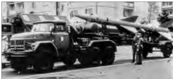
Surface-to-air missiles such as this Soviet-made, 35-foot-long Guideline carried a powerful warhead and significantly strengthened the North Vietnamese air defense system.

The next step in the effort to bring pressure against Ho Chi Minh's government occurred on 30 August 1967, when Oriskany planes dropped