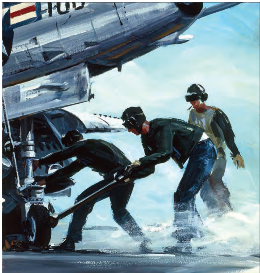
Navy Art Collection

The bridge at Xom Ca Trang 60 miles north of the Demilitarized Zone shows the effects of a carrier strike. Attack planes from Coral Sea took out one of the structure's center spans with Bullpup missiles on 16 April 1965.