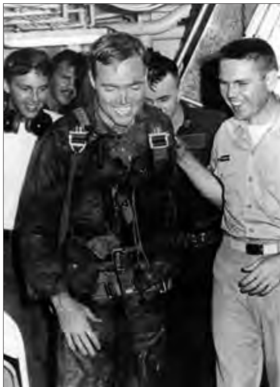
Squadronmates share a moment of joy with Lieutenant Commander John Holtzclaw after his rescue from the shoot-down site in North Vietnam by Lieutenant (j.g.) Clyde Lassen and the crew of his SAR helicopter.

While a number of downed fliers were rescued, many more were not, especially those who went down inland. Often injured during their violent ejection from badly damaged and burning planes, aircrews landed amid crowds of angry villagers who frequently beat them before the local militia or troops intervened and dispatched them to the prison camps around Hanoi. On many occasions, North Vietnamese forces set traps for the helicopters and other aircraft attempting to rescue pilots. One ruse was to use captured survival radios and to spread parachutes to lure the SAR planes in close for attack by hidden anti-aircraft guns. Navy and Air Force SAR units retrieved only a small number of men who went down in North Vietnam or Laos, but the SAR crews willingly took great risks to rescue downed aviators, who were clearly grateful for that dedication.