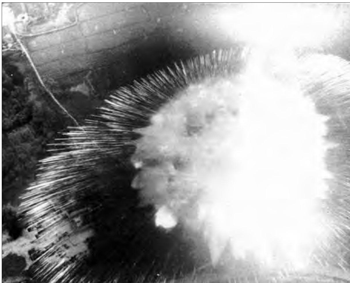
An SA-2 missile explodes below a carrier plane sending thousands of pieces of deadly shrapnel in all directions.

The Soviet Union provided thousands of missiles, launchers, and fire-control radar sets to North Vietnam during the war. Moscow also trained North Vietnamese air defense personnel in the operation of these plane killers who became especially adept at coordinating SAM and anti-aircraft artillery defenses and overcoming American