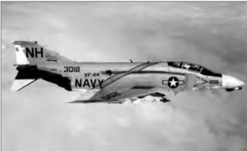
NHHC VN Collection

Navy service in 1962, Phantoms first saw combat in August 1964, when F-4s from Constellation (CVA-64) escorted attack aircraft that bombed targets in North Vietnam following the Gulf of Tonkin incident. The first air-to-air encounter came on 17 June 1965, when two Phantoms from Midway (CVA-41) tangled with four North Vietnamese MiG-17 fighters. The Phantoms