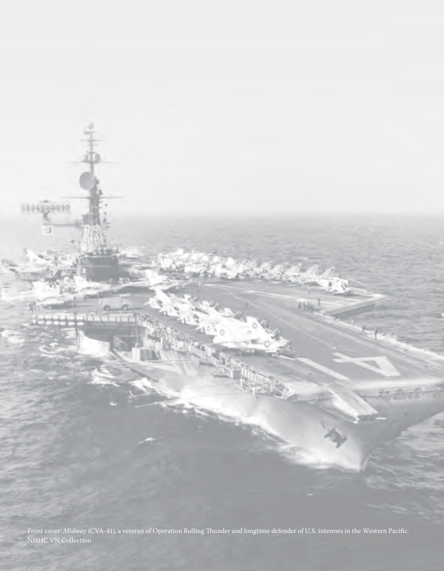
Front cover: Midway (CVA-41), a veteran of Operation Rolling Thunder and longtime defender of U.S. interests in the Western Pacific.