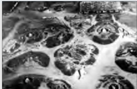
A U.S. photoreconnaissance plane flies so low and fast over this North Vietnamese antiaircraft site that gunners, some seen in the upper right of this image, have no time to react. Other American air units were not so successful evading enemy air defenses.