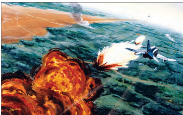
Napalm Along the Buffer Strip by Larry Zabel. Oil on metal.

After the bombing halt, the Navy and the Air Force continued to fly reconnaissance missions north of the 19th parallel to ensure that the enemy was not building up forces for another offensive. Hanoi, however, characterized the flights by unarmed Air Force RF-4