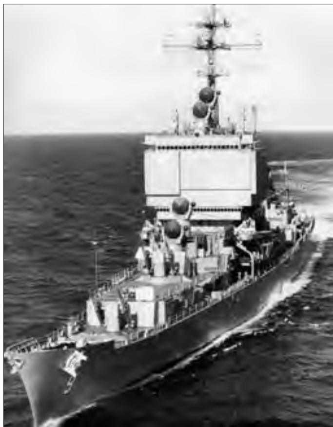
Nuclear-powered guided missile cruiser Long Beach (CGN-9) armed with Talos and Terrier surface-to-air missiles steams through the Western Pacific during the war.

The Vietnam War saw the first combat use of another surface-to-air missile, the RIM-2 Terrier, an anti-aircraft weapon that could engage targets 20 miles or more from the ship and at altitudes up to 80,000 feet. A 1,820-pound, solid-propellant rocket booster launched the 1,180-pound Terrier. The weapon was a beam-riding missile with semi-active terminal homing. Introduced to the fleet in 1955, RIM-2s armed 40 U.S. aircraft carriers, cruisers, frigates, and destroyers (as well as a number of foreign warships). Despite teething problems, the Terrier proved to be a reliable weapon. Later in the war, U.S. guided missile frigates employing the