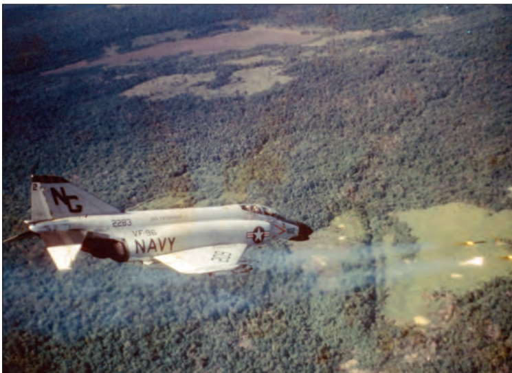
NHHC VN Collection

Vietnam. The MiG-21—given the U.S.-NATO codename Fishbed—was a delta-wing aircraft, which, like its predecessors from the Mikoyan-Gurevich design bureau, was noted for its simplicity and high performance. The MiG-21 was a specialized, Mach 2+ air-superiority fighter; it was highly maneuverable and relatively easy to fly. Early variants had two 30mm cannon and two Atoll air-to-air missiles, heat-seeking weapons similar to the American Sidewinder. Later MiG-21s deleted the guns in favor of four Atoll missiles with a more advanced radar. Subsequent variants carried both a 37mm cannon and radar as