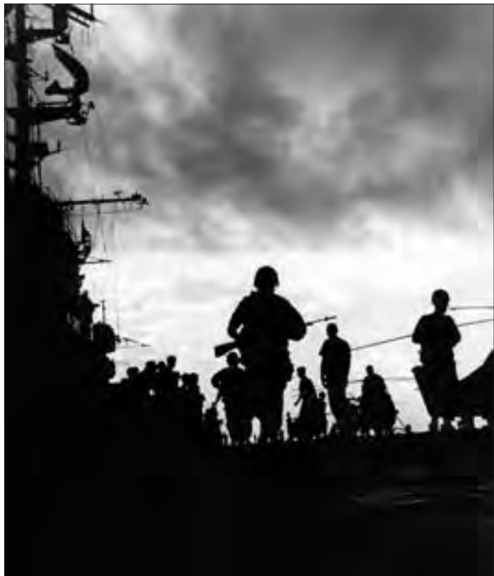
In the early morning of 26 August 1966, Marines move across the flight deck of amphibious assault ship Princeton (LPH-5) to board helicopters that will transport them to South Vietnam's Rung Sat Swamp south of Saigon. The troops, supported by Seventh Fleet carriers at Dixie Station, took part in amphibious Operation Jackstay.

Carrier-based and other allied air support prevented the enemy from killing or capturing the survivors and permanently occupying the camp. From 10 to 14 June, Oriskany (CVA-34)'s Carrier Air Wing 16, along with other U.S. and South Vietnamese air units, strafed enemy troops, flattened overrun buildings, and helped friendly ground forces break the siege.