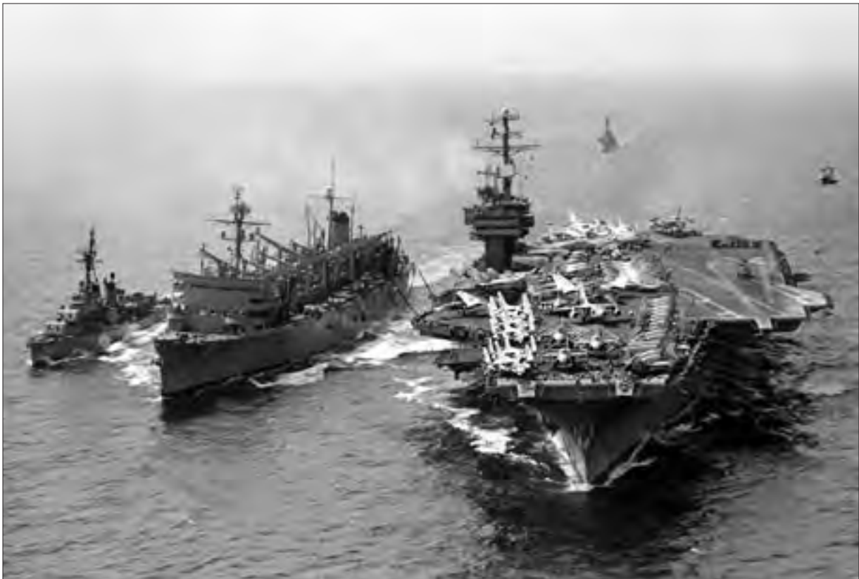
NHHC VN Collection

24 hours a day, seven days a week was the Navy's at-sea replenishment system that had been proven in combat during World War II and the Korean War, and strengthened in the Vietnam War. The Seventh Fleet's Mobile Logistics Support Force (Task Force 73) operated ammunition, stores, repair, and salvage ships; tugs; and oilers. In a typical underway replenishment (UNREP), logistic ships moved alongside combatants to provide them, via high-lines and hoses strung between the ships, "beans, bullets, and black oil." The war saw a significant innovation to the UNREP method with the use of helicopter transfers—vertical replenishments—of parts and munitions. During the war, the Navy introduced fast combat support ship Sacramento (AOE-1) and combat stores ship Mars (AFS-1) to the logistic fleet. Both types combined the functions of many auxiliaries, carrying vast quantities of ammunition, fuel, and other supplies. ∫