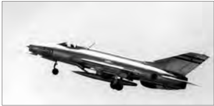
A Soviet-made, delta-wing MiG-21 Fishbed fighter.