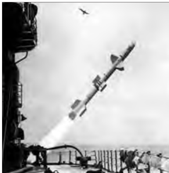
A Talos missile blasts skyward from a Navy cruiser during a test of the weapon’s guidance system in early 1968.

On 11 May 1966, Long Beach , operating in the northern Gulf of Tonkin, launched Talos missiles against North Vietnamese MiG fighters in the first—albeit unsuccessful—U.S. attempt to down hostile aircraft with surface-to-air missiles. On five separate occasions that month, North Vietnamese aircraft tried but failed to strike U.S. surface ships along the coast and lost two MiGs in the process. In contrast, on 23 May 1968, Long Beach fired two Talos missiles