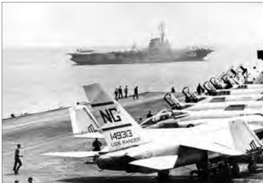
Carriers Ranger (CVA-61) (foreground) and Coral Sea (CVA-43) launched heavy strikes against targets below the 20th parallel of North Vietnam during the spring of 1965.

failed to achieve the expected high kill ratios, U.S. pilots and military leaders recognized that close-in dogfighting was not a relic of the past. The long-range missile's design philosophy that had created the Navy's gunless F-4 degraded the plane's close-in fighting ability. Aviation historian Lon Nordeen aptly observed that "anyone who thought the ten-year-old MiG-17 was an obsolete aircraft with no capability against modern U.S. fighting machines was sadly mistaken."