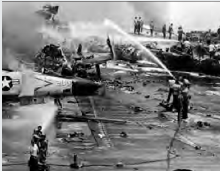
Amid the wreckage of combat aircraft, firefighting teams battle the blaze that wracked carrier Forrestal (CVA-59) in July 1967. The tragedy provided lessons learned for the Navy's damage control training for years afterward.

The fire spread rapidly through the after end of the stricken ship as flames reached and exploded other aircraft fuel tanks and ordnance. Despite the obvious danger, the flight deck crew rushed forward to man water hoses and foam dispensers and to toss bombs and rockets over the side. One 130-pound