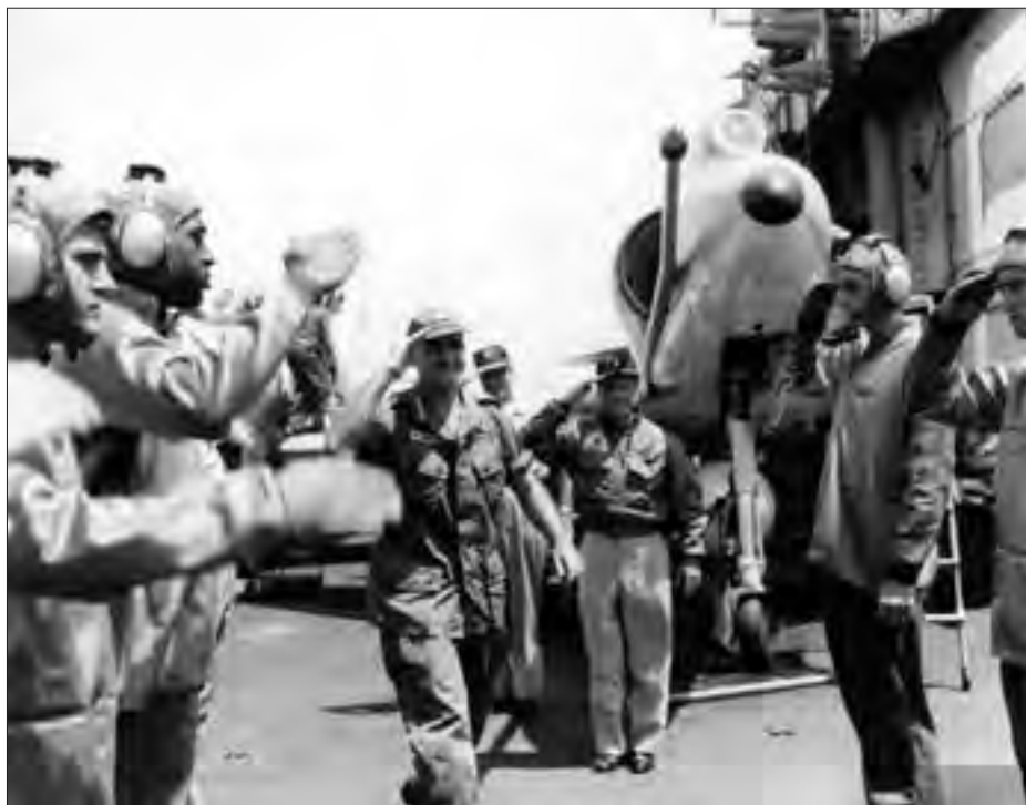
General William C. Westmoreland, Commander U.S. Military Assistance Command, Vietnam, returns the salute of Rear Admiral Henry L. Miller, Commander Task Force 77 and side boys of carrier Ranger (CVA-61) in March 1965. The general's advocacy led the Navy to establish the carrier staging area southeast of Cam Ranh Bay known as Dixie Station.

Pacific Fleet commander Admiral Roy L. Johnson, following a request by General Westmoreland, directed the establishment of Dixie Station, a carrier staging area about 100 miles southeast of Cam Ranh Bay at 11° N and 110° E. The setup of Dixie Station meant that of the four carriers then being