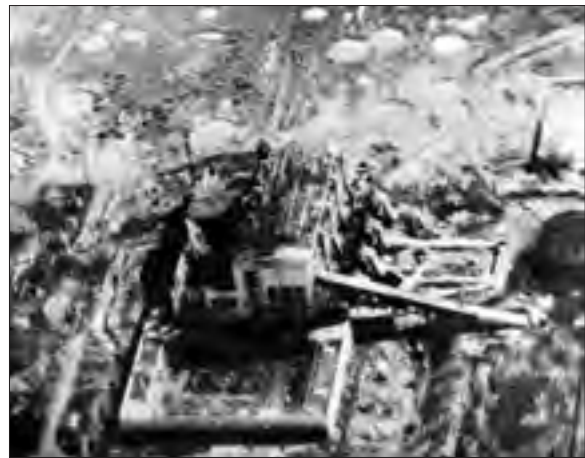
The thermal power plant at Uong Bi, North Vietnam, struck several times by Task Force 77 carrier planes.