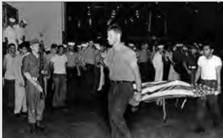
Somber and still shaken Forrestal (CVA-59) crewmembers watch in silence as shipmates transport ashore at the Subic Bay naval base the remains of one of the ship's 134 sailors and aircrewmembers killed in the blaze.