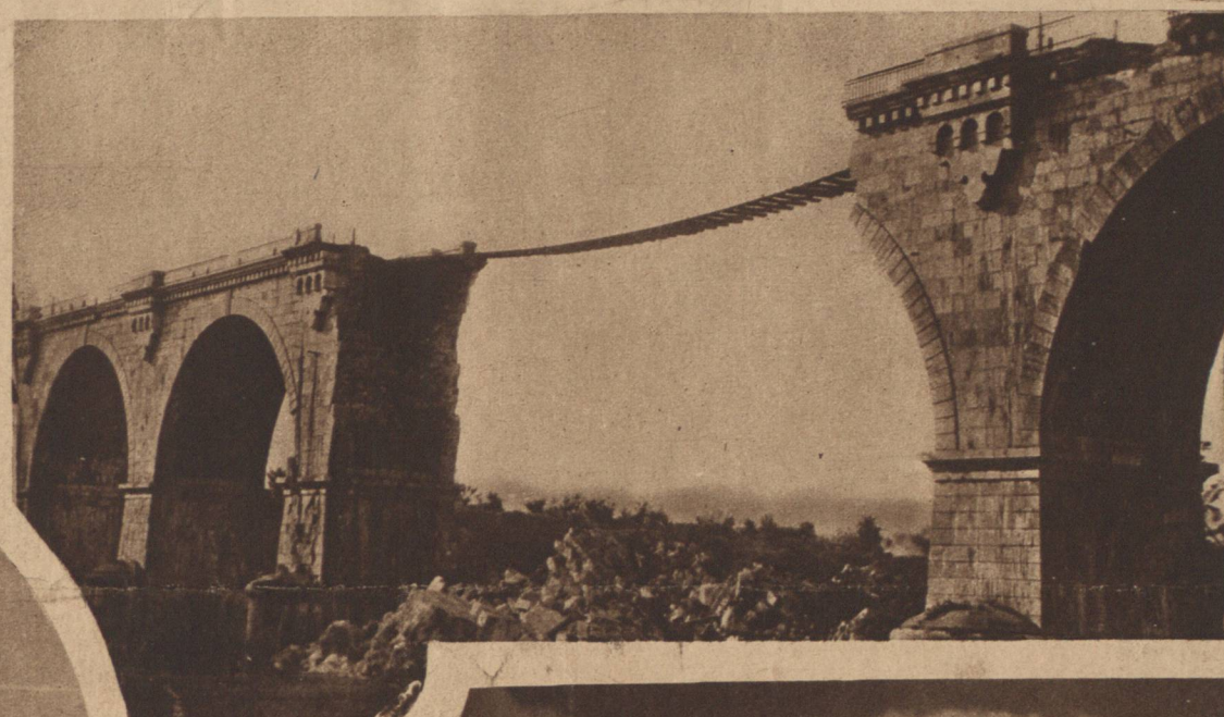
A railway bridge in Gorizia as it was left by the retreating Austrians, who blew it up before the Italian approach.