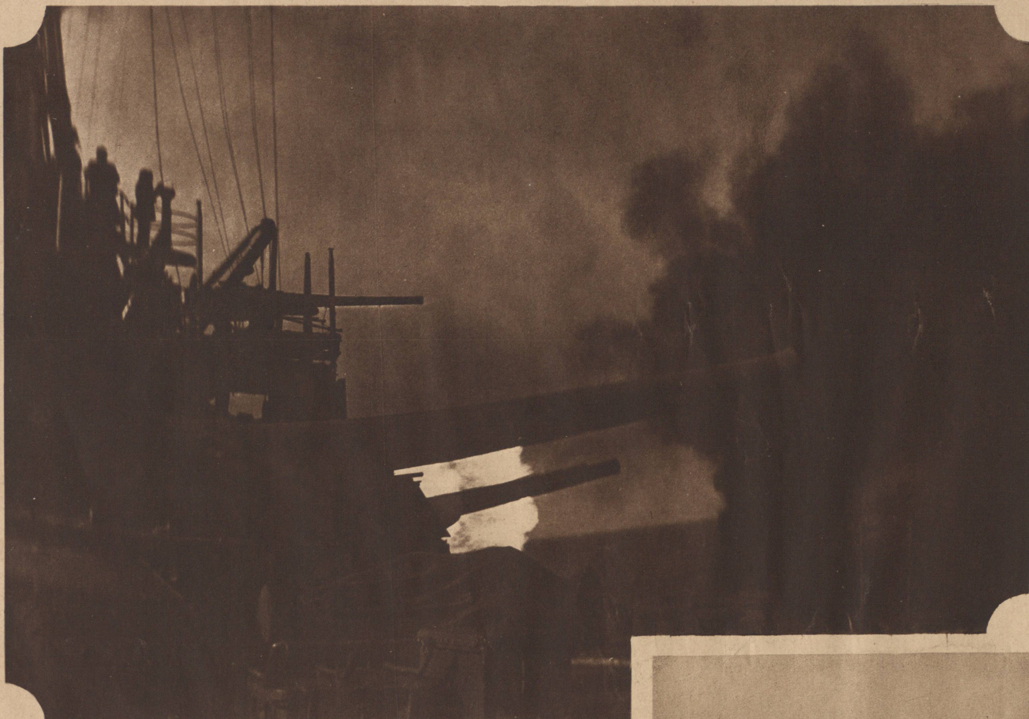
One of Uncle Sam's hounds of the high seas firing a night salvo.