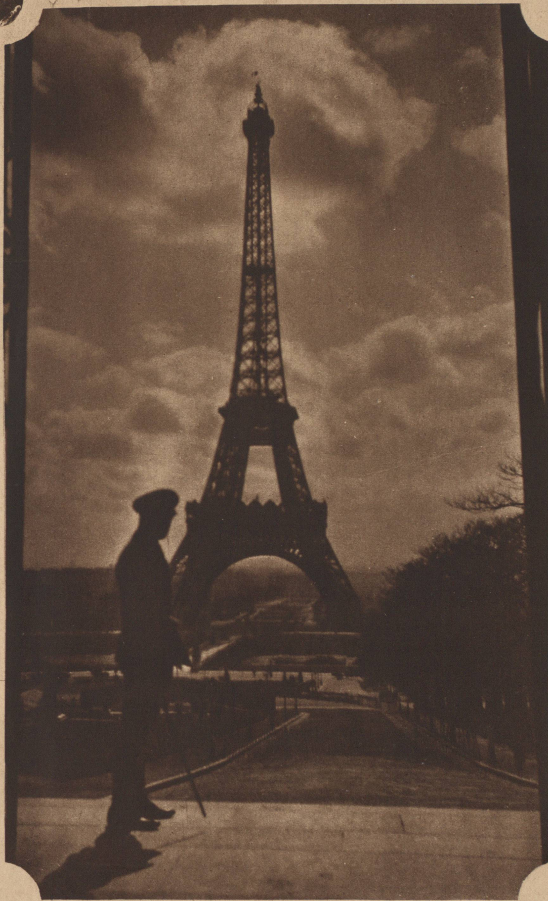
Guarding Paris's most important observation and wireless station, the Eiffel Tower. Stretched across the street is the high iron fence which keeps intruders several blocks away from the structure.