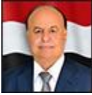
Table I. Yemen Profiles

power to an interim prime minister or vice president. 12 Houthi-Saleh forces reject such a change and have demanded that the United Nations appoint a new special envoy.