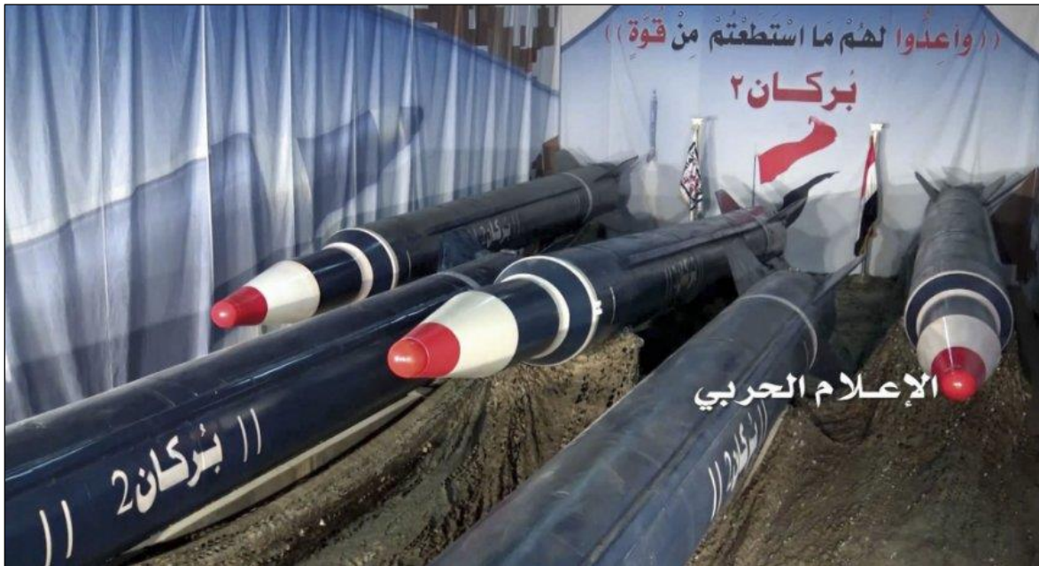
Figure 2. Houthi-Saleh Forces Display the "Burkan-2" Missile