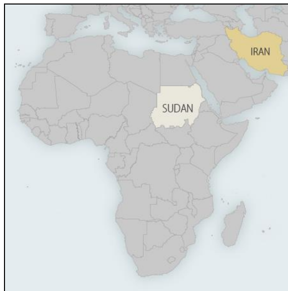
Figure 5. Sudan