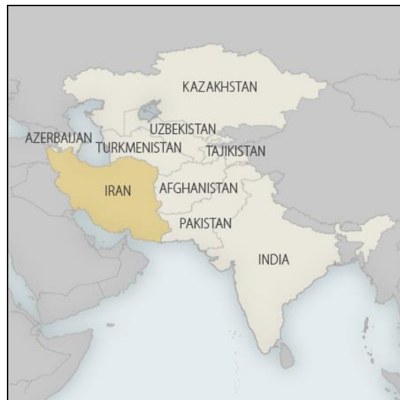
Figure 3. South and Central Asia Region

Most of the Central Asia states that were part of the Soviet Union are governed by authoritarian leaders. Afghanistan, on the other hand, remains politically weak and Iran is able to exert influence there. Some countries in the region, particularly India, apparently seek greater integration with the United States and other world powers and tend to downplay cooperation with Iran. The following sections cover those countries in the Caucasus and South and Central Asia that have significant economic and political relationships with Iran.