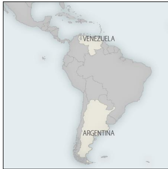
Figure 4. Latin America

President Rouhani has generally expressed only modest interest in further expanding ties in Latin America, perhaps in part because Latin America continues to account for less than 6% of Iran’s total imports. 141 He made his first visit to the region in September 2016—three years into his presidency—in the course of traveling to the annual U.N. General Assembly meetings in New York. He went to several of the countries that Foreign Minister Zarif did when Zarif met with leaders in Cuba, Chile, Bolivia, Ecuador, Nicaragua, and Venezuela in August 2016—the