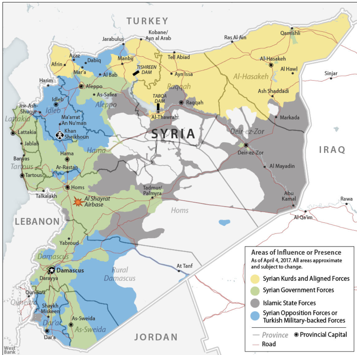
Figure I. Syria: Areas of Influence