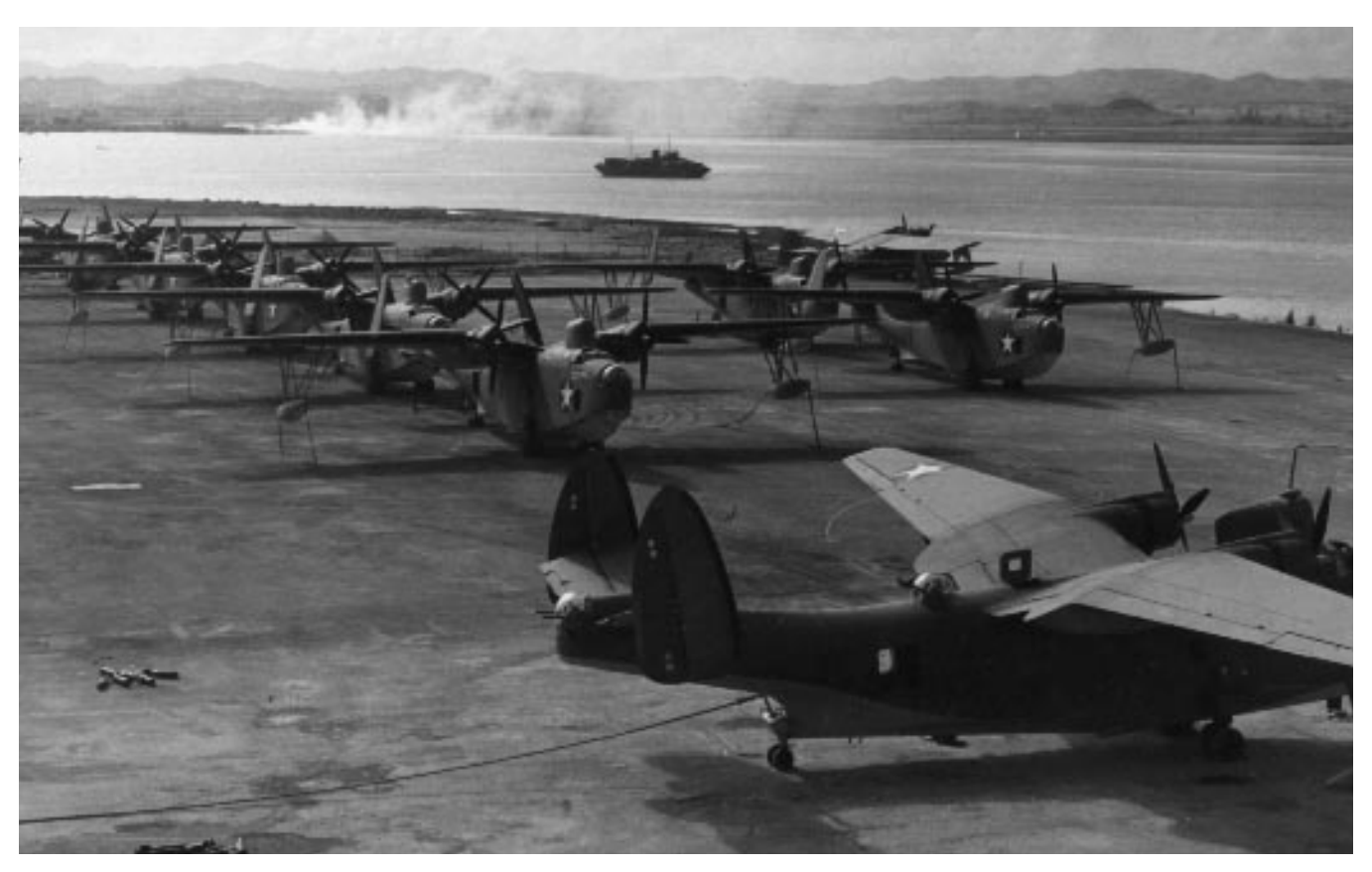
Squadron PBM-3Cs at NAS San Juan, 12 March 1943, 80-G-28394.

1–25 Sep 1943: Attacks were made on U-boats on 1 and 4 September. Both obtained negative results. On 25 September, the squadron moved to a new home port at NAS Floyd Bennett Field, N.Y., placing the squadron under the operational control of FAW-9. Its principal duties remained the same as before, ASW and convoy escort.