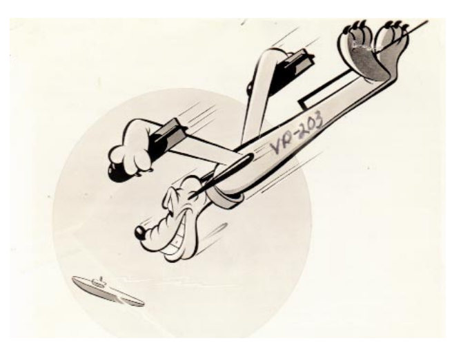
The squadron's Disney insignia that was not approved for use.

Although a design had been submitted by VP-203 in 1943 featuring the Disney character Pluto, it was never