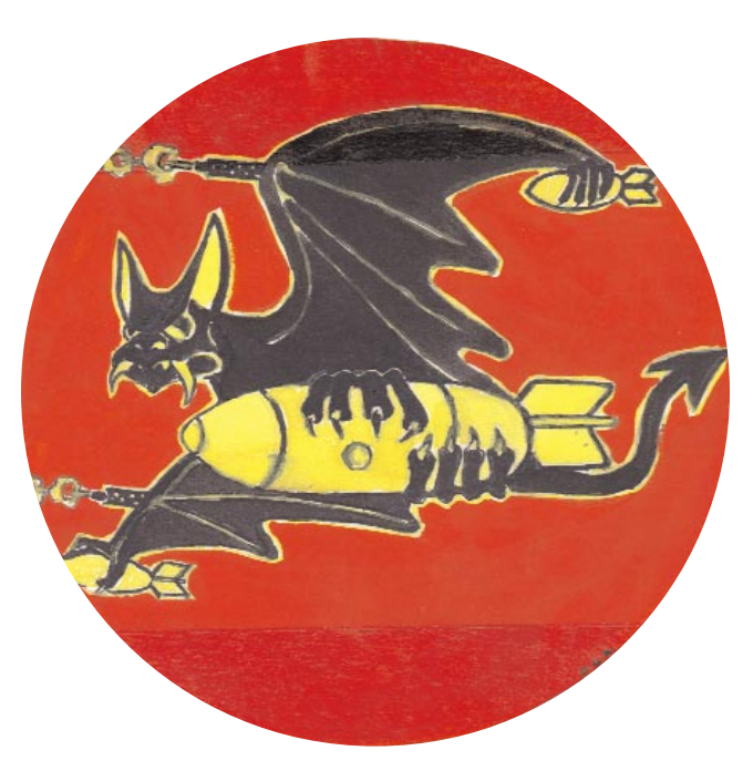
The squadron's bat insignia.

There was no official correspondence in squadron insignia records regarding an approval date for their insignia. However, squadron history records identify