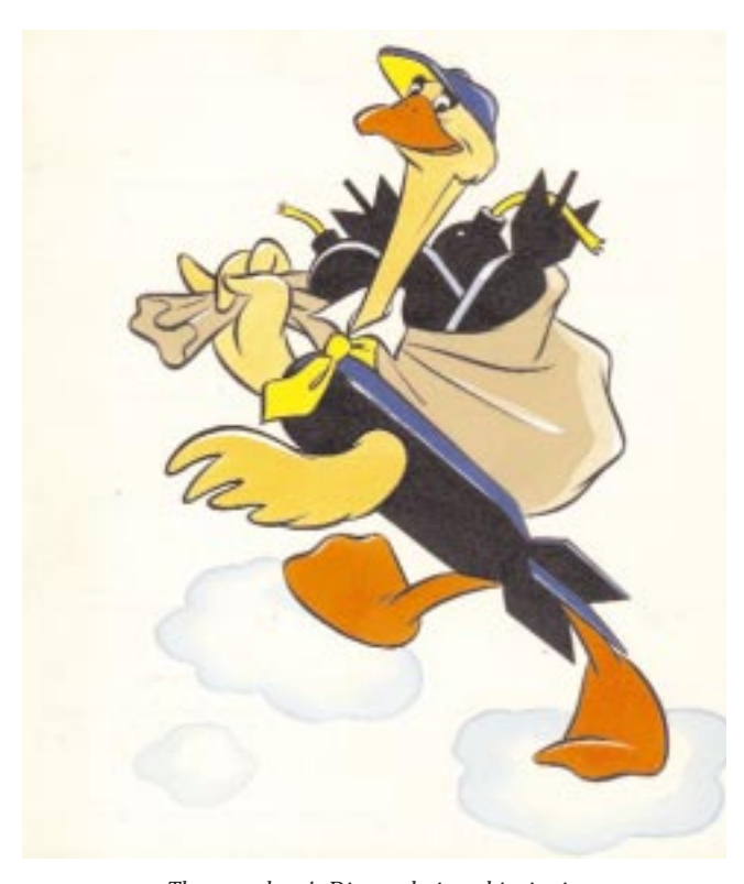
The squadron's Disney designed insignia.

The squadron's only insignia was approved by CNO on 13 June 1945. It was one of many designed by the Disney studio for Navy patrol squadrons during WWII.