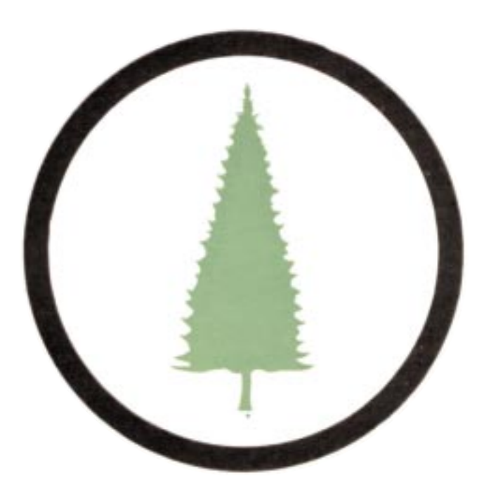
The squadron's pine tree insignia.

The only insignia on record for this squadron was submitted for approval to BuAer shortly after its redesignation from VP-14 to VPB-14 in 1944. It consists of a