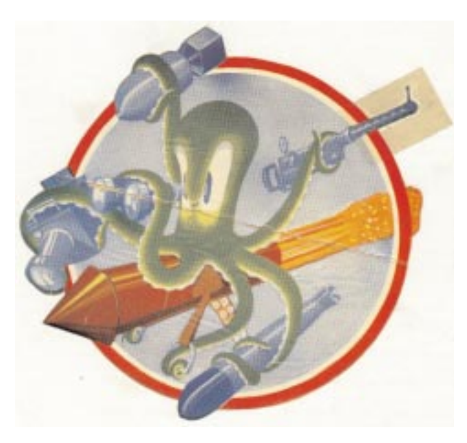
The squadron's cartoon insignia.

VB-150 submitted its request for an insignia twice before convincing CNO that it was truly appropriate. The design was finally approved by CNO on 21 August 1944. The squadron chose the devilfish (octo-