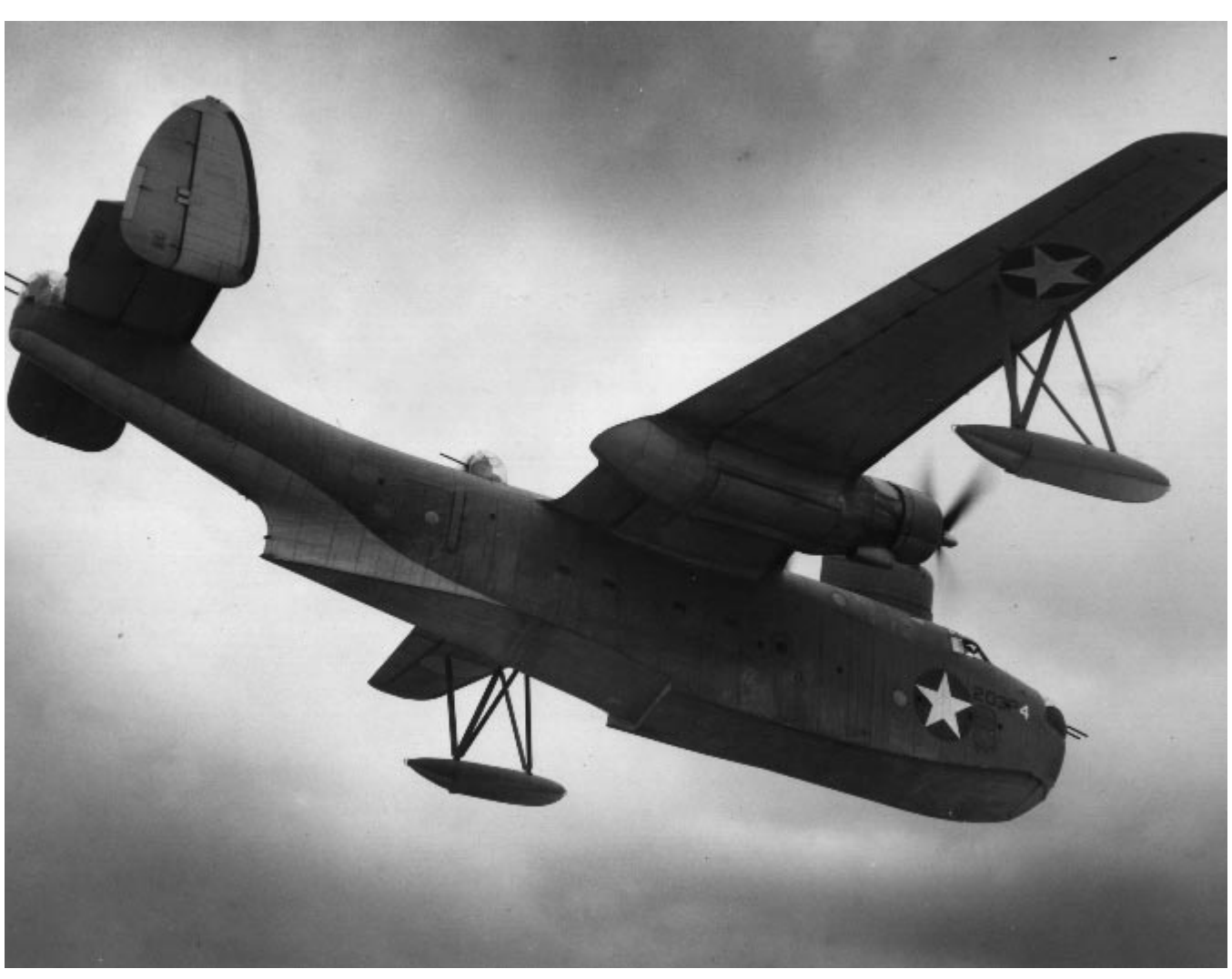
A squadron PBM-3C in flight, 28 May 1943, 80-G-66473.