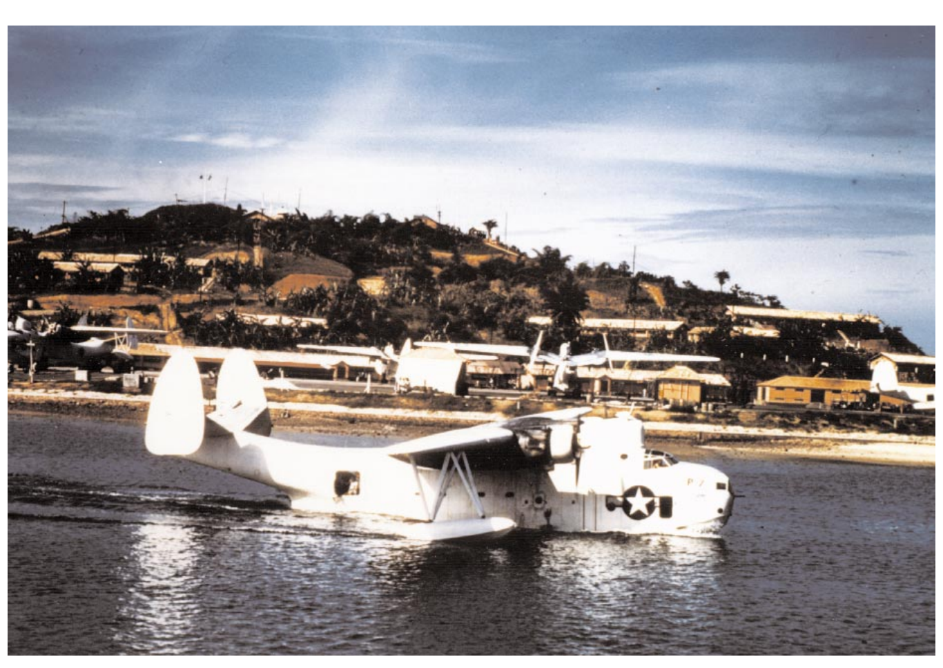
A PBM at a Brazilian air station, circa 1945, 80-G-K-5330.