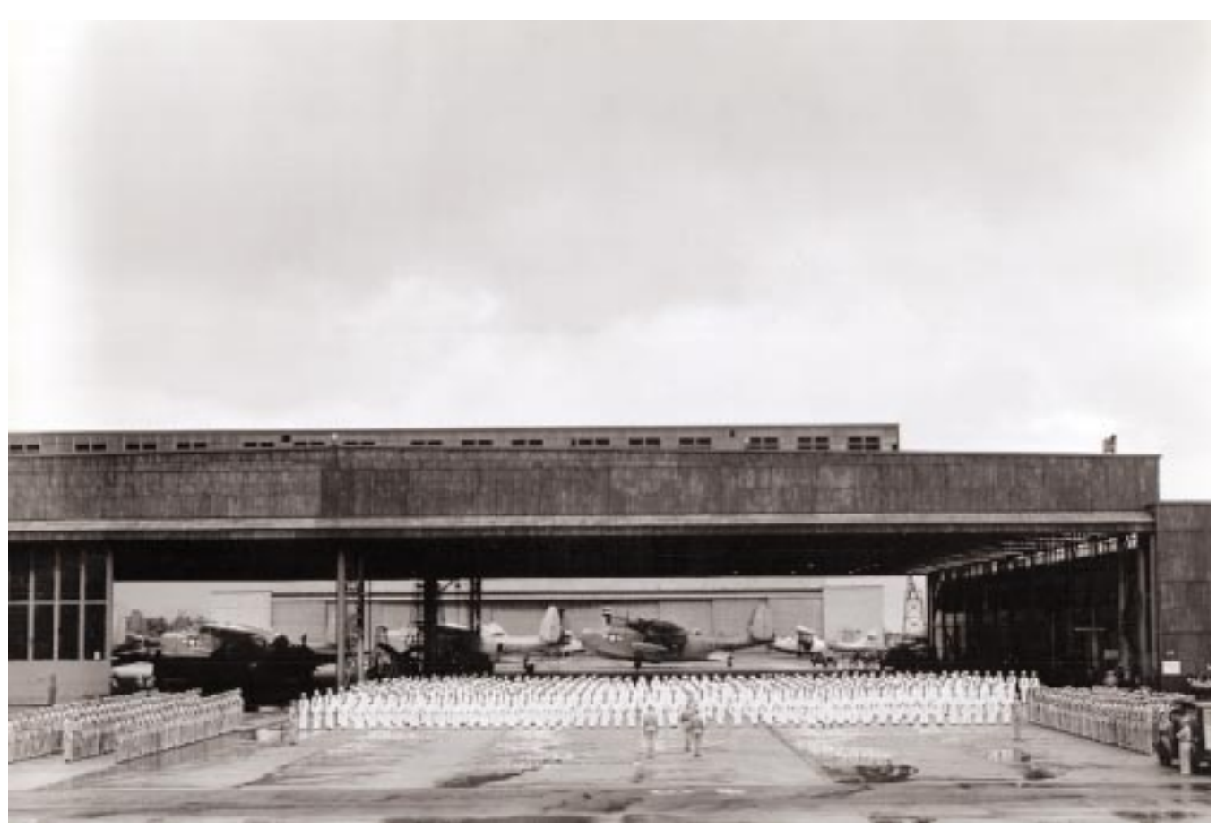
Squadron personnel at quarters at NAS Kaneohe Bay, Hawaii.