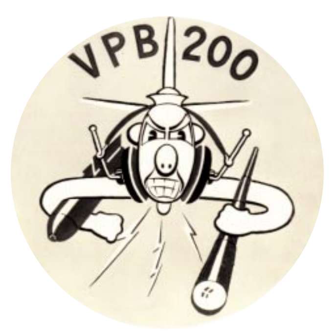
The squadron's cartoon insignia.

The insignia in the squadron history file has no record of formal CNO approval and appears to date