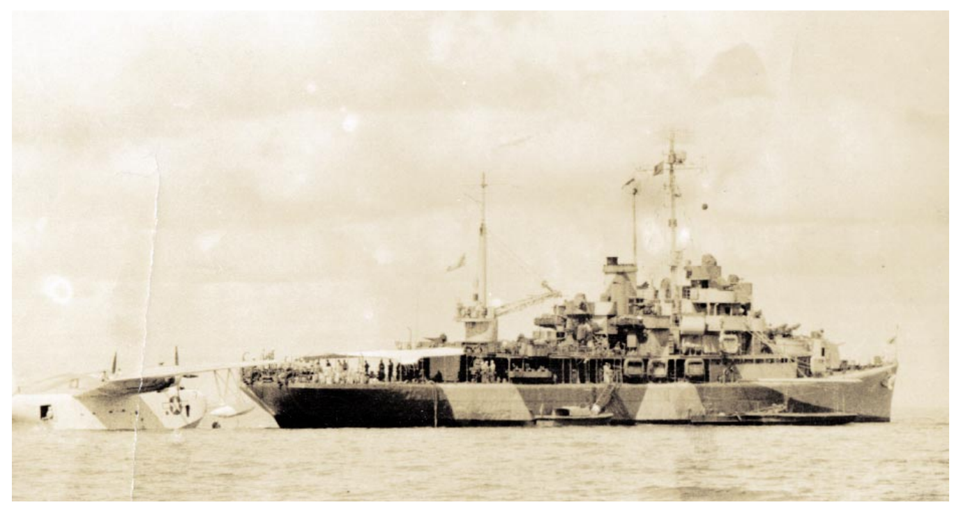
Humboldt (AVP 21) tending a PBM at Bahia, Brazil, April 1945, NH-78793.