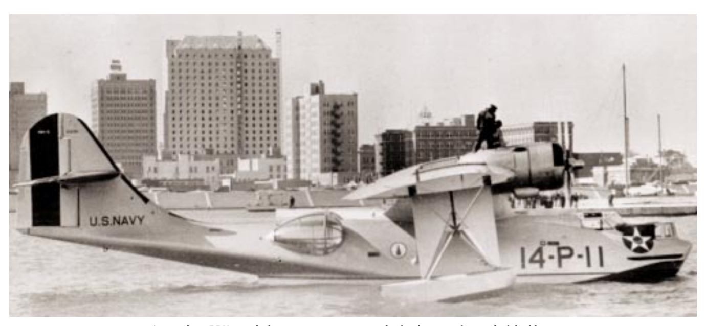
A \ squadron \ PBY-5 \ with \ the \ pine \ tree \ insignia \ on \ the \ fuselage \ just \ forward \ of \ the \ blister.