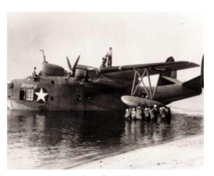
A squadron PBM.

Unit Award Inclusive Date Covering Unit Award None on record.