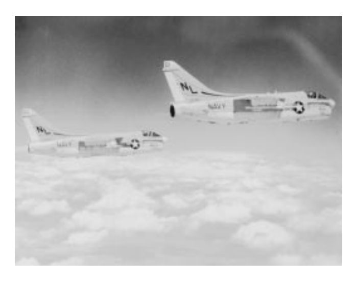
Two squadron A-7E Corsair IIs in flight, 1971.

on 12 May. Combat sorties were flown against targets at Ream Naval Facility, Kompong Som Naval Facility and a Cambodian patrol boat.