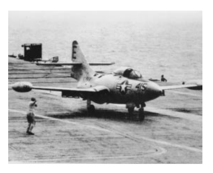
A squadron F9F-5 Panther on the deck of Antietam (CVA 36) during ber cruise in 1953.