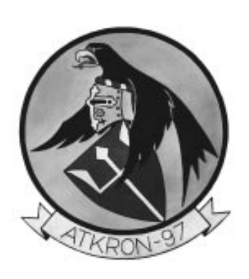
The squadron's hawk and trident insignia.

The squadron's insignia was approved by the CNO on 6 March 1968. Colors for the hawk and shield insignia are as follows: background light blue outlined