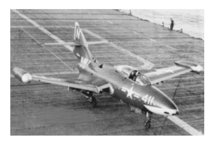
A squadron F9F-5 Panther on the deck of Hornet (CVA 12) during ber world cruise in 1954.