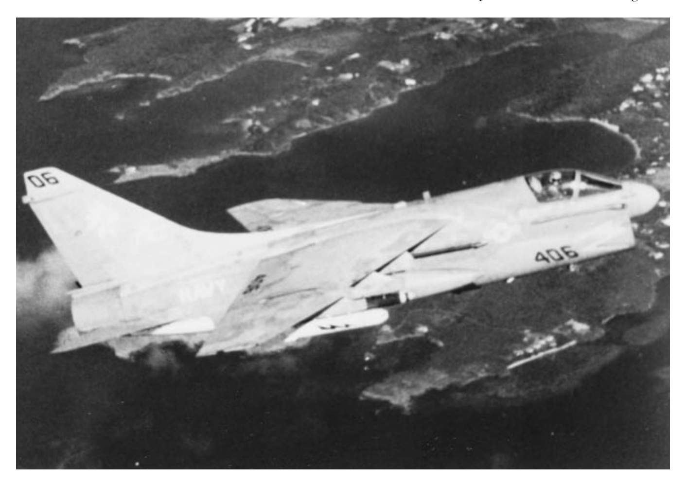
A squadron A-7E Corsair II with a low-vivibility paint scheme, 1984.