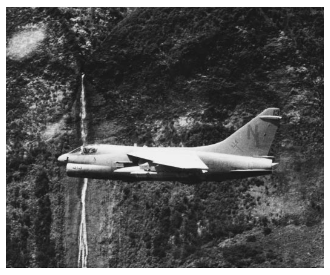
A squadron A-7E Corsair II in flight with its low-visibility paint scheme, 1984.