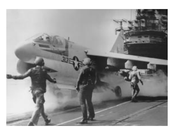
A squadron A-7A Corsair II preparing to launch from Coral Sea (CVA 43) while deployed to Vietnam in 1969.

12 Feb-7 Apr 1990: VFA-82 was embarked in Constellation (CV 64) during its transit from the west coast to the east coast via the Straits of Magellan.