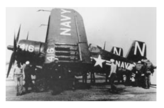
A squadron F4U-4 Corsair on the deck of Philippine Sea (CVA 47) during her deployment to Korea, 1952–1953.

Dec 1989: The squadron participated in Operation Classic Resolve, providing support for the Philippine government during a coup attempt.