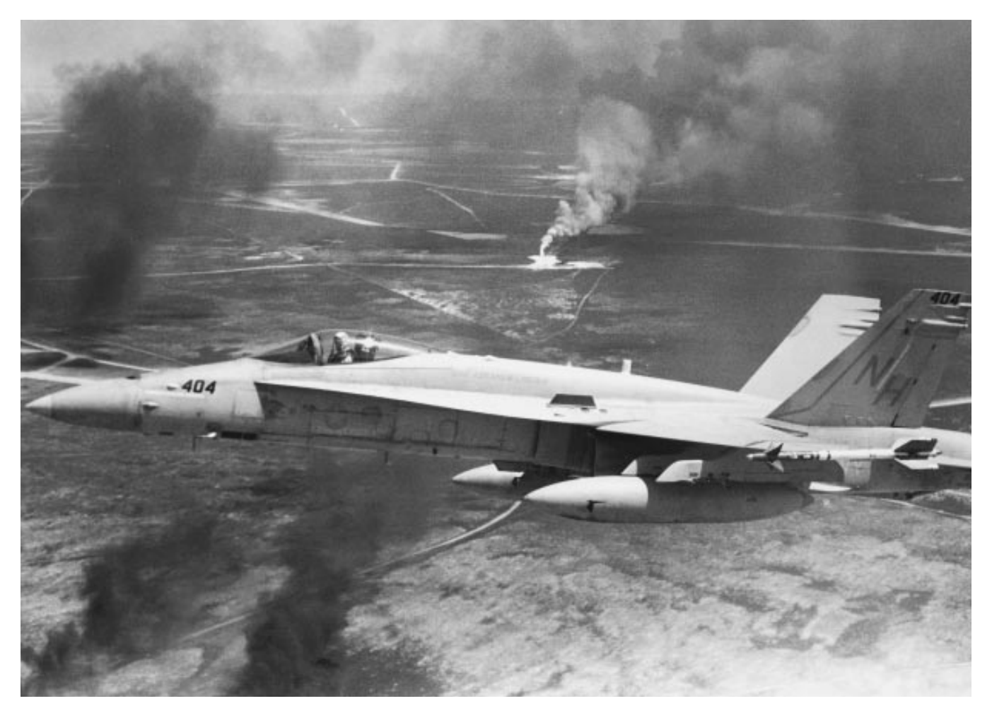
A squadron F/A-18C Hornet flies over the burning oil fields of Kuwait, 1991.