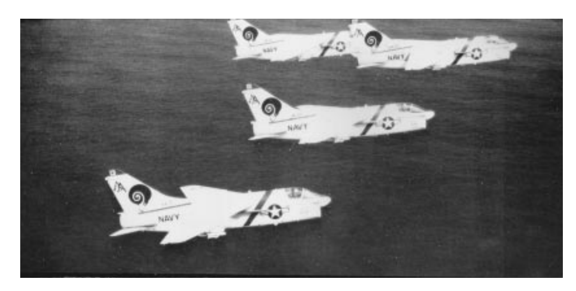
A formation of squadron A-7E Corsair Ils in flight during their deployment to the Med aboard Forrestal (CV 59) in 1974.