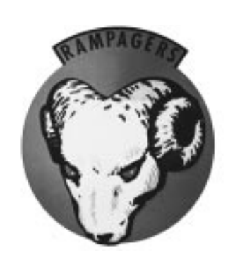
The squadron adopted the ram head insignia in 1957 and has used this design for the past four decades.

A new squadron insignia was approved by CNO on