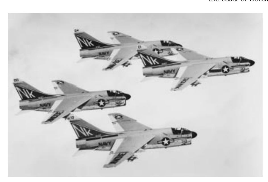
A formation of squadron A-7E Corsair IIs, 1975.

Jul 1988: During the Olympics in Seoul, Korea, Carl Vinson (CVN 70), with VA-97 embarked, operated off the coast of Korea.