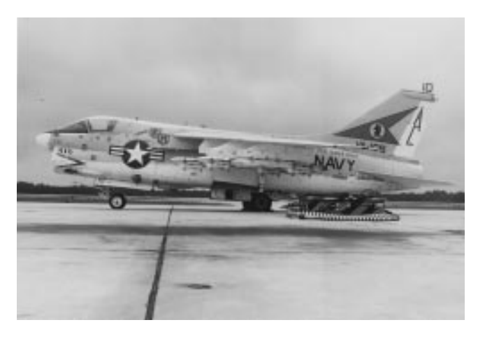
A squadron A-7E Corsair II in 1978.

Jul-Dec 1984: The squadron returned from a sixmonth deployment to MCAS Iwakuni in the western Pacific. It was assigned to MAG-12, 1st MAW. This was the first time a Navy squadron participated in the Marine Corps Unit Deployment Program and the first Navy squadron since World War II to come under the command of a Marine Corps officer. While deployed with the Marines the squadron's major mission was close air support.