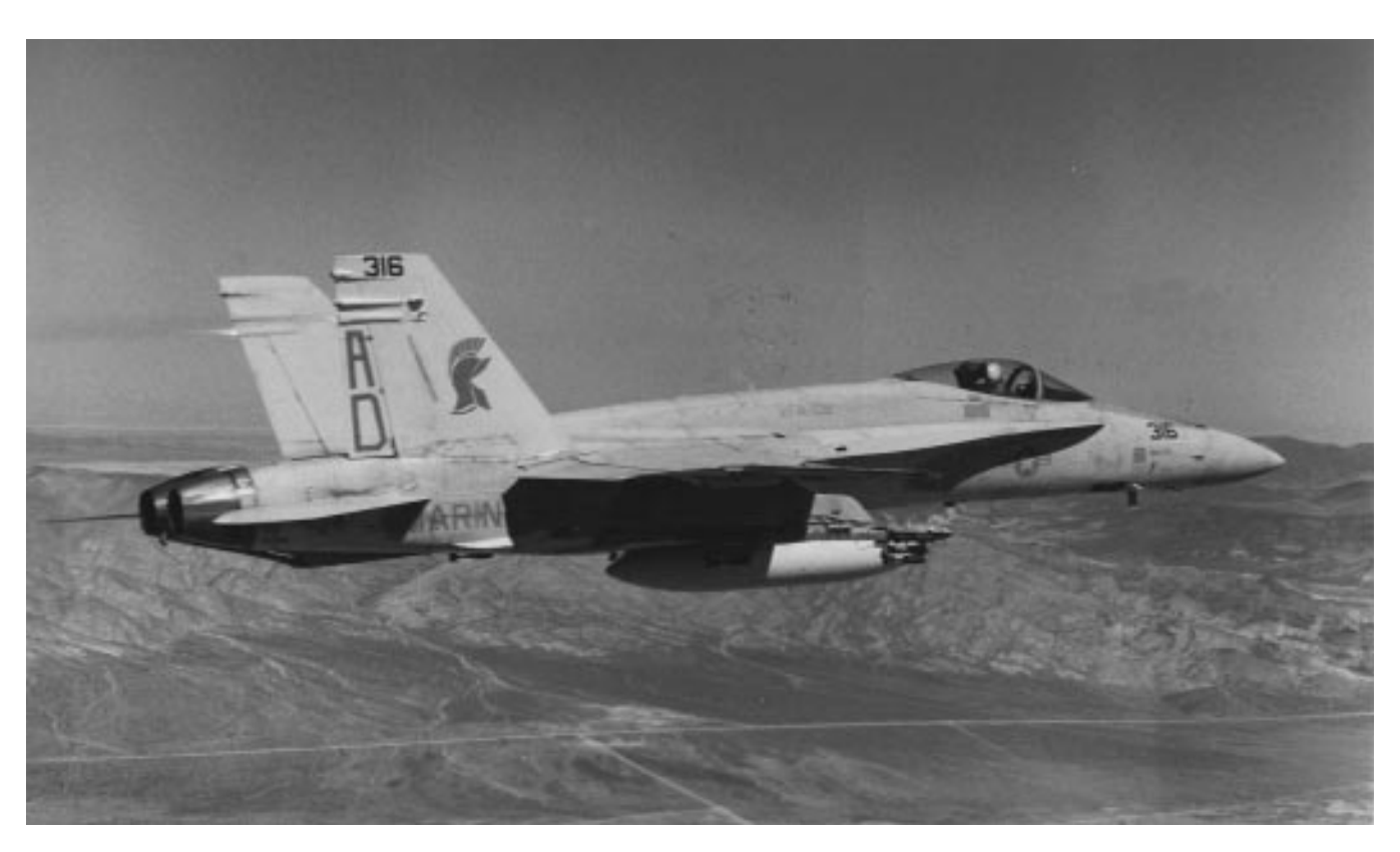
A squadron F/A-18A Hornet in flight, May 1987 (Courtesy Robert Lawson Collection).