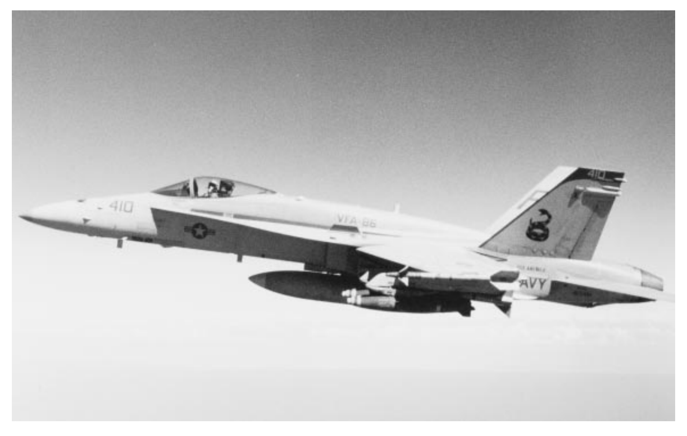
A squadron F/A-18C in flight, 1992.