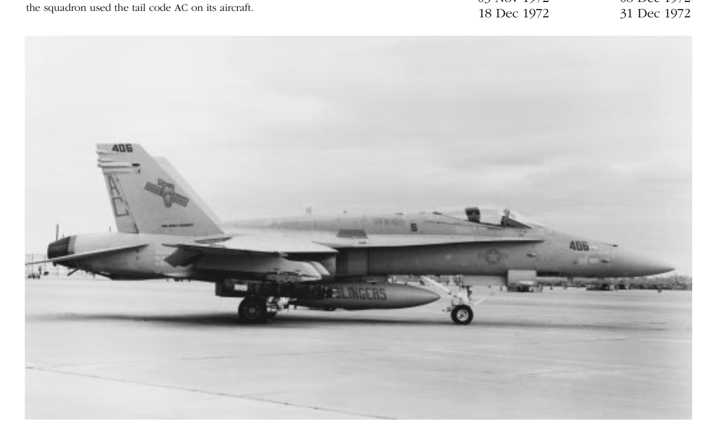
A\ squadron\ F/A-18C\ Hornet\ at\ NAS\ Fallon,\ Nevada,\ March\ 1992\.