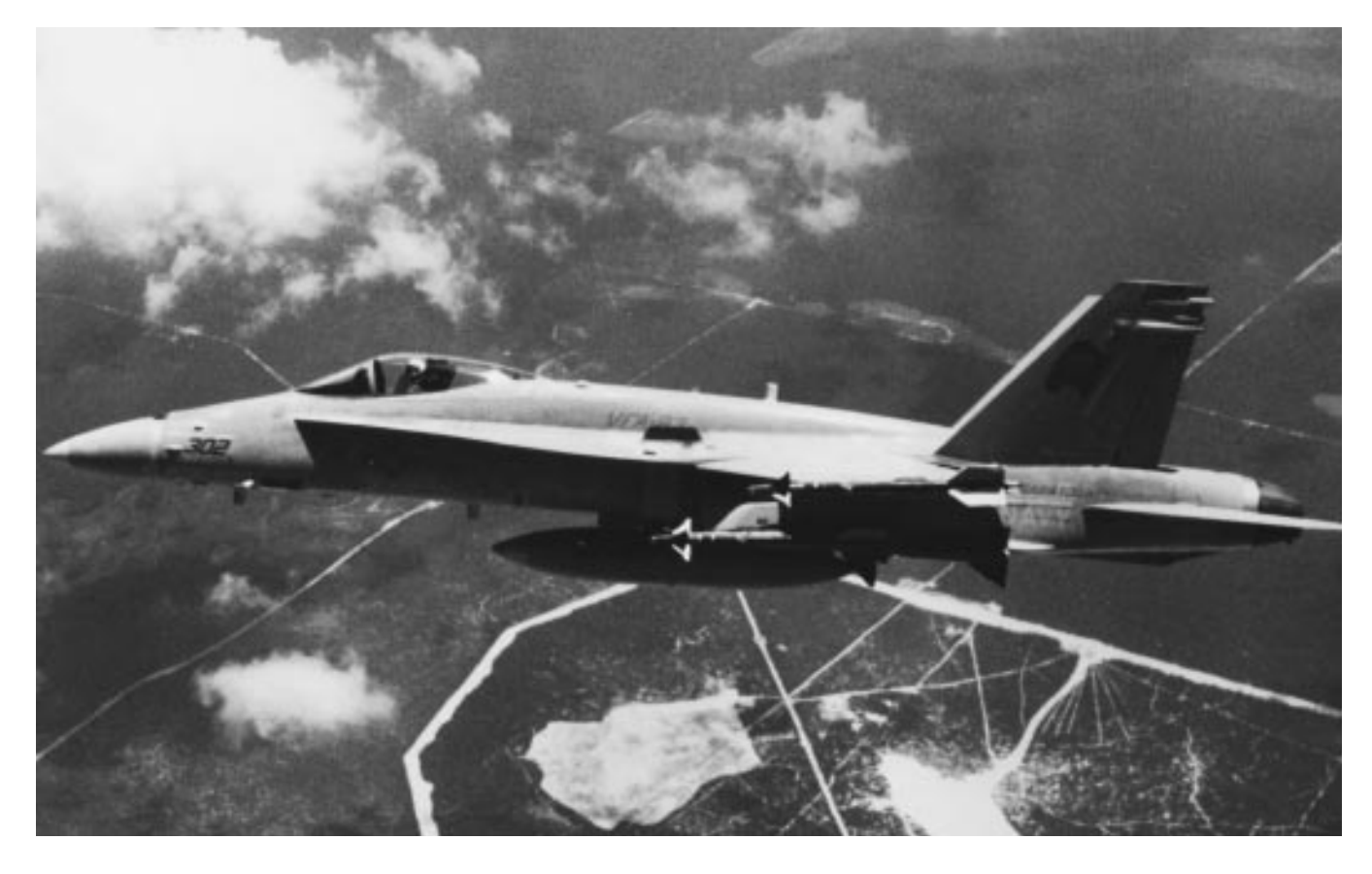
A squadron F/A-18C Hornet over the bombing range in Florida.