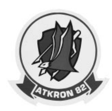
This is the only insignia the squadron has used since it was established in 1967. When it was redesignated VFA in 1987, the squadron changed the ATKRON 82 acronym in the scroll to STRK-FITRON 82.

Redesignated Strike Fighter Squadron EIGHTY TWO (VFA-82) on 13 July 1987. The first squadron to be assigned the VA-82 and VFA-82 designations.