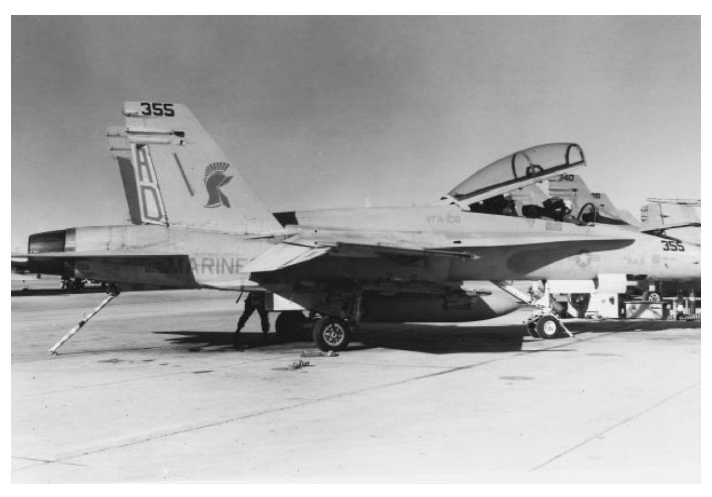
A squadron TF/A-18A Hornet at NAS Fallon, Nevada, March 1986.