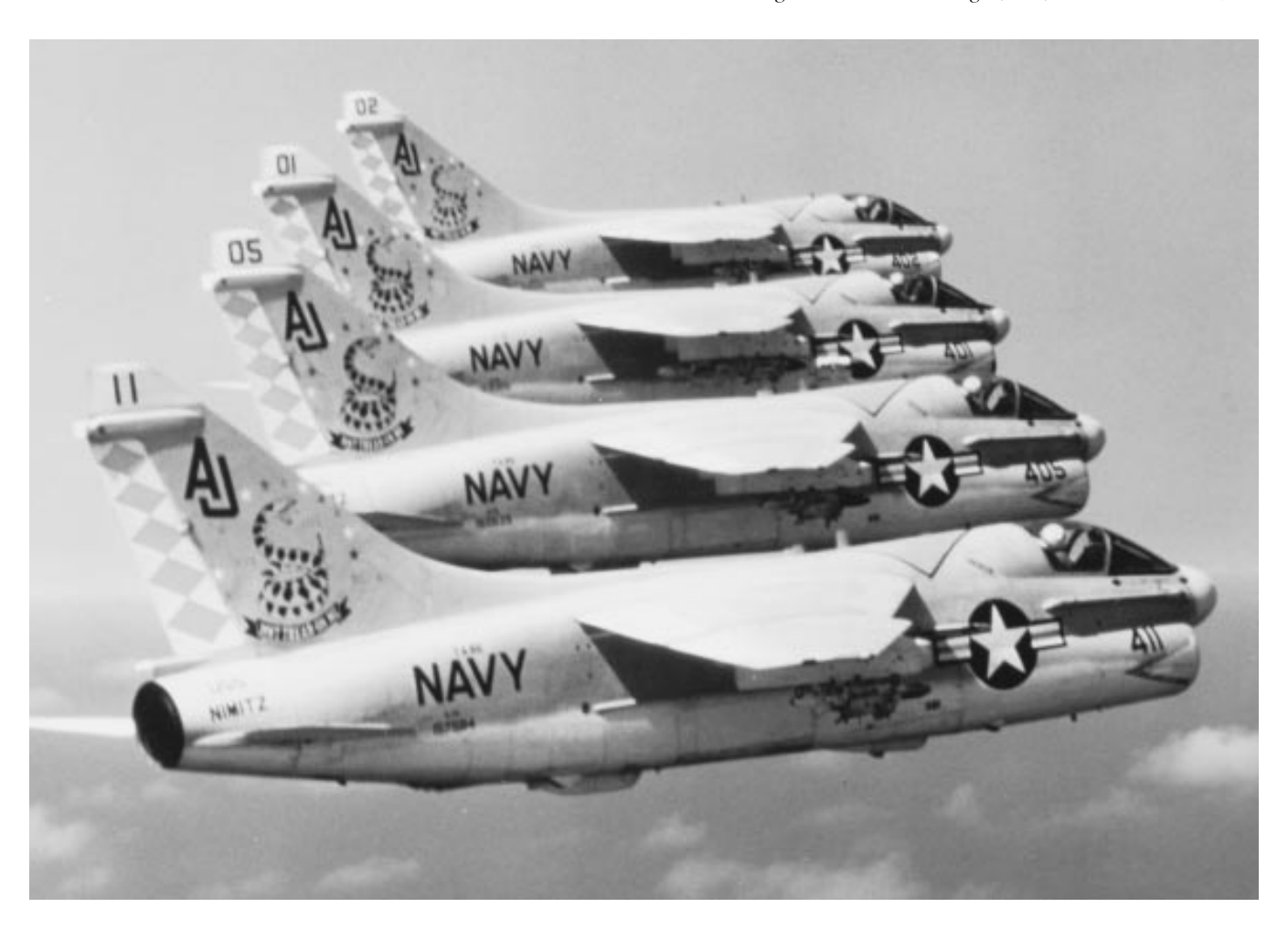
A formation of squadron A-7E Corsair IIs, circa 1978.