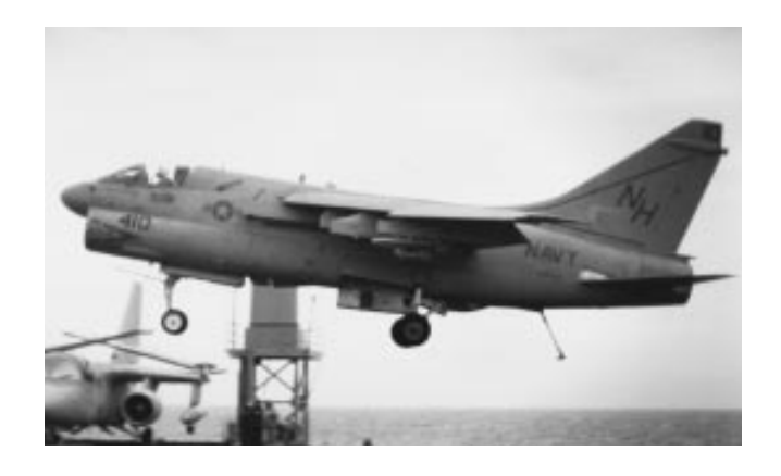
A squadron A-7E Corsair II, in a low-visibility paint scheme, preparing to trap aboard Enterprise (CVN 65) in 1989.