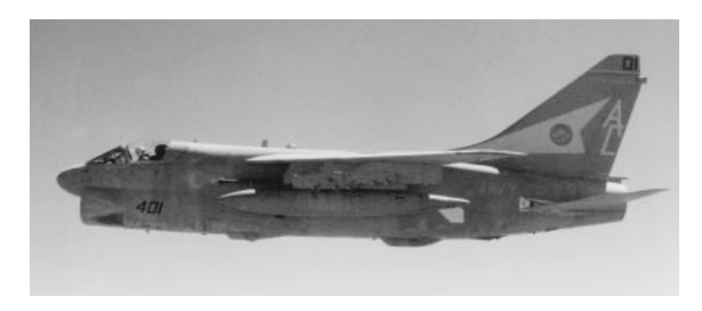
A squadron A-7E Corsair II in flight with low-visibility paint scheme, 1984.