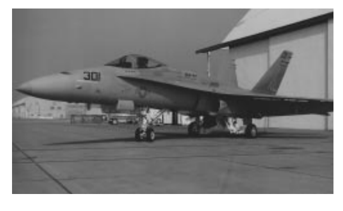
A squadron F/A-18A Hornet at NAS Lemoore, California, 1991.