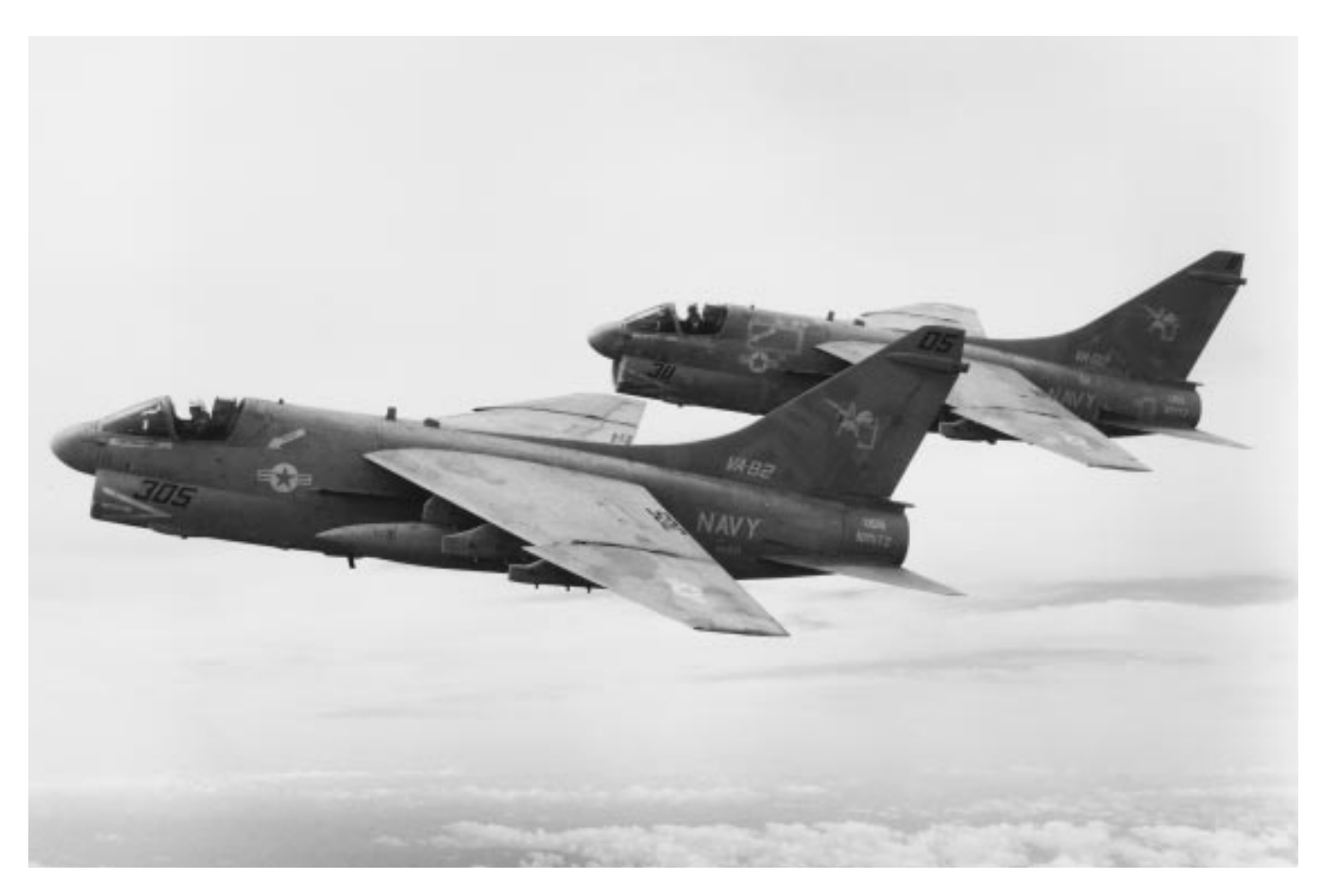
Two squadron A-7E Corsair IIs in flight, showing the low-visibility paint scheme, 1987.