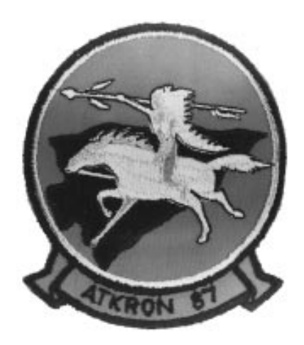
The squadron's Golden Warrior insignia was approved for use in 1968. When the squadron was redesignated VFA, the designation in the scroll was changed from ATKRON 87 to STRKFITRON 87 or VFA-87.

The squadron's insignia was approved by CNO on 29 July 1968. Colors for the insignia are: a red back