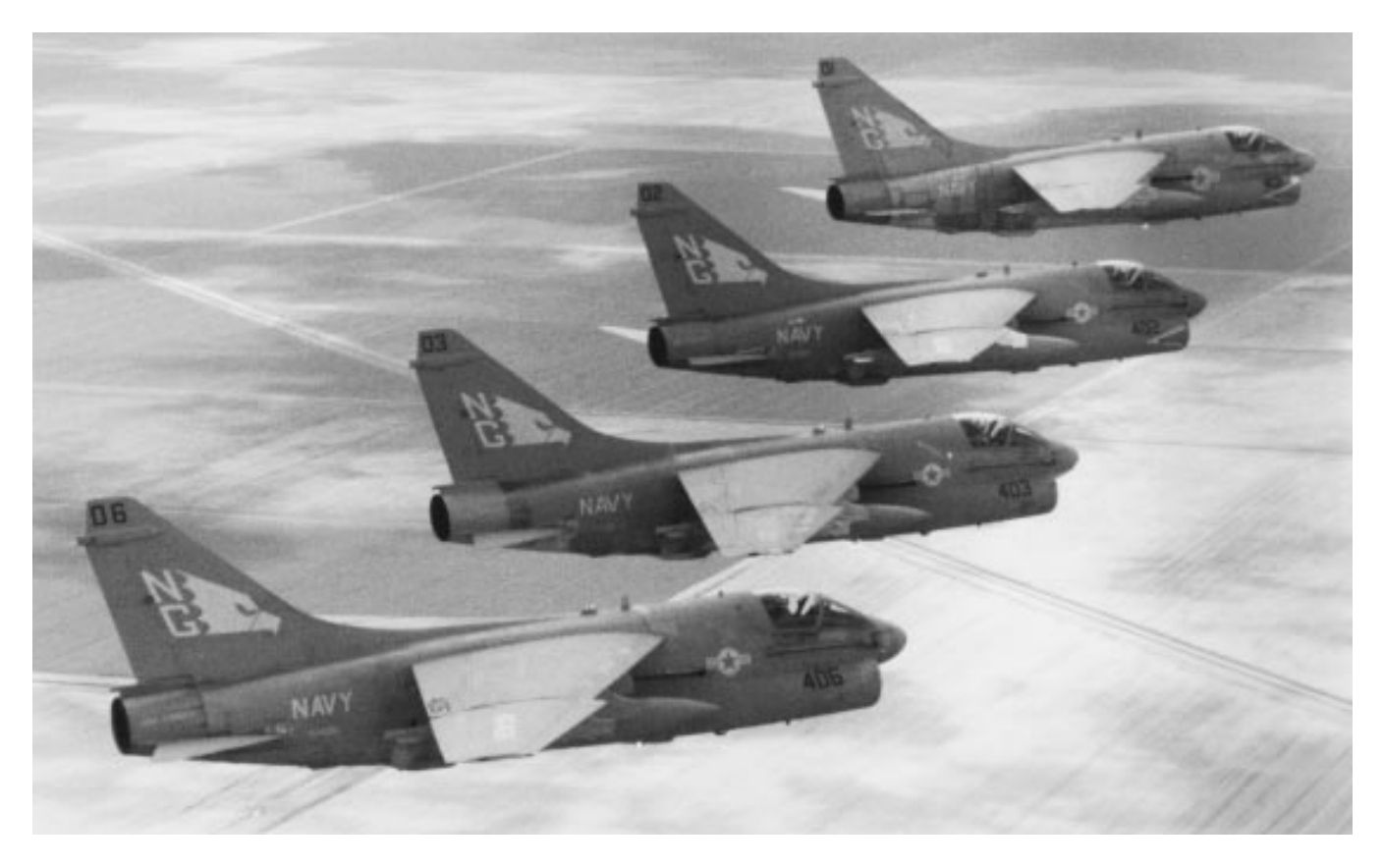
A formation of squadron A-7E Corsair IIs in low-visibility paint scheme, circa 1982–1983.