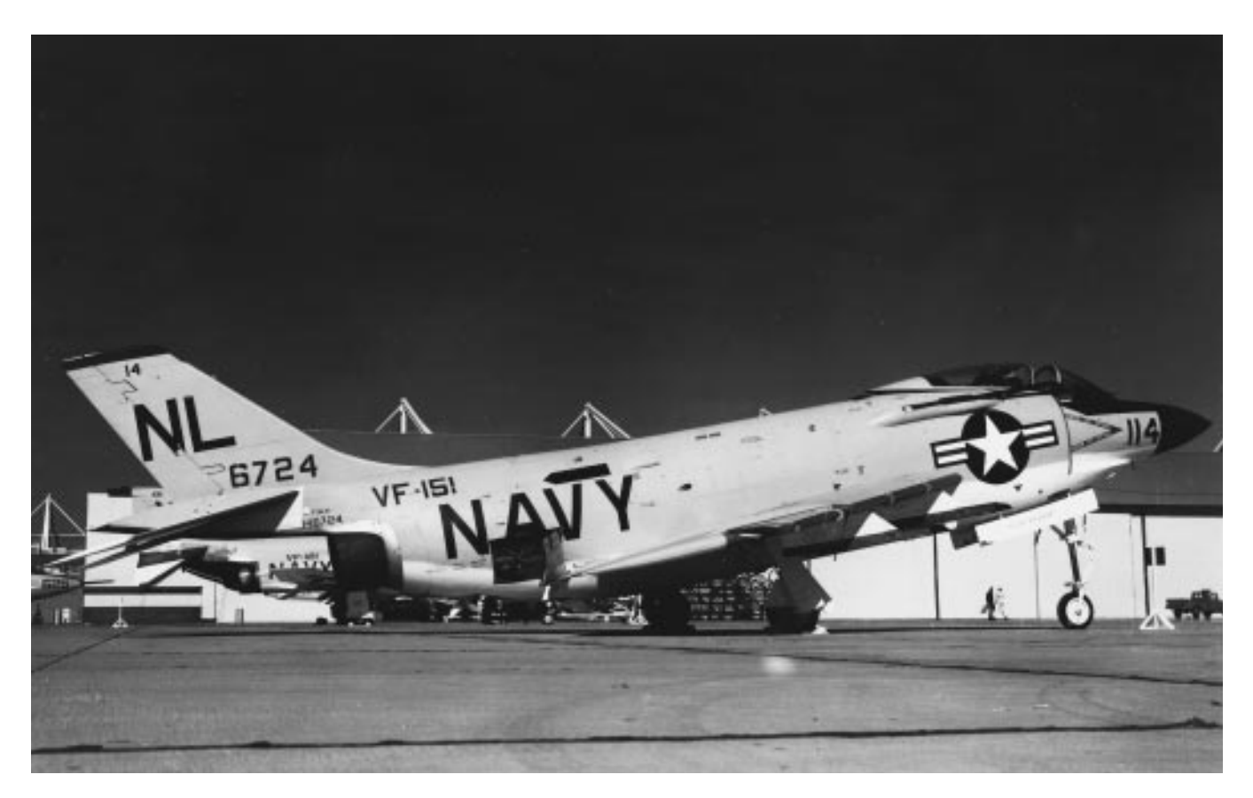
A squadron F3H-2 Demon at NAS Miramar, California.