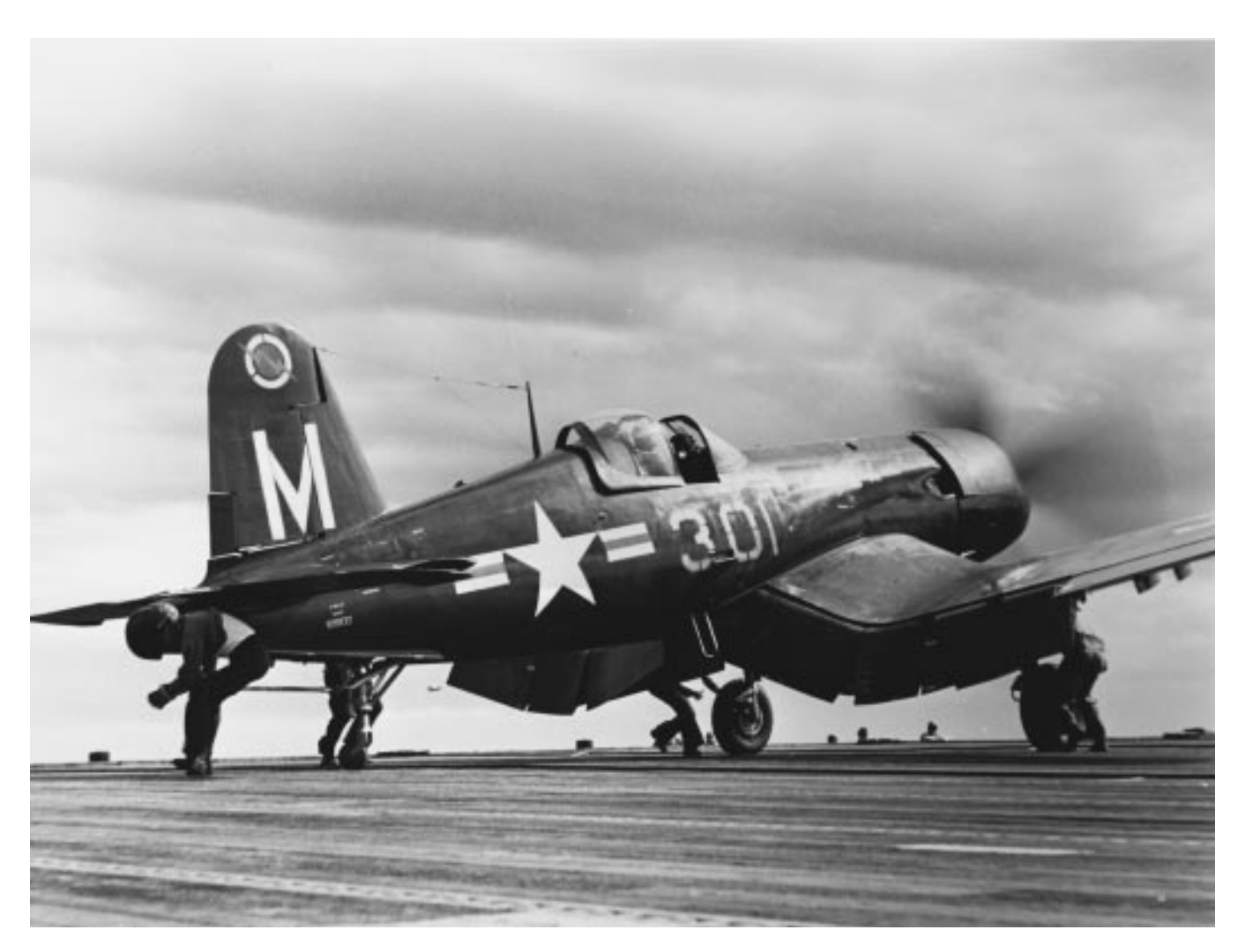
A squadron F4U-5 Corsair on the deck of Wright (CVL 49), November 1948 (Courtesy Robert Lawson Collection).

Nov 1990-Jan 1991: The squadron flew missions in support of Operation Desert Shield, the build up of American and Allied forces to counter a threatened invasion of Saudi Arabia by Iraq and as part of an economic blockade of Iraq to force its withdrawal from Kuwait.