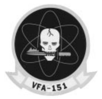
The squadron continued to use the skull and electron rings design following its redesignation to VFA.