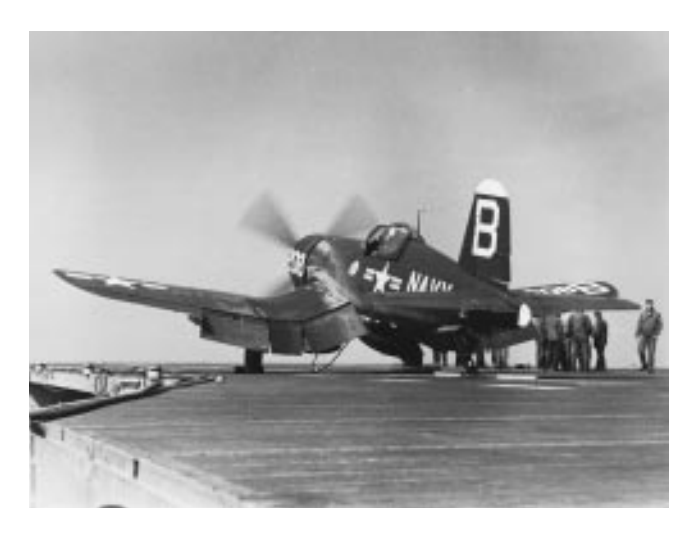
A squadron F4U-4 prepares to launch from Princeton (CV 37), circa 1950 or 1951.

27 Jan-24 Feb 1949: Half of the squadron's personnel and aircraft deployed aboard Boxer (CV 21) for a Pacific Fleet Minor Cold Weather Exercise near Kodiak, Alaska.