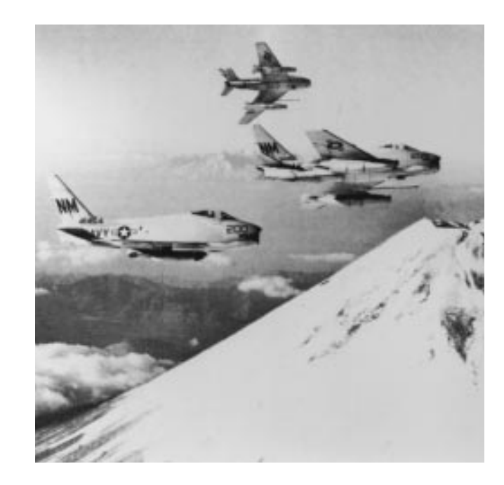
Squadron FJ-4B Furys fly over Mt. Fuji, Japan, during their deployment to WestPac aboard Bon Homme Richard (CVA 31), 1958–1959.

† The A4D-2N designation was changed to A-4C in 1962.