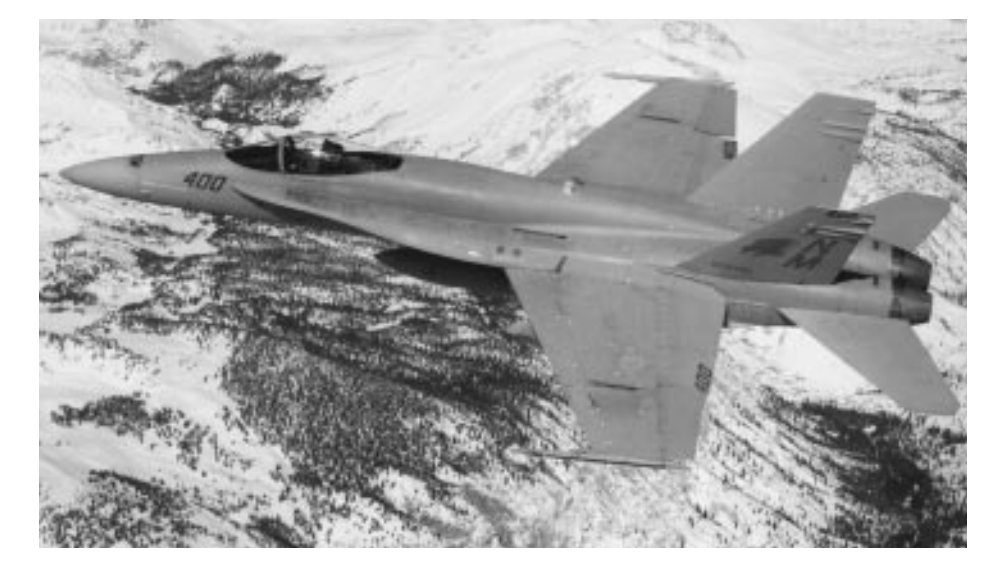
A squadron F/A-18A Hornet in flight, 1986. The aircraft has the tail code NM but the squadron was not assigned to CVW-19 when it received its Hornets.

<sup>†</sup> The tail code A was assigned to CVAG-19 on 12 December 1946 and changed to B on 4 August 1948. The tail code B was changed to NM in 1957. The effective date for this change was most likely the beginning of FY 58 (1 July 1957).