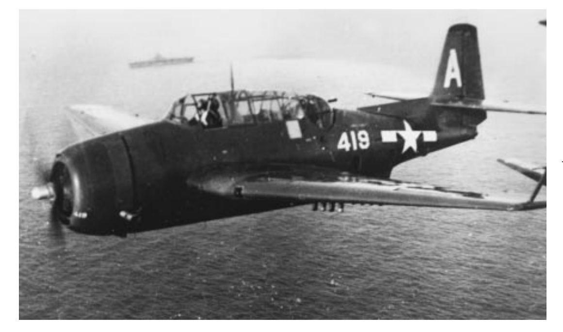
A squadron TBM-3E in flight, circa mid 1946 (Courtesy Robert Lawson Collection).

Nov 1990-Jan 1991: The squadron flew missions in support of Operation Desert Shield, the build up of American and Allied forces to counter a threatened invasion of Saudi Arabia by Iraq and as part of an economic blockade of Iraq to force its withdrawal from Kuwait.