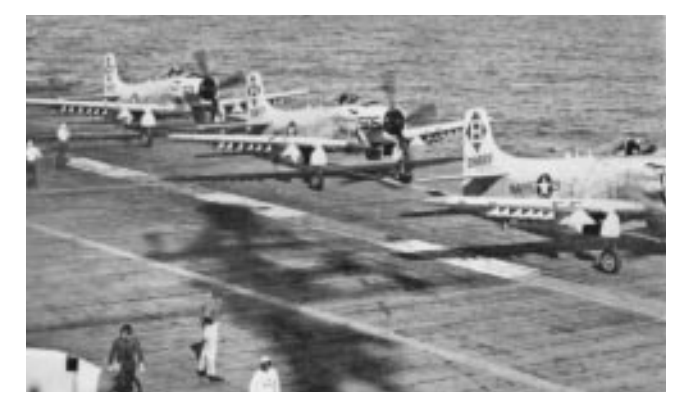
Three squadron AD-6 Skyraiders on the deck of Yorktown (CVA 10) preparing to launch, 1957.