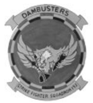
The squadron adopted the helmet and shield insignia sometime in the 1950s.