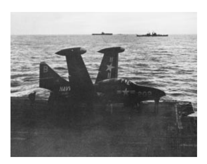
A squadron F9F-5 on the elevator of Oriskany (CVA 34) during a WestPac cruise in 1953–1954.

* VFA-192 was assigned to CVW-5 on 1 July 1986 as part of a program that has a permanently assigned carrier and air wing at an overseas home port. The home port for CVW-5 and Midway (CV 41) was NS Yokosuka, Japan. The squadron did not arrive in Japan until November 1986.