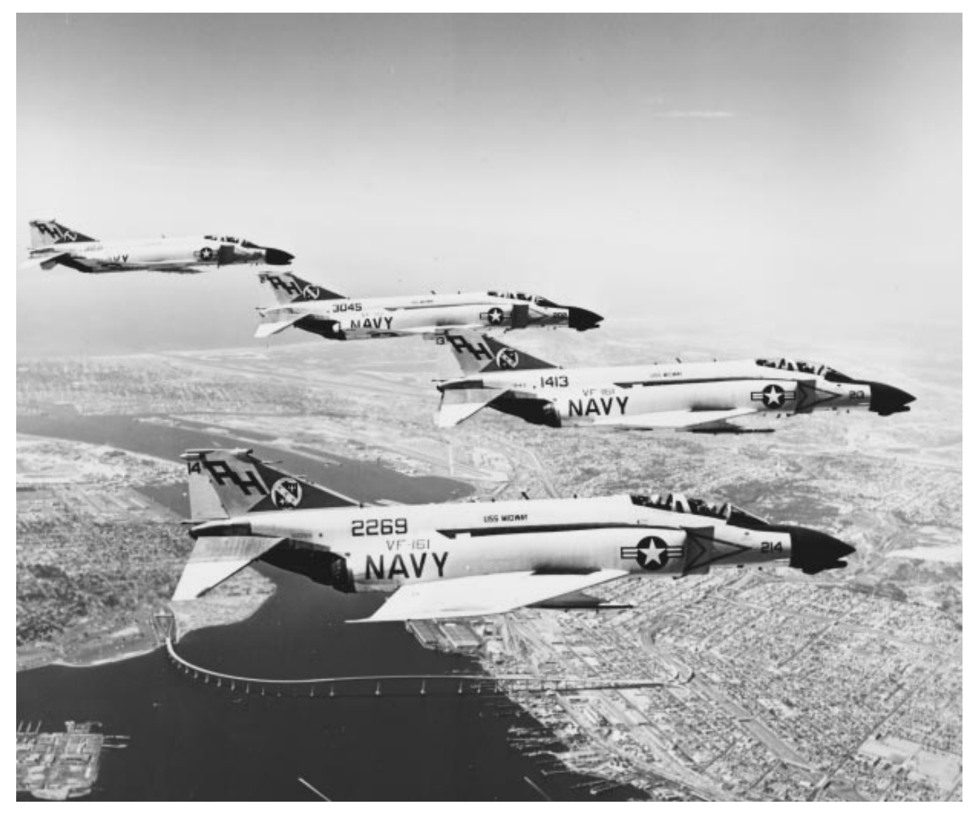
A formation of squadron F-4B Phantom IIs, 1971.

\ast The F3H-2 designation was changed to F-3B in 1962.