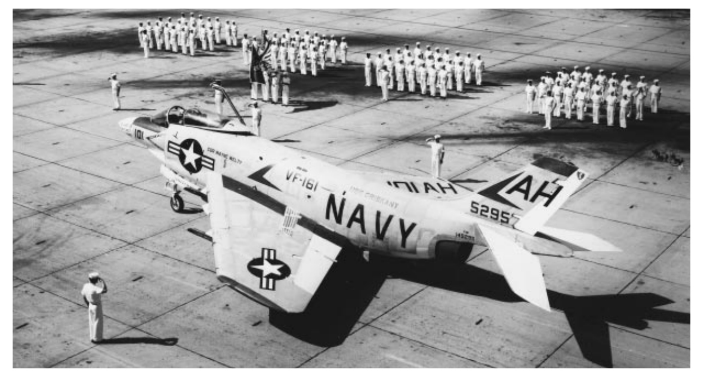
The squadron's last F3H-2 (F-3) Demon is piped over the side during a ceremony at NAS Miramar, California, September 1964.