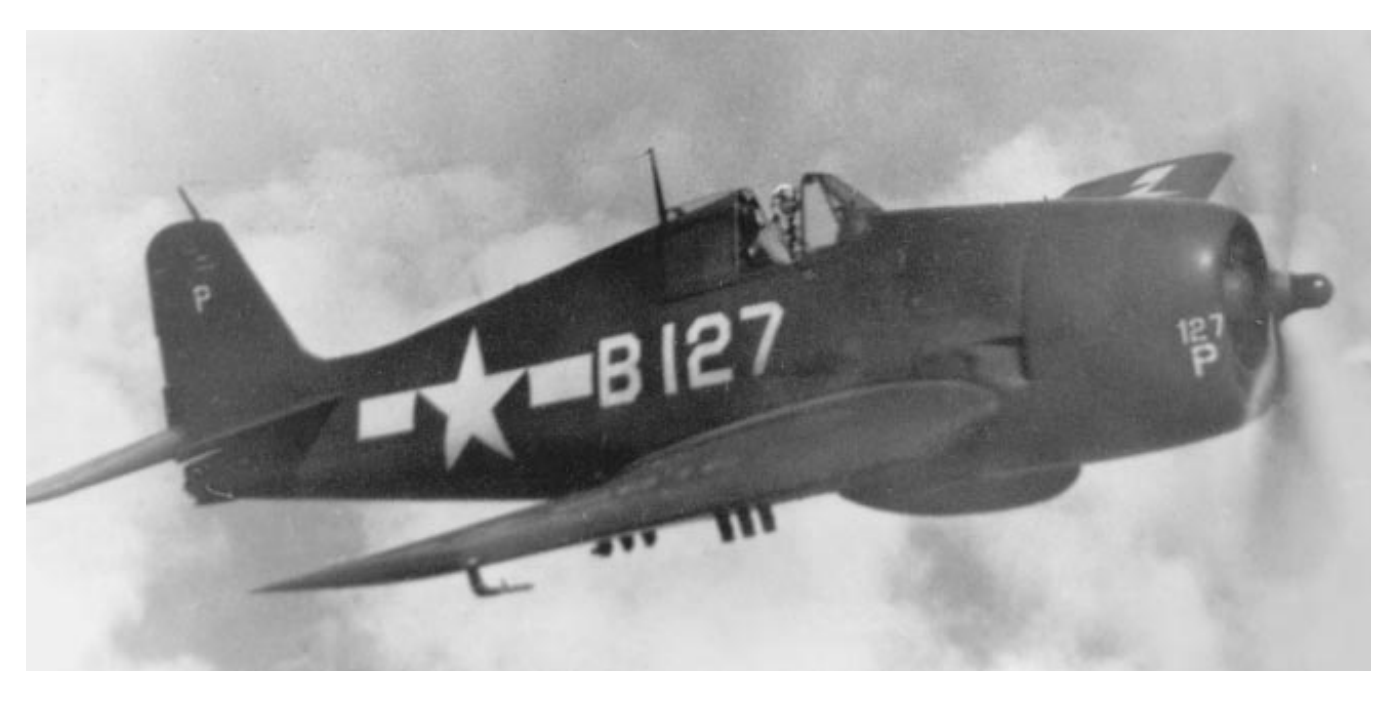
A squadron F6F-5P Hellcat in flight, 1946 (Courtesy Robert Lawson Collection).

Nov 1990-Jan 1991: The squadron flew missions in support of Operation Desert Shield, the build up of American and Allied forces to counter a threatened invasion of Saudi Arabia by Iraq and as part of an economic blockade of Iraq to force its withdrawal from Kuwait.