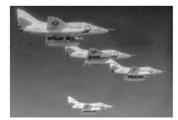
A formation of squadron A-4C Skyhawks during their combat deployment to Vietnam aboard Bon Homme Richard (CVA-31), 1965.