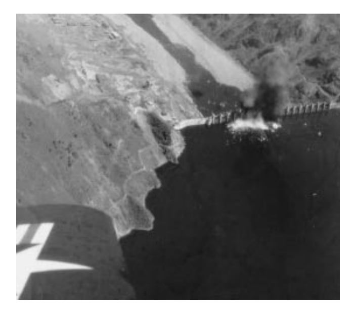
The Hwachon Reservoir Dam under attack by squadron AD-4 Skyraiders, 1 May 1951.

Aug-Oct 1964: The squadron participated in special operations, flying escort and reconnaissance sorties in support of U.S. operations in Vietnam and Laos.