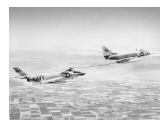
A squadron F3H-2 (F-3) Demon is refueled by an A-4 Skybawk.

Oct 1986-Jun 1987: Following the transfer of the squadron from CVW-5, and awaiting transfer to a newly established air wing, the squadron was in an inactive status at NAS Lemoore.