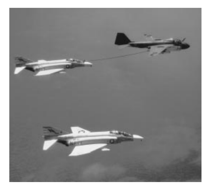
A squadron F-4B Phantom II is refueled by an A-6 Intruder while another squadron aircraft flies escort, June 1966.

* VF-151, along with CVW-5 and Midway (CVA 41), were part of a program to permanently assign a carrier and air wing to an overseas home port. Midway 's new home port was Naval Station Yokosuka, Japan. The squadron would normally operate out of NAF Atsugi or Misawa when the carrier was in port NS Yokosuka. The assignment was effective 30 June 1973. However, the squadron did not arrive until 5 October 1973.