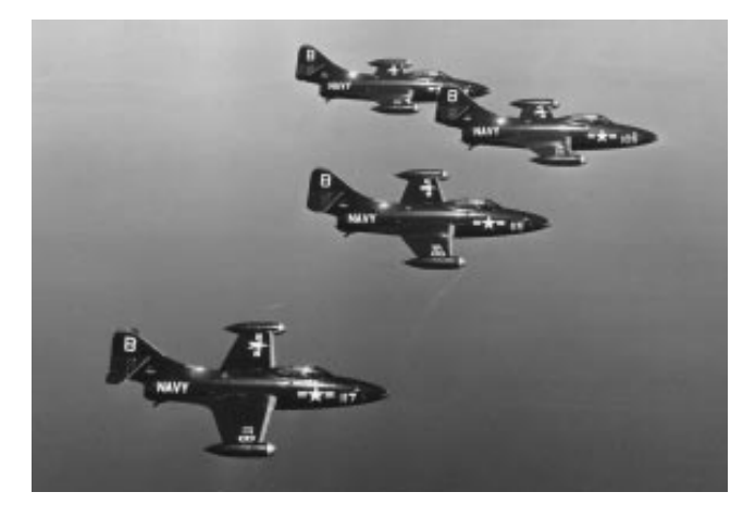
A formation of squadron F9F-2 Panthers in flight during their combat deployment to Korea aboard Princeton (CV 37) between May to August 1951.