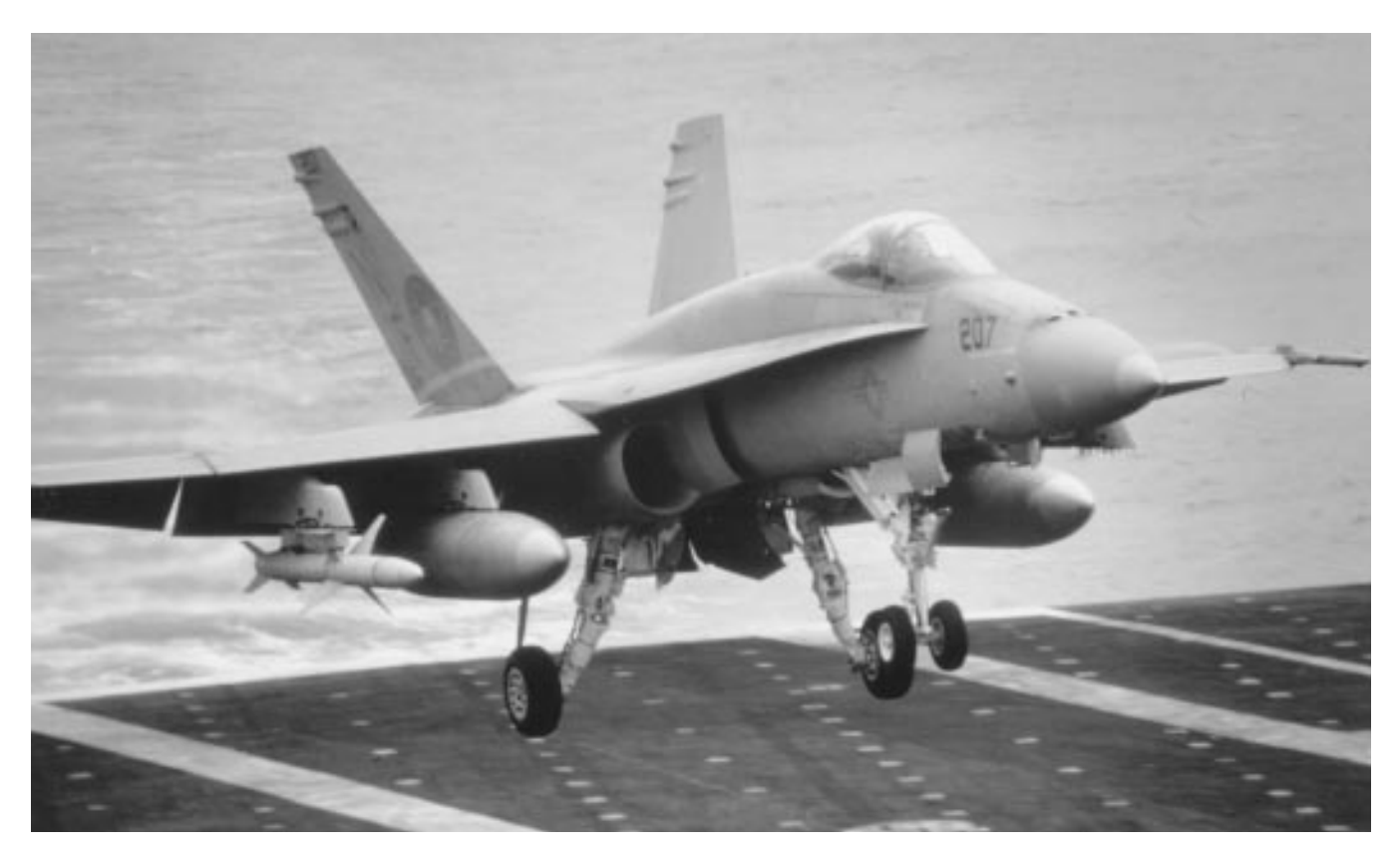
A squadron F/A-18A Hornet lands aboard Midway (CV 41), 1987.