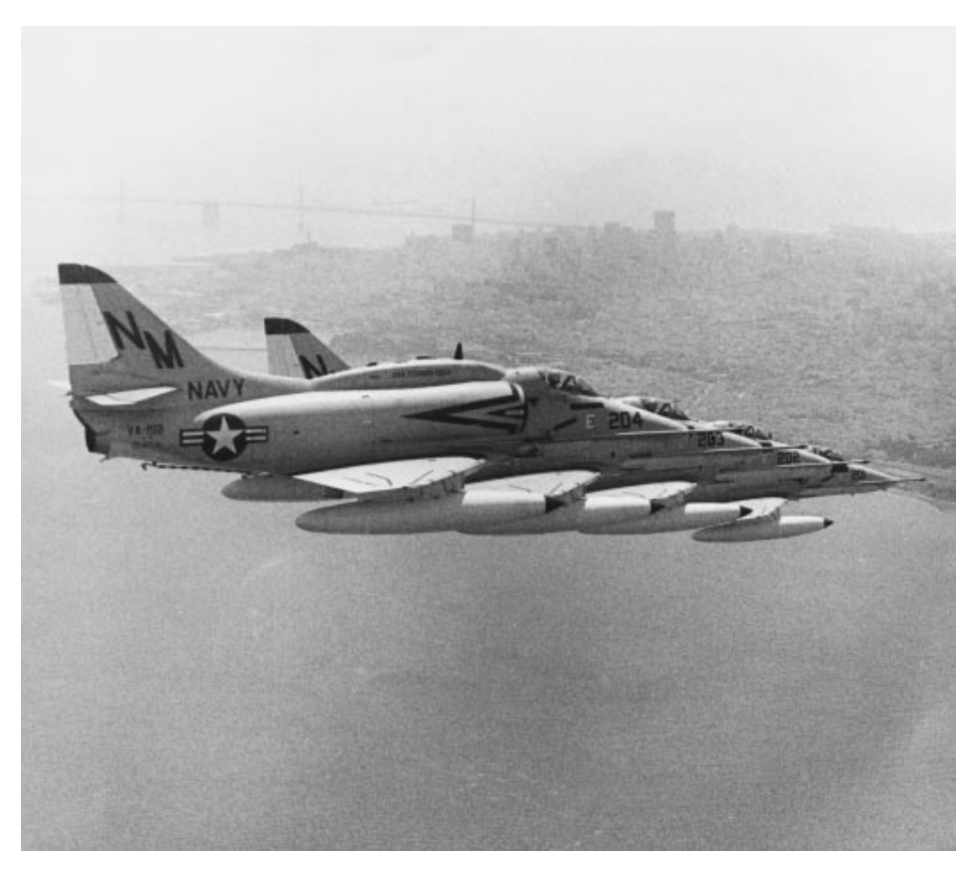
A formation of squadron A-4F Skybawks fly over San Francisco, California, 1968.

‡ The squadron was permanently forward deployed and home ported in Japan. Consequently, all future deployments for the squadron while embarked on Midway (CV 41) will cover only those operations outside the home waters of Japan.