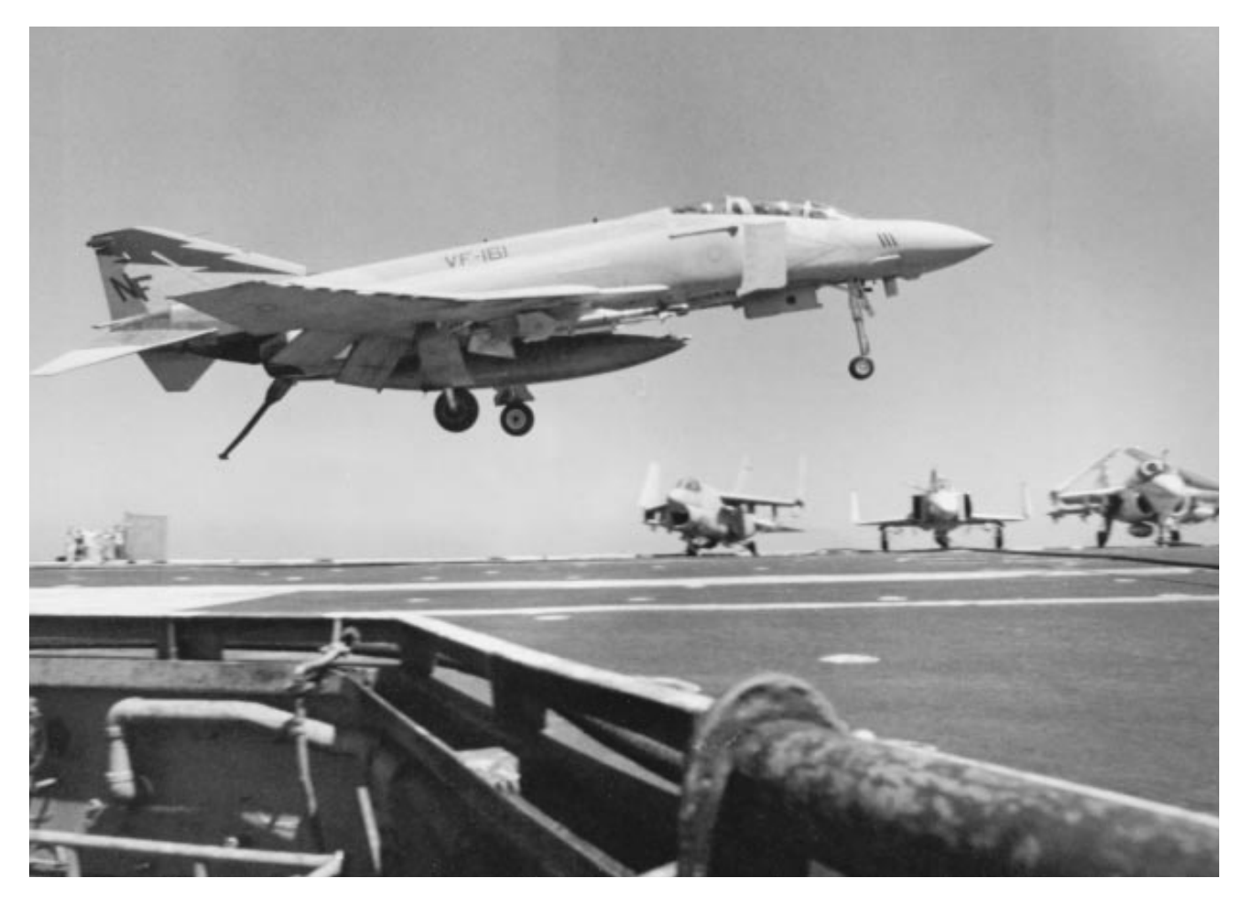
A squadron F-4S Phantom II, in a low-visibility paint scheme, comes in for a landing on Midway (CV 41), 1985.