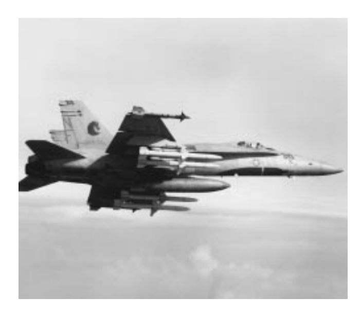
A squadron F/A-18A Hornet in flight, loaded with weapons, 1990.