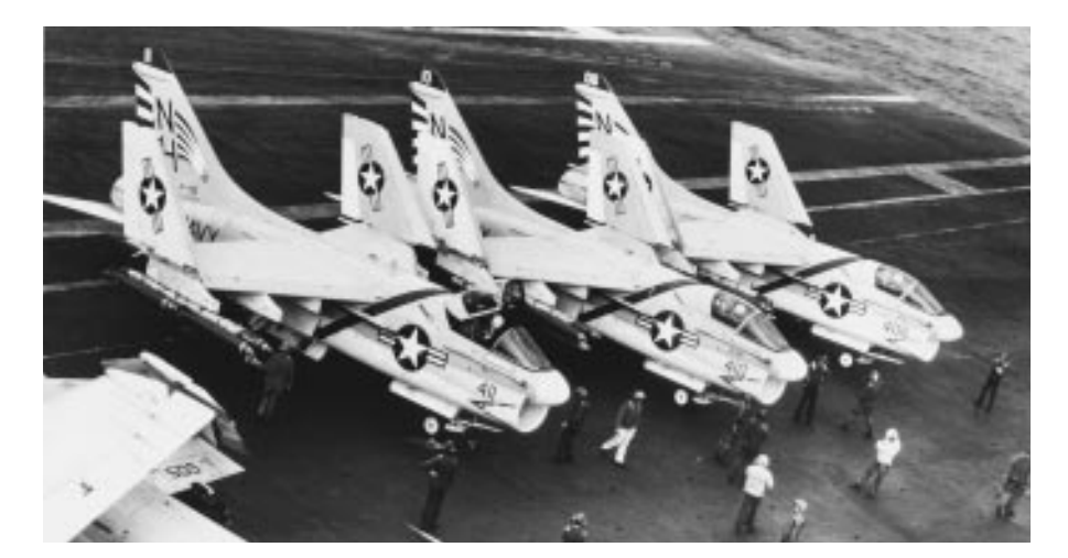
Three squadron A-7E Corsair IIs on the deck of Kitty Hawk (CVA 63) prepare to launch on a combat mission against Viet Cong positions, 1971.

† The A4D-2N designation was changed to A-4C in 1962.