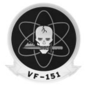
The squadron's second insignia, the skull and electron rings design, was approved by CNO in May 1955.