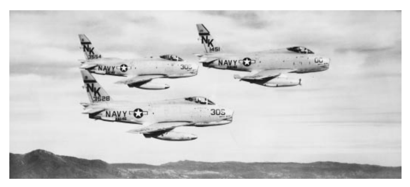
A formation of squadron FJ-4B Furys, 1961.