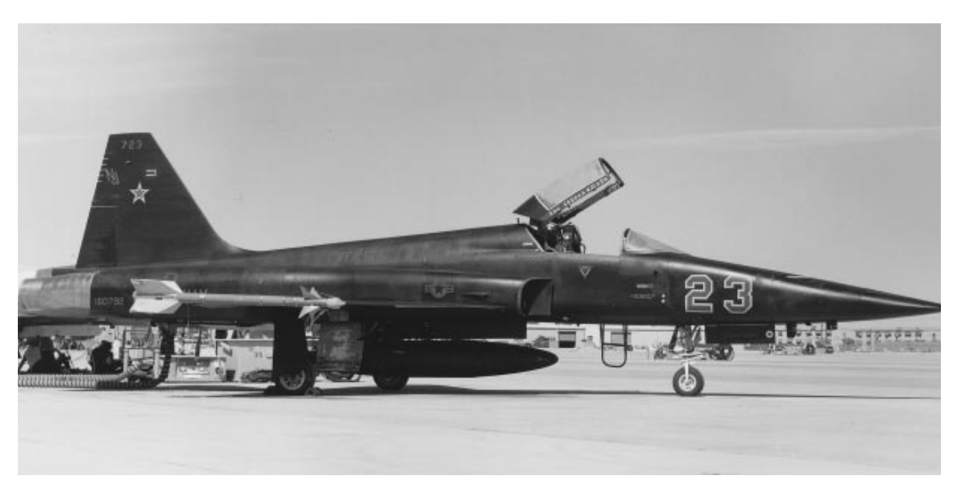
A squadron F-5E Tiger II at NAS Fallon, Nevada, July 1989.