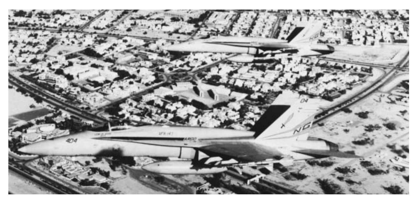
A formation of squadron F/A-18C Hornets fly over Kuwait City during Operation Southern Watch, 1993.