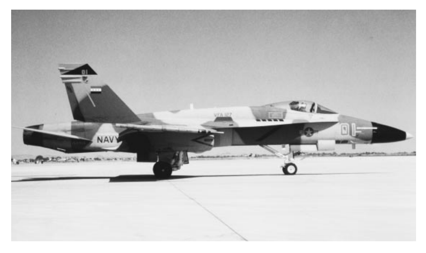
A squadron F/A-18A Hornet at NAS Fallon, Nevada, 1992.

‡ COMFAIRLEMOORE was redesignated COMLATWINGPAC on 30 June 1973 and in 1991 redesignated COMSTRKFIGHTWINGPAC.