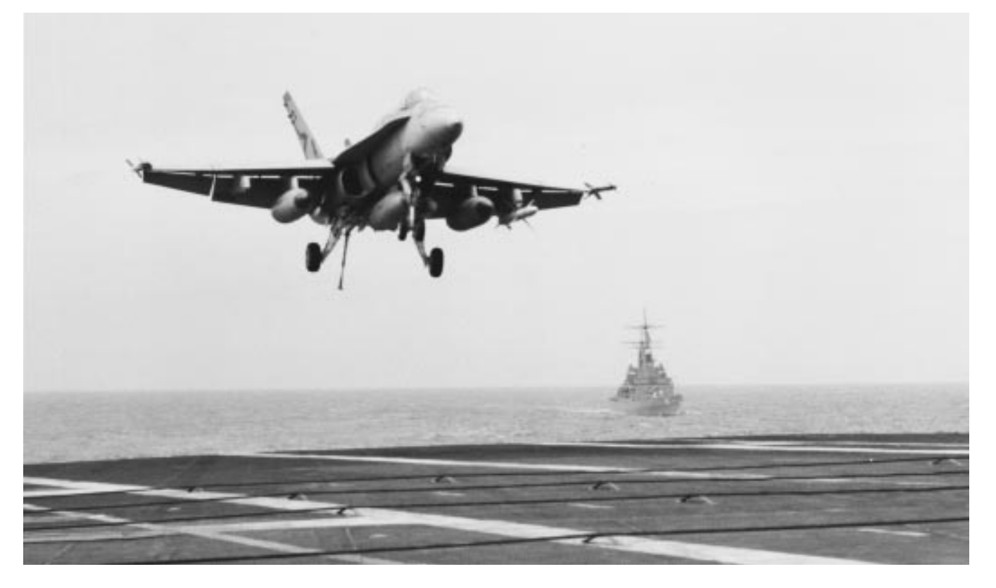
A squadron F/A-18A Hornet about to trap on Coral Sea (CV 43), 1989.