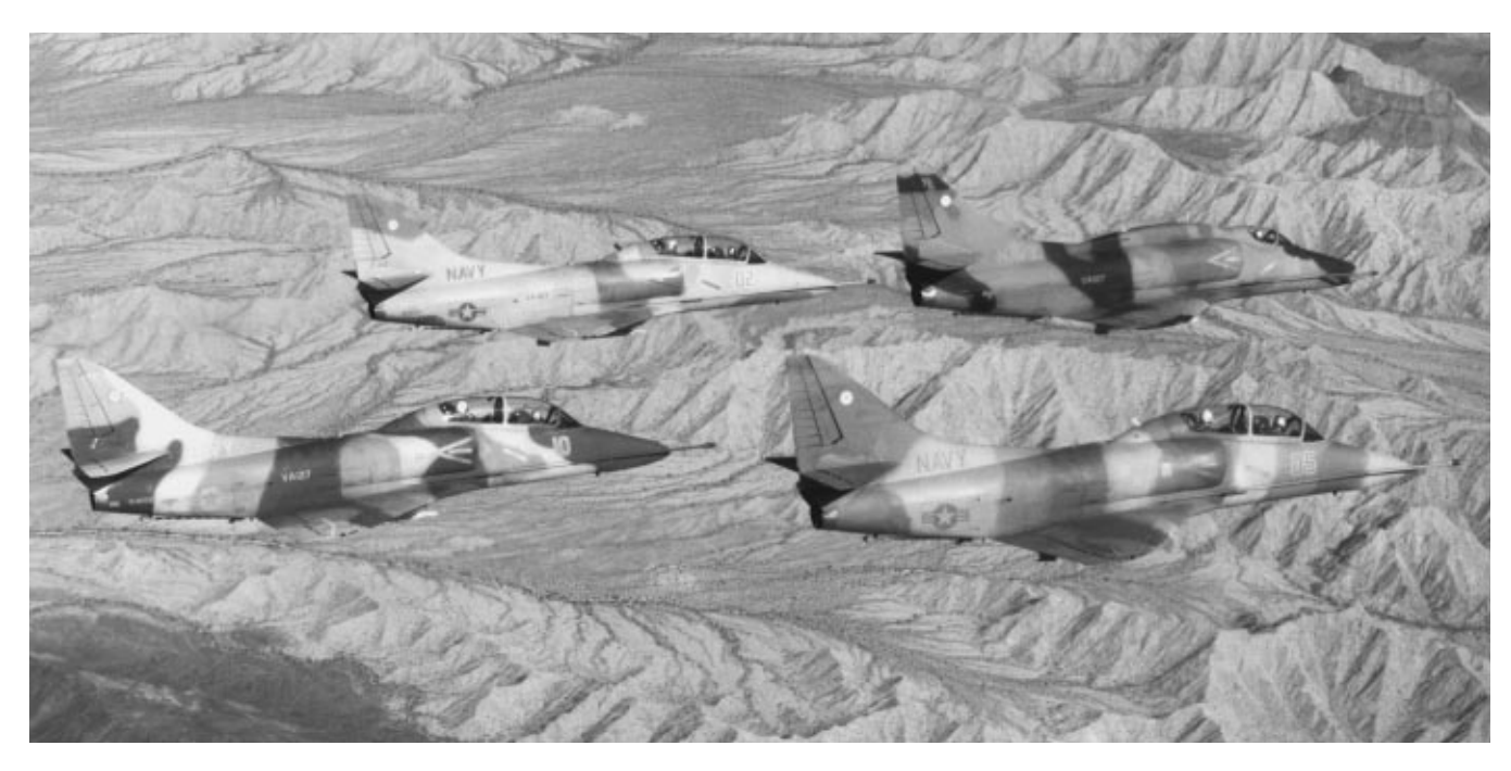
Three squadron TA-4J Skybawks fly in formation with one of the squadron's A-4F Skybawks, 1983.

* The F9F-8T designation was changed to TF-9J in 1962.