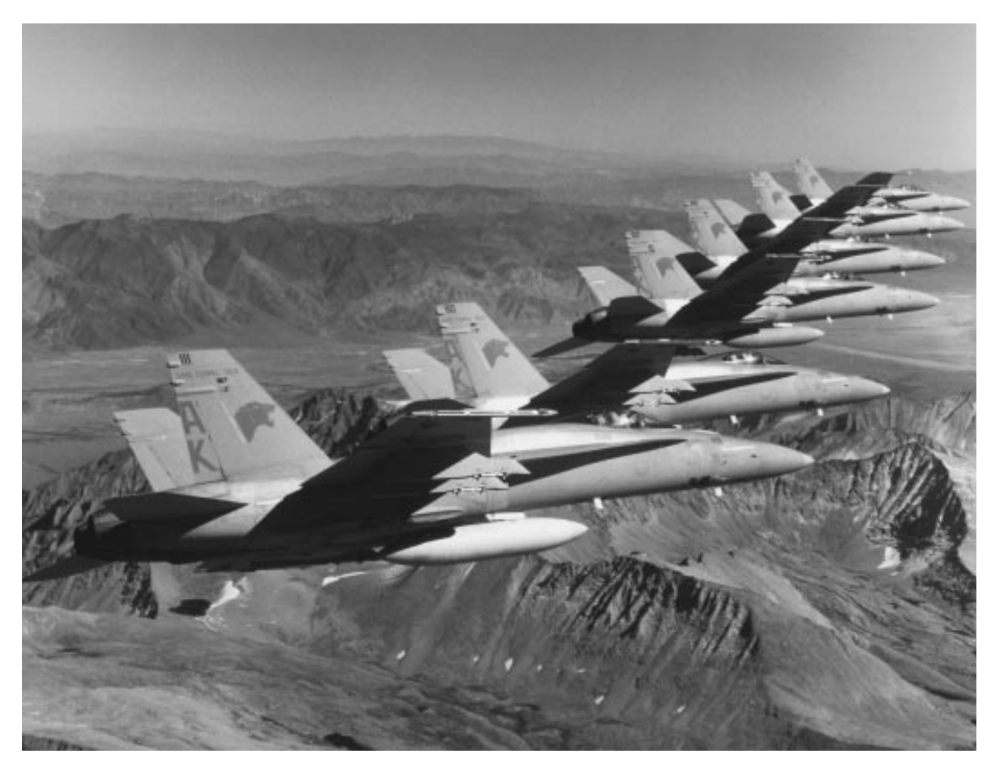
A formation of squadron F/A-18A Hornets, 1986.