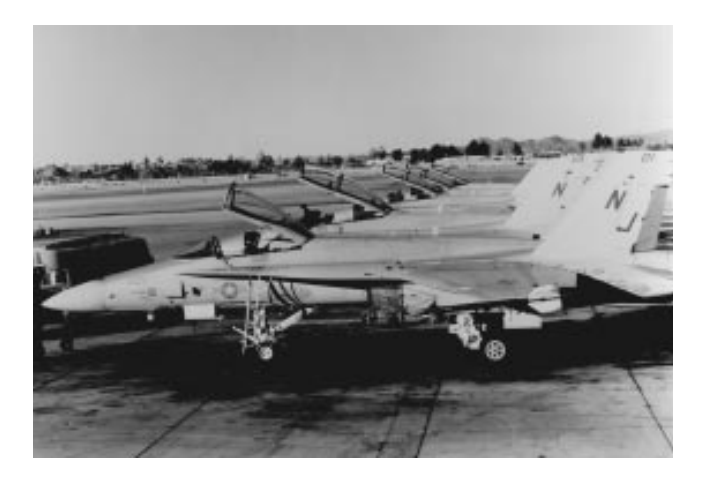
Squadron F/A-18 Hornets on the flight line at NAS Lemoore, California.

Mar 1983 : Training began for the first Navy squadron to transition to the F/A-18.