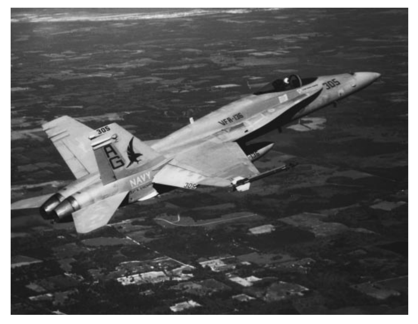
A squadron F/A-18A Hornet in flight armed with a Sidewinder missile on its wing tip, February 1989.