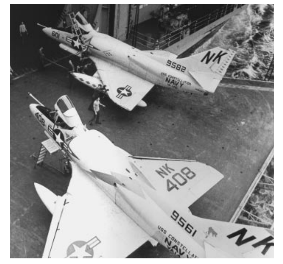
A squadron A-4C Skybawk and a VA-144 Skybawk on Constellation's (CVA 64) elevator during ber combat deployment to Vietnam in 1964–1965.

* The A4D-2N designation was changed to A-4C in 1962.