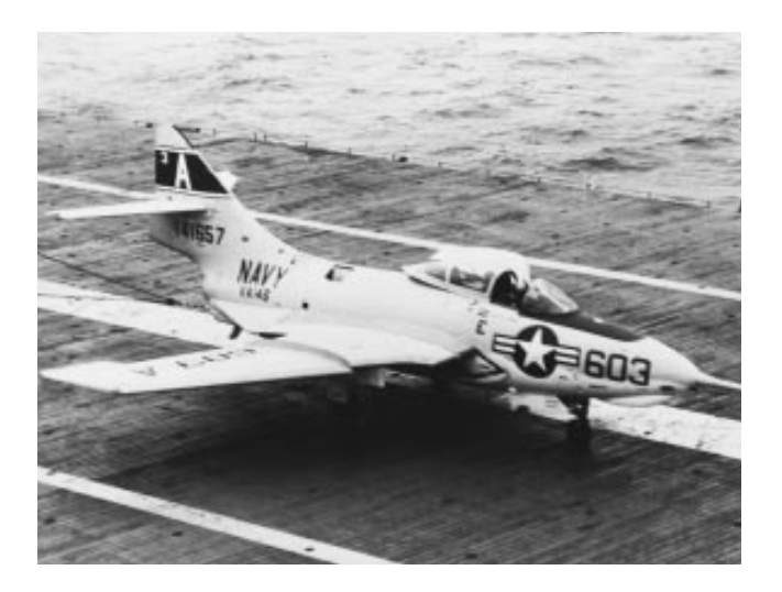
A squadron F9F-8 Cougar trapping aboard Hornet (CVA 12), March 1957 (Courtesy Robert Lawson Collection).

5 Aug 1964: VA-146 aircraft participated in Operation Pierce Arrow. This operation involved retaliatory air strikes against North Vietnamese torpedo boats and their bases and supporting facilities because of the attacks against the Maddox (DD 731) and Turner Joy (DD 951) on 4 August by North Vietnamese motor torpedo boats. VA-146's A-4Cs flew 8 sorties against two installations. They experienced heavy antiaircraft ground fire but none of their aircraft were damaged. The sorties by VA-146 and the other