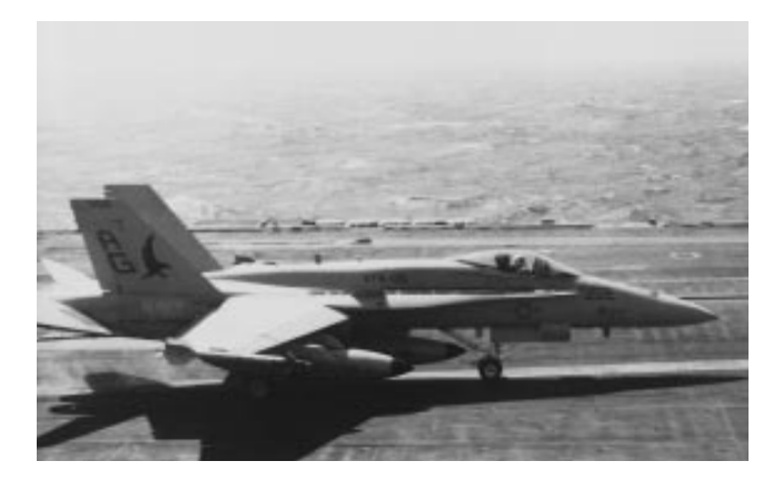
A squadron F/A-18A Hornet about to be launched from Eisenbower (CVN 69).