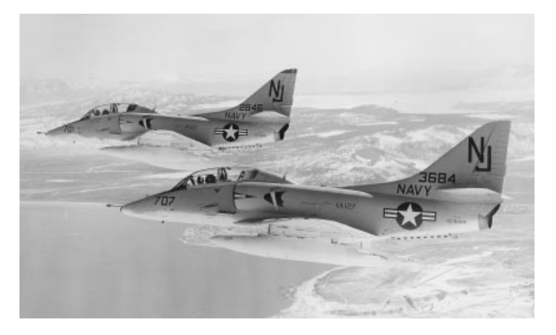
Two squadron TA-4F Skyhawks in flight, 1967.