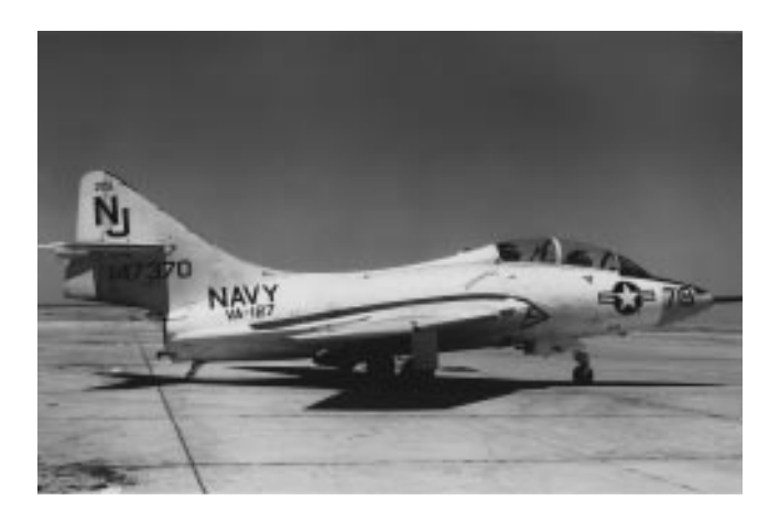
A squadron F9F-8T (TF-9J) Cougar at NAS Lemoore, California, July 1963 (Courtesy Robert Lawson Collection).

1 Oct 1983: The squadron's instrument training mission was dropped and the primary mission became the Adversary Role (Dissimilar Air Combat Maneuvering).