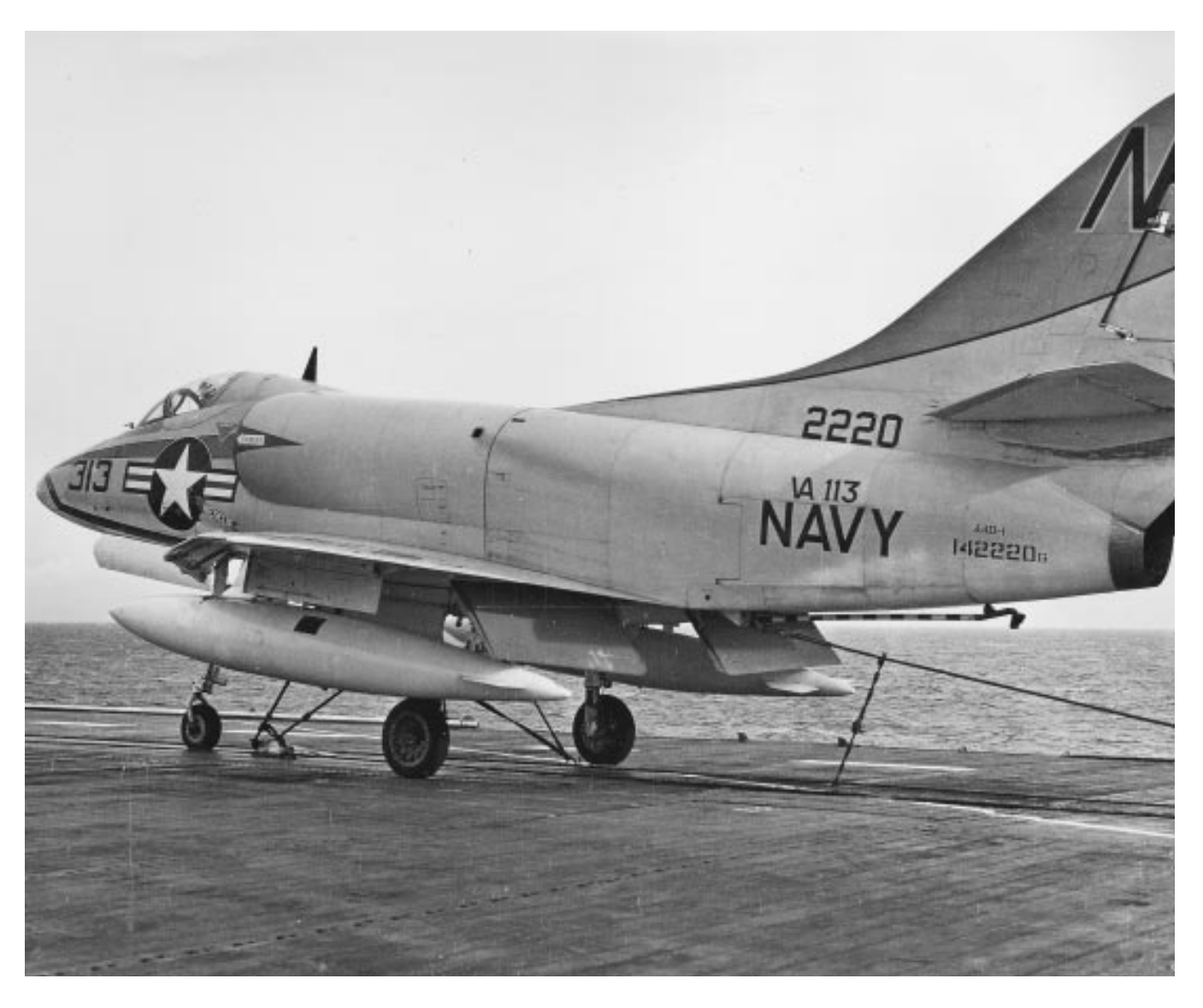
A squadron A4D-1 (A-4) Skybawk on Hancock's (CVA 19) flight deck, November 1957.

* The A4D-2N designation was changed to A-4C in 1962.