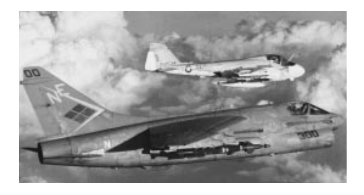
A squadron A-7E Corsair II in flight alongside an A-6 Intruder, 1984.