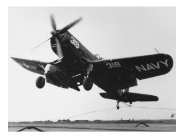
A squadron F4U-4 Corsair catching the wire aboard Philippine Sea (CV 47) during their 1951–1952 combat deployment to Korea.

Nov 1964-Oct 1965: The squadron provided a detachment of personnel and aircraft for use as fighter