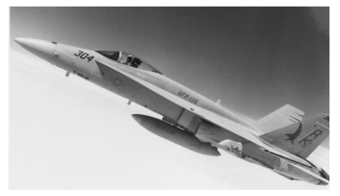
A squadron F/A-18A Hornet in flight, circa 1986 or 1987.