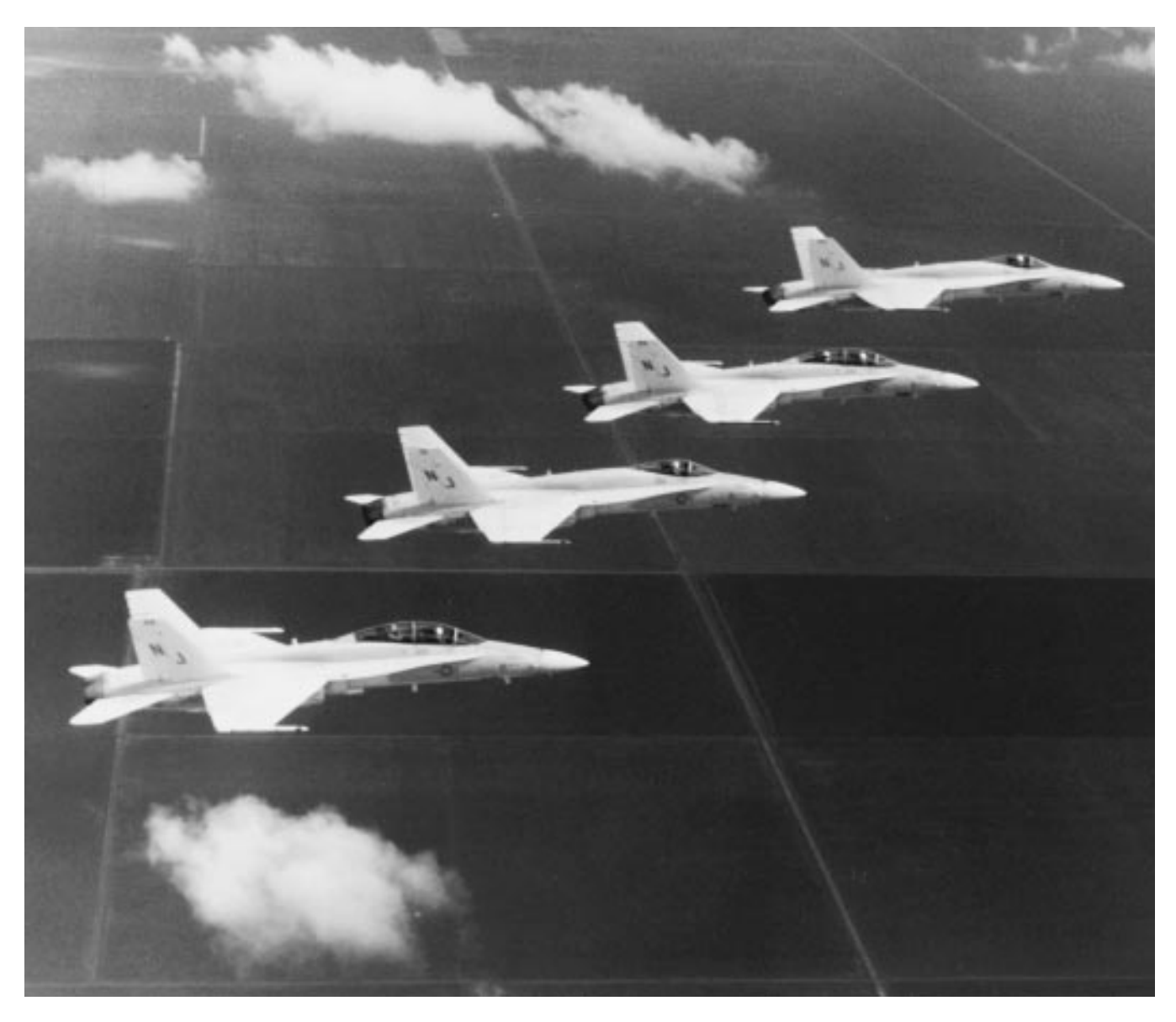
A formation of squadron F/A-18 Hornets, including the two-seat versions (Courtesy Duane Kasulka Collection).

Inclusive Dates Covering Unit Award13 Nov 198028 Mar 1983