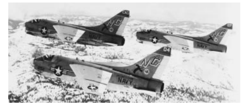
A formation of squadron A-7E Corsair IIs, circa 1975.

Sep 1988: Nimitz (CVN 68), with VA-147 embarked, operated in the Sea of Japan in support of the Summer Olympic Games in Seoul, Republic of Korea.