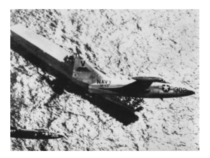
Squadron F9F-5 Panthers over Kearsarge (CVA 33) during their 1953–1954 deployment to Korea and WestPac.

3-4 Oct 1990 : VFA-113 conducted flight operations from Independence while she operated in the Persian Gulf. This was the first time a carrier had operated in the Persian Gulf since 1974.