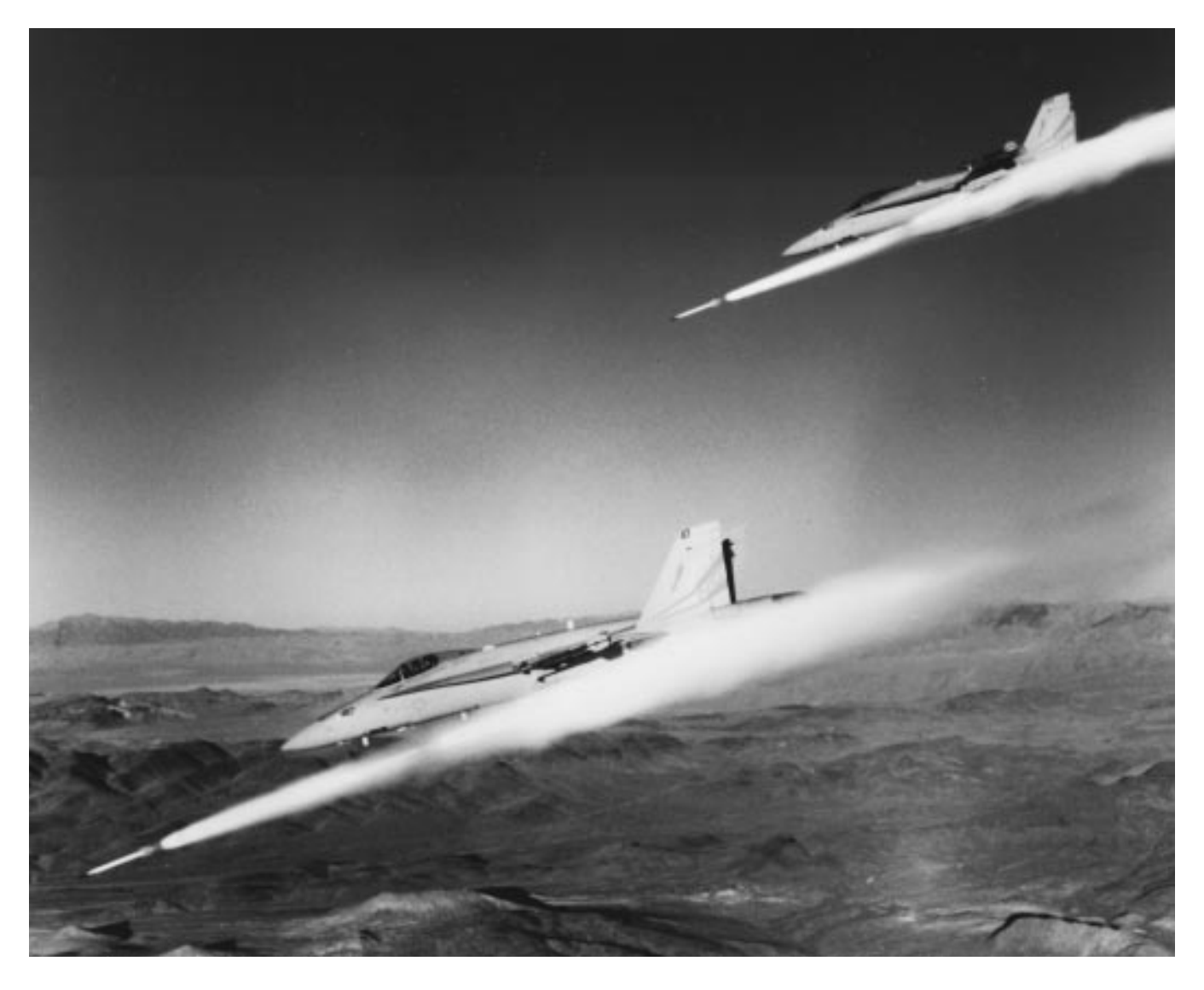
Two squadron F/A-18C Hornets firing air-to-ground rockets, 1990.