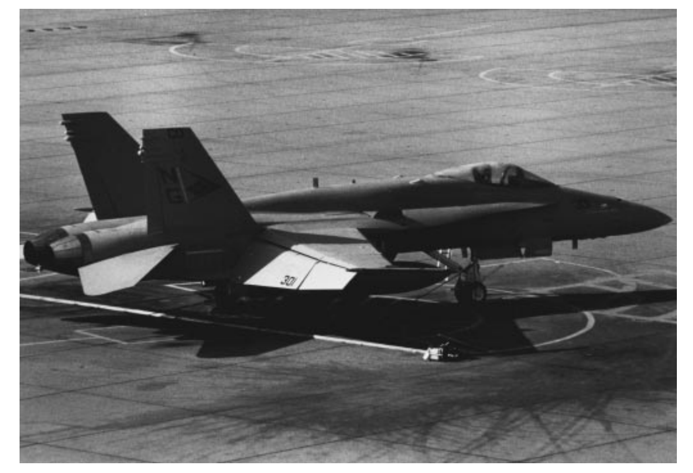
A squadron F/A-18C Hornet on the flight line at NAS Lemoore, California, December 1989.