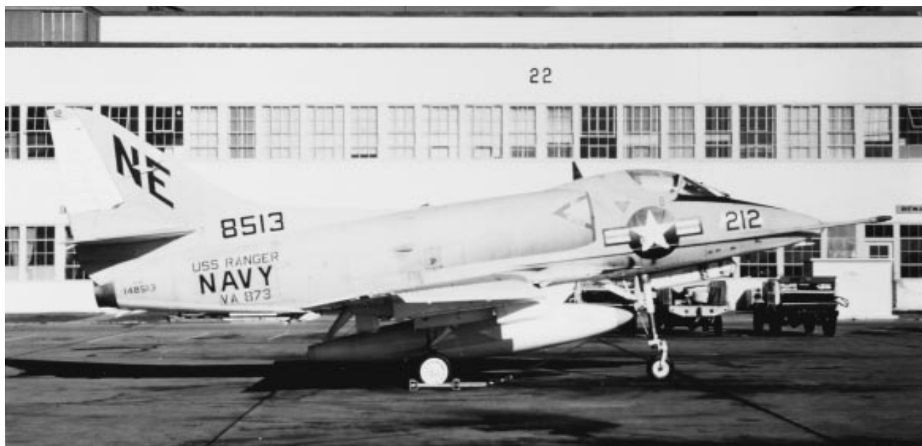
A squadron A-4 Skyhawk, circa 1968.