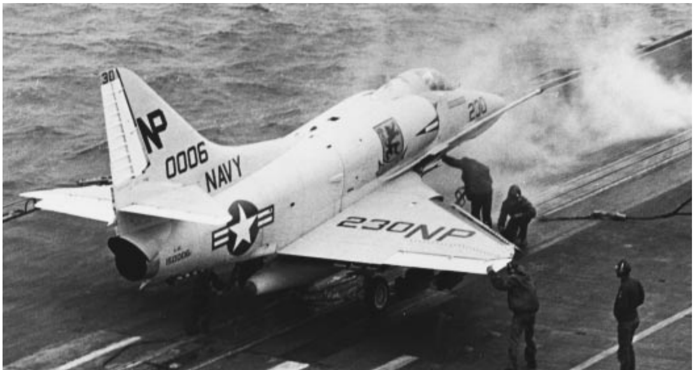
A squadron A-4E Skyhawk preparing to launch on a combat mission from Bon Homme Richard (CVA 31) during her deployment to Vietnam in 1967.