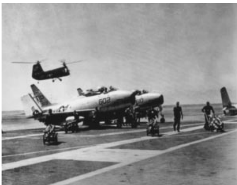
Two squadron FJ-4B Fury aircraft on Hancock's (CVA 19) flight deck during her deployment to WestPac in 1962.