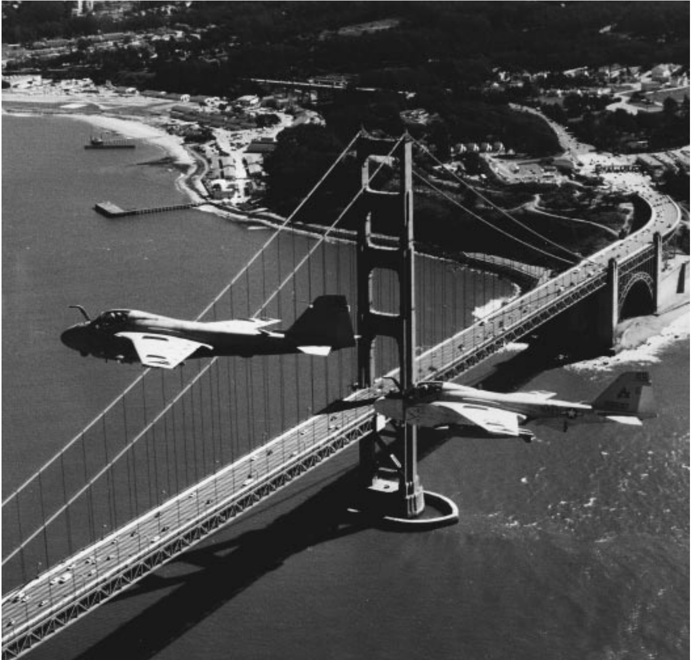
Two squadron A-6 Intruders over the Golden Gate Bridge.