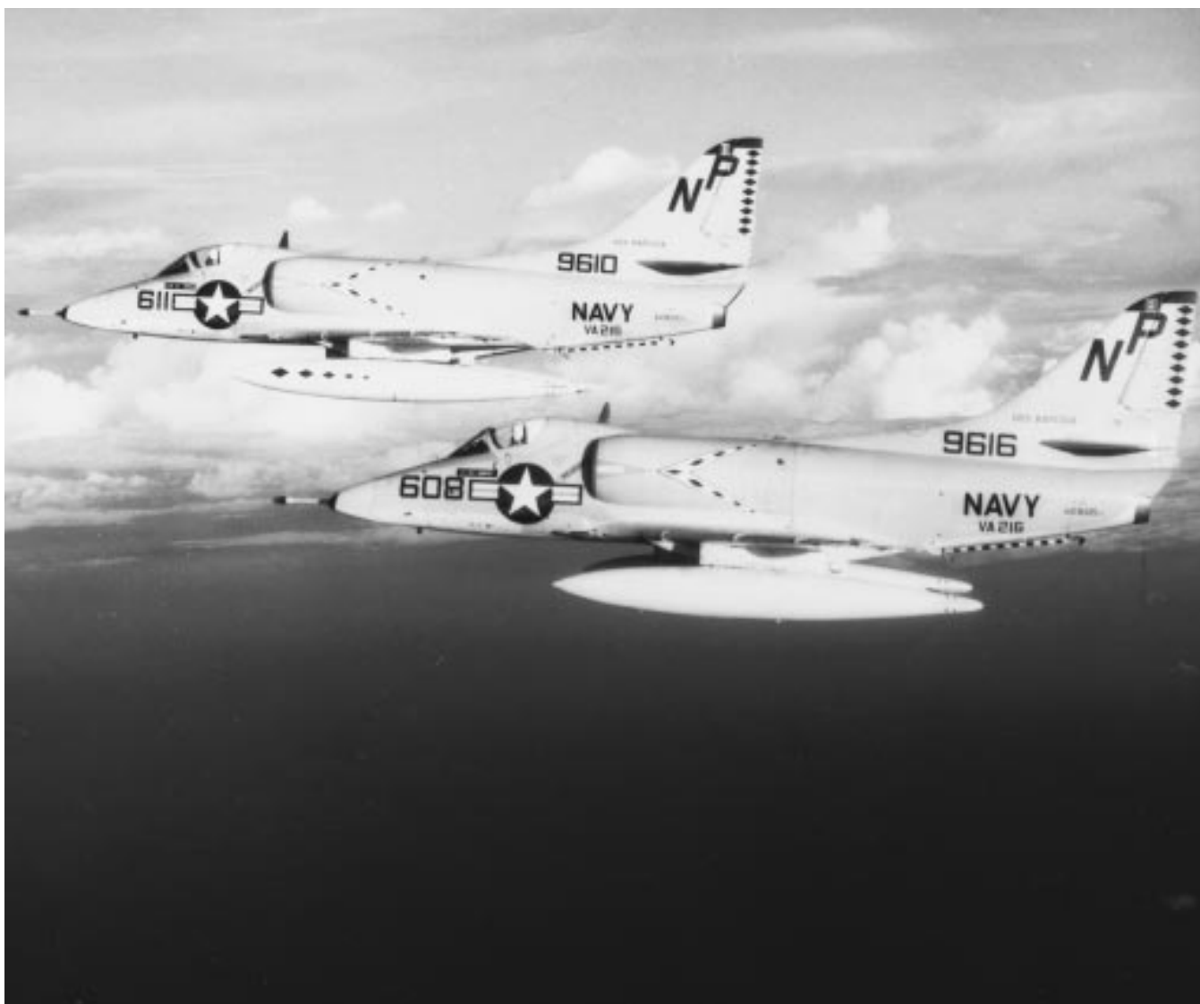
Two squadron A-4C Skyhawks in flight, circa 1964–1965.