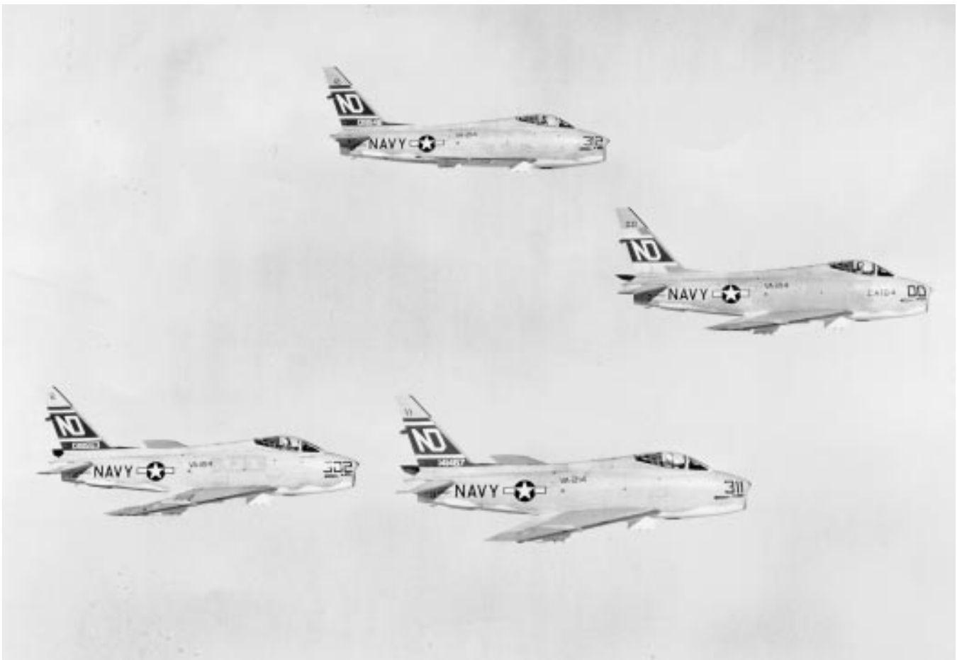
A flight of squadron FJ-4Bs, circa 1957 or 1958.

† The tail code was changed from Z to ND in 1957. The effective date for this change was most likely the beginning of FY 58 (1 July 1957).