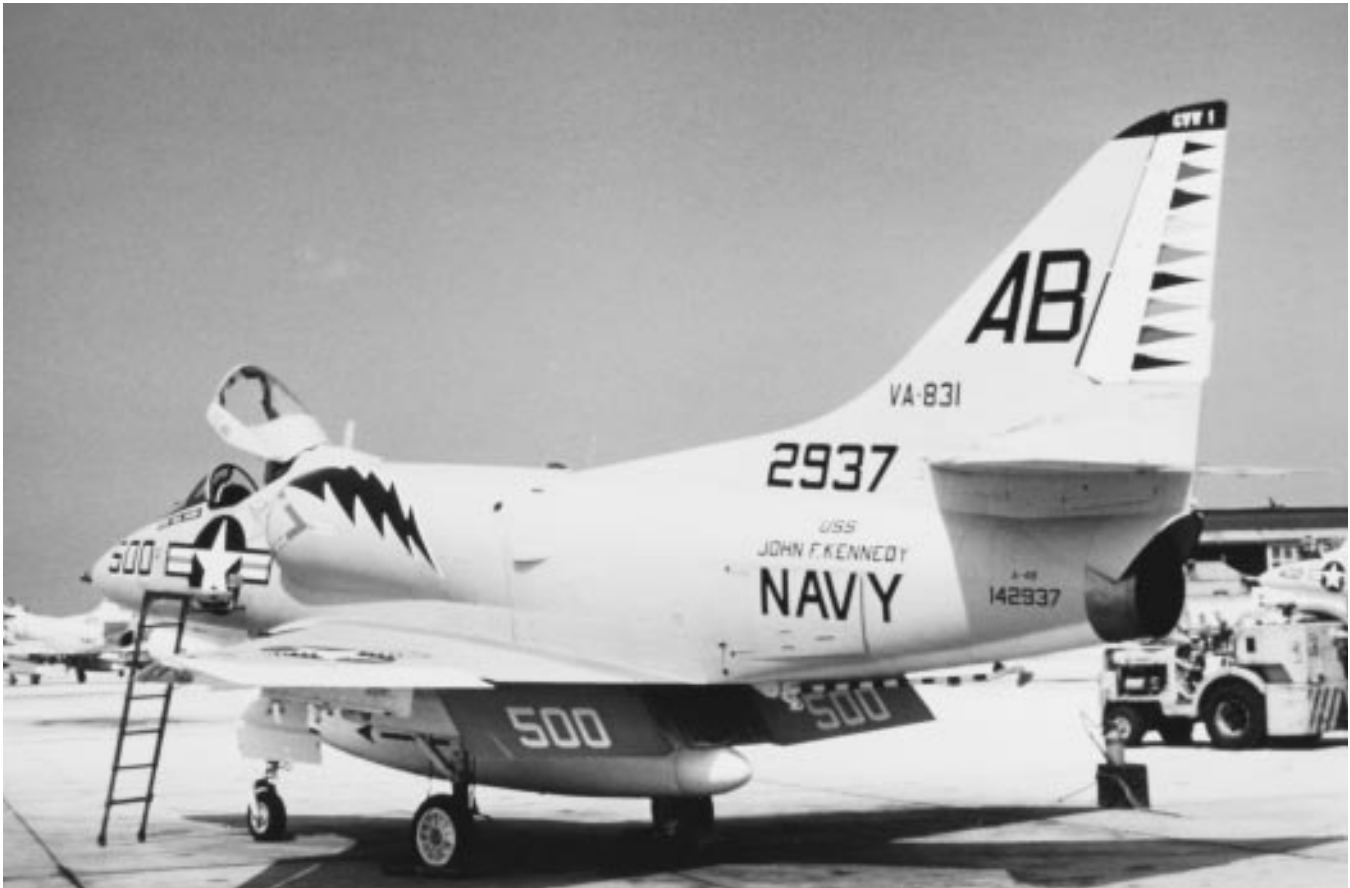
A squadron A-4 Skyhawk, circa 1968 (Courtesy Duane Kasulka Collection).

* This tail code was also assigned two other activated reserve squadrons, VF-661 and VF-931.