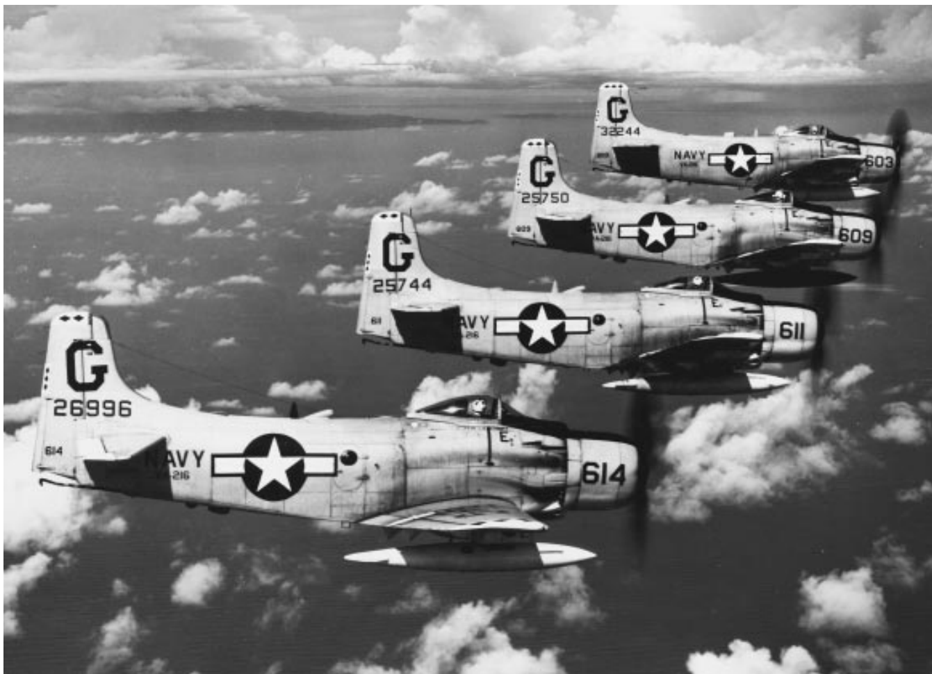
A formation of squadron AD-4NA Skyraiders, July 1956.