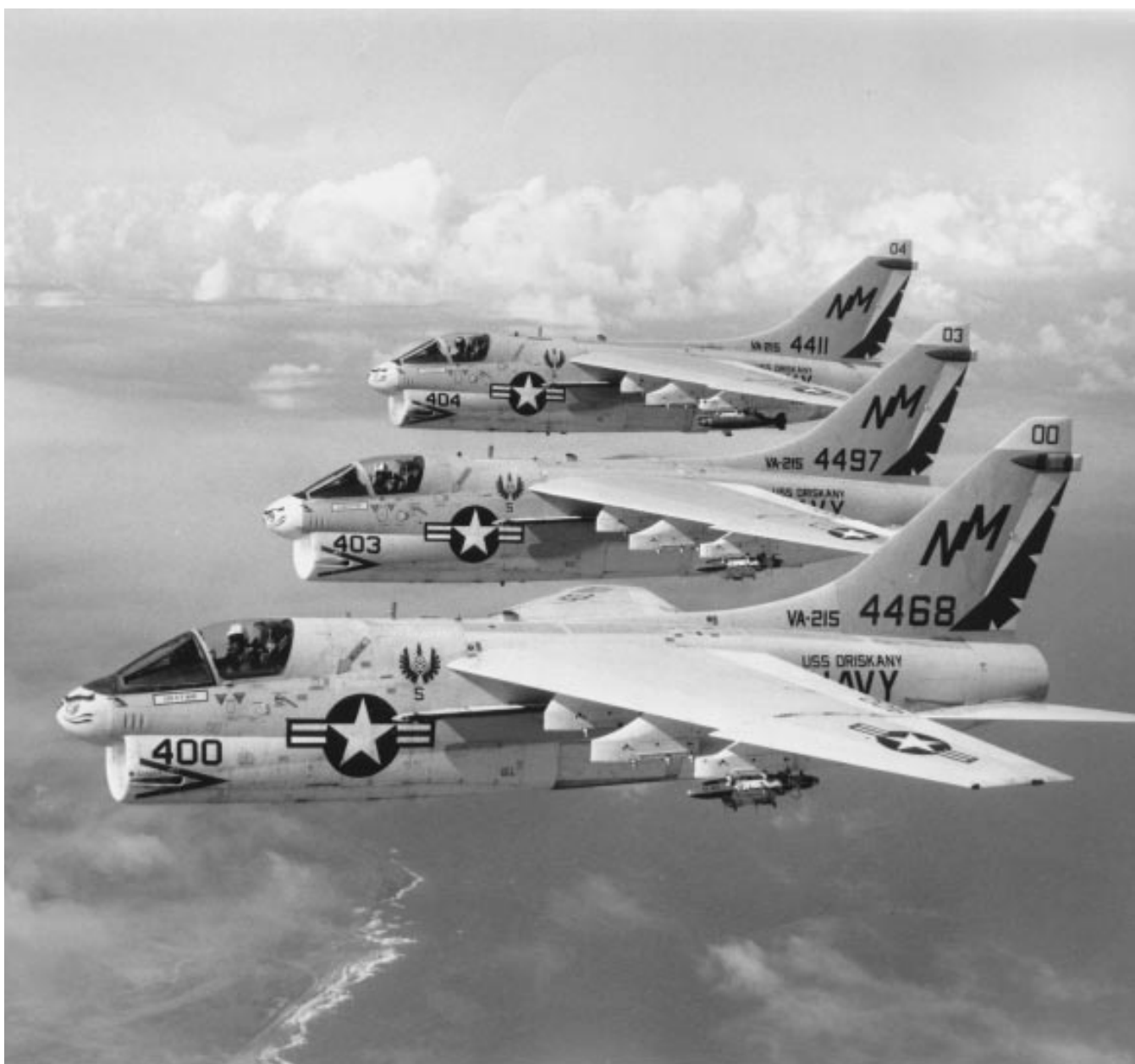
A formation of squadron A-7B Corsair IIs in 1972.