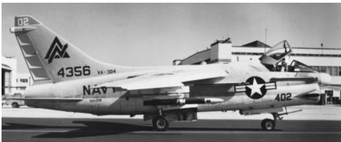
A squadron A-7A Corsair II at NAS Alameda, California, in 1975.