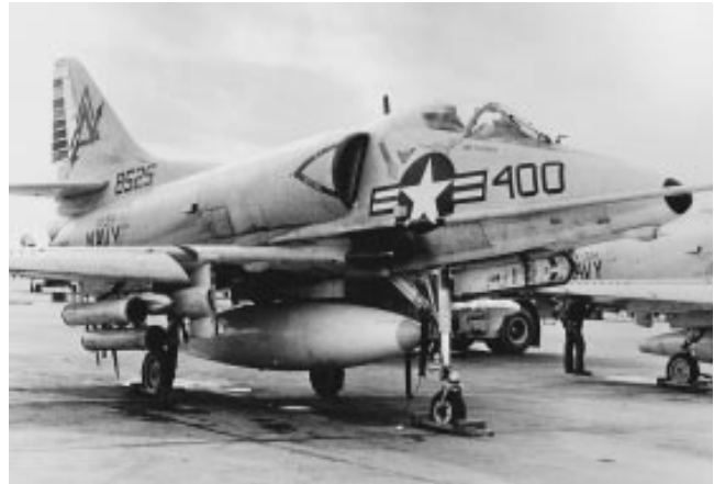
A squadron A-4C Skyhawk, circa 1970 or 1971.

Aug 1988: VA-304 was the first reserve squadron to receive and operate the A-6E Intruder.