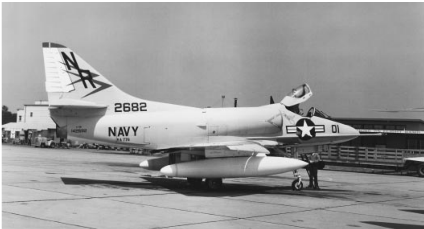
A squadron A-4B Skyhawk (Courtesy Robert Lawson Collection).