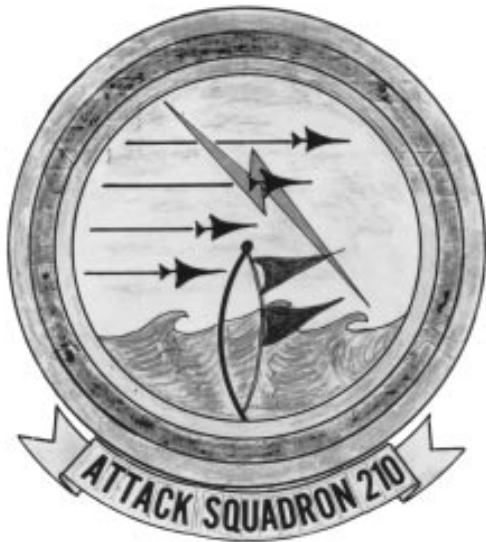
The squadron's one and only insignia.

The squadron's insignia was approved by CNO on 15 April 1970. Colors for the insignia were: sky blue background with three concentric rings of yellow,