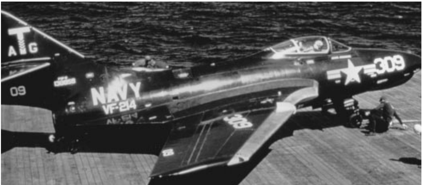
A squadron F9F-8 Cougar aboard Yorktown (CVA-10), circa 1956.