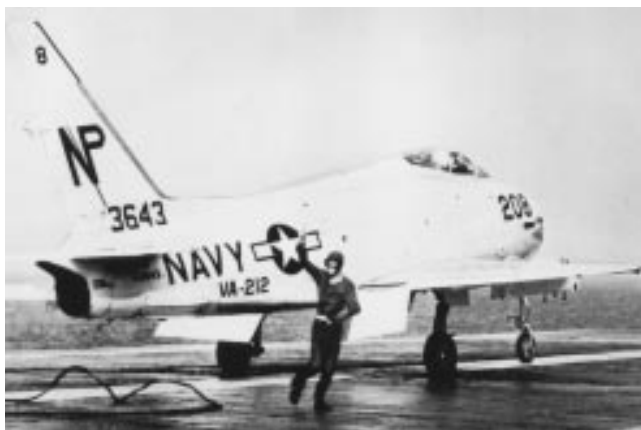
A squadron FJ-4B Fury preparing for launch from Lexington (CVA 16) during her 1959 deployment to WestPac.