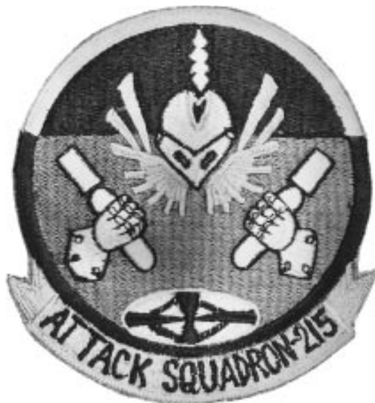
The barn owl insignia used by the squadron.

Disestablished on 31 August 1967. The first squadron to be assigned the VA-215 designation.