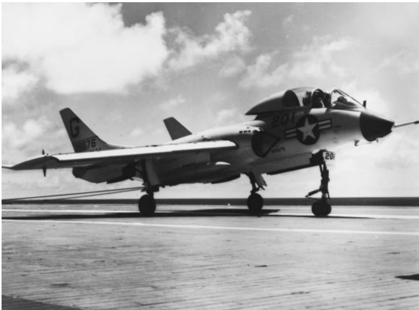
A squadron F7U-3 Cutlass catching the wire aboard Bon Homme Richard (CVA 31) in July 1956.