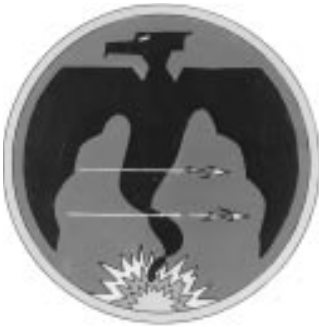
The squadron's thunderbird insignia.

The squadron's insignia was approved by CNO on 5 December 1955. Colors for the thunderbird insignia were: a light blue background with a yellow border; black stylized thunderbird; yellow and red flame; and white double arrow shafts.