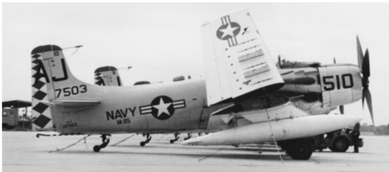
A squadron Skyraider, circa 1963 or 1964.

§ VA-85 was the first fleet squadron to receive the A-6E.