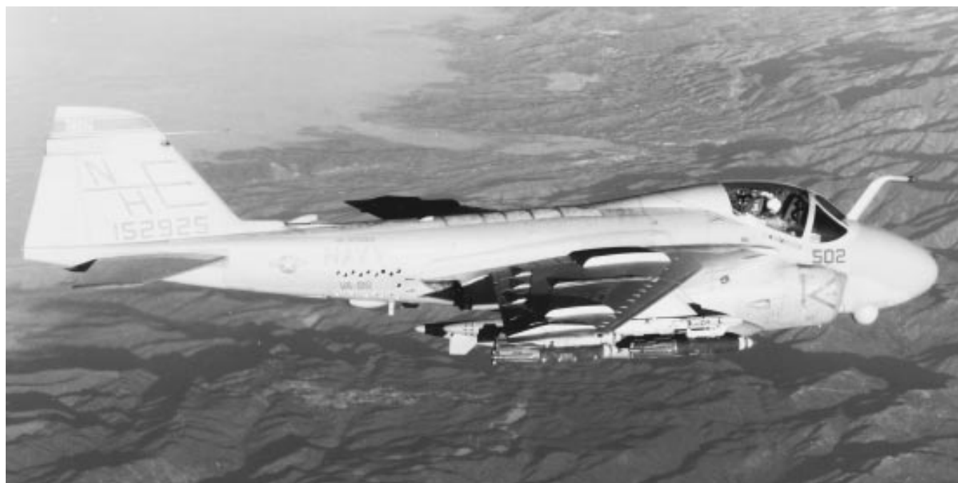
A squadron A-6E Intruder in flight, 1987.