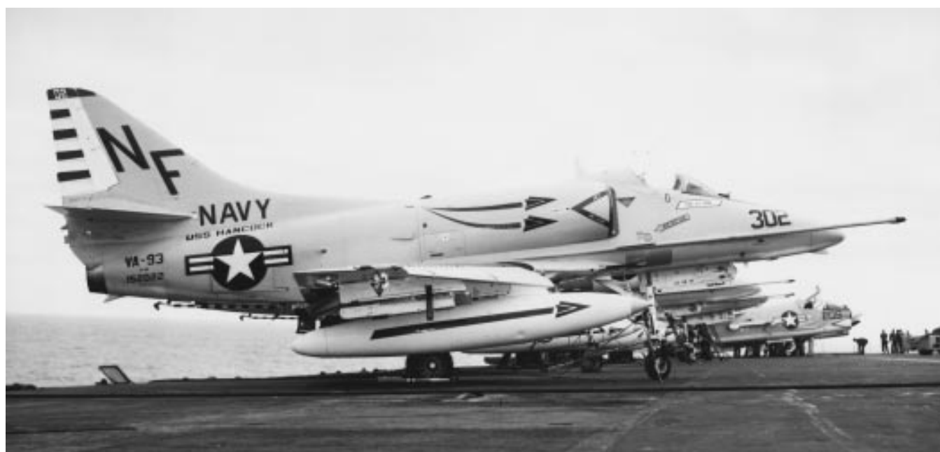
A squadron A-4E Skyhawk aboard Hancock (CVA 19) during their 1967 combat cruise to Vietnam. Notice the stylized aircraft on the fuselage aft of the jet intake.

† During the period 25 April to 17 August 1977, VA-93 was shore based at NAS Cubi Point, Philippines, transitioning from the A-7A to the A-7E.