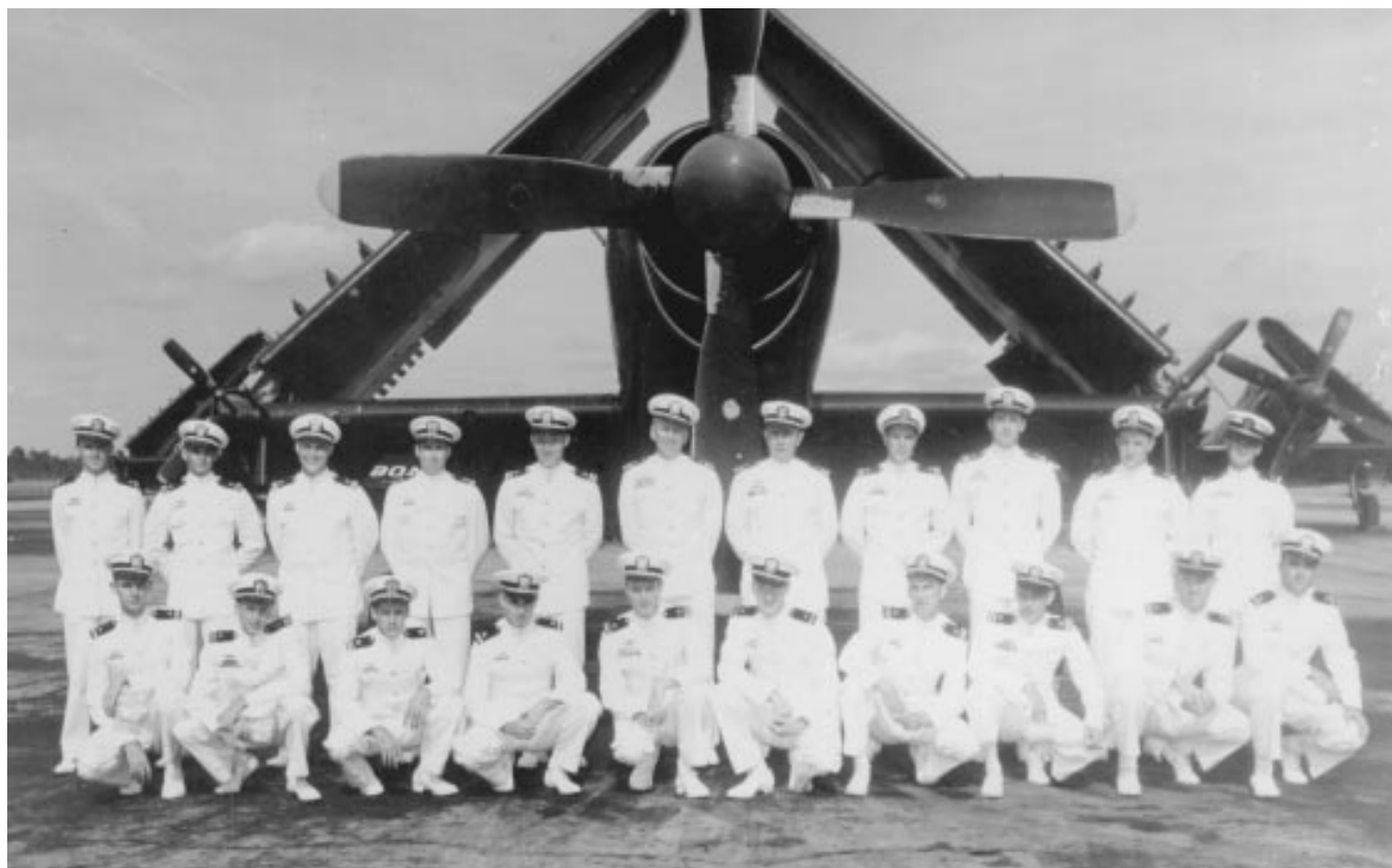
Squadron pilots in front of a squadron AM-1 Mauler, circa 1948.