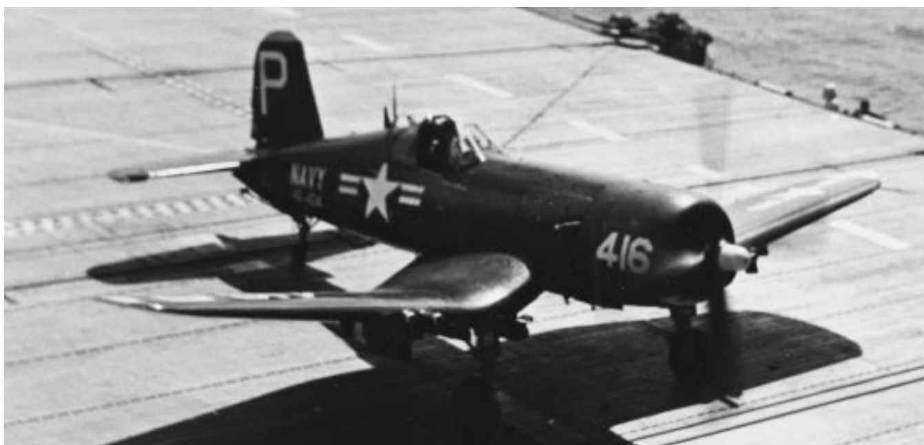
A squadron F4U-5 aboard Randolph (CVA 15), circa 1953.