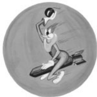
The squadron's first insignia.

The squadron's insignia was approved by CNO on 22 May 1951. Colors for the woodpecker astride a