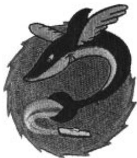
The flying tiger shark was the squadron's first insignia.

The squadron's first insignia was approved by CNO on 14 April 1954. Colors for the flying tiger shark