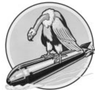
The squadron insignia was approved in March 1944.

background of light blue with an inner circle of white and a black outer circle; the bird was pearl gray with white highlights and outlined in black; the leg and ruff of feathers around the neck were white with blue markings; the head, neck and feet a drab yellow, and the beak was black; the torpedo had shades of gray with a white, black