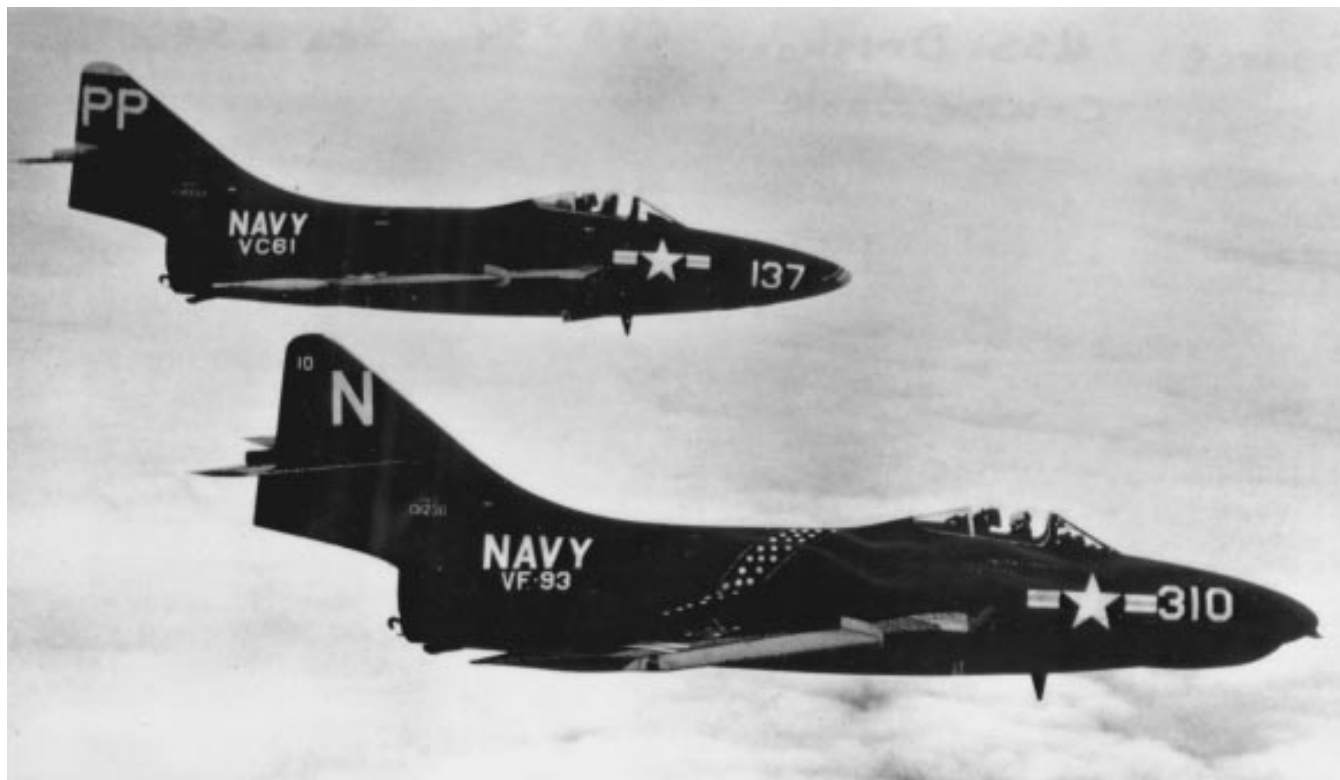
A squadron F9F-8 Cougar flies along side a VC-61 Det M F9F-8 during deployment to WestPac in 1956 aboard Oriskany (CVA 34).