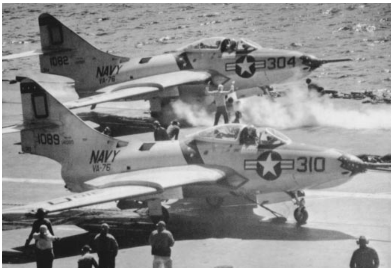
Squadron F9F-8Bs prepares for launch from Forrestal (CVA 59) during her first deployment to the Med in 1957.

† CVG-6 was redesignated CVW-6 when Carrier Air Group (CVG) designations were redesignated Carrier Air Wings (CVW) on 20 December 1963. Sometime in the latter part of 1962 CVG-6's tail code was changed from AF to AE.