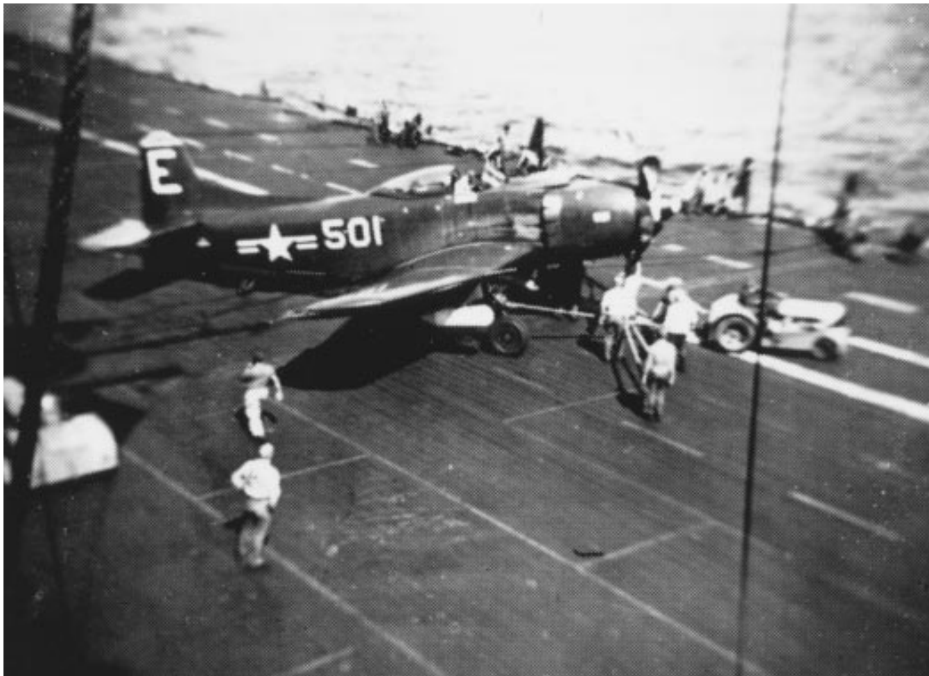
A squadron AM-1 Mauler aboard Midway (CVB 41) in May 1949 (Courtesy Wallace Russel Collection).