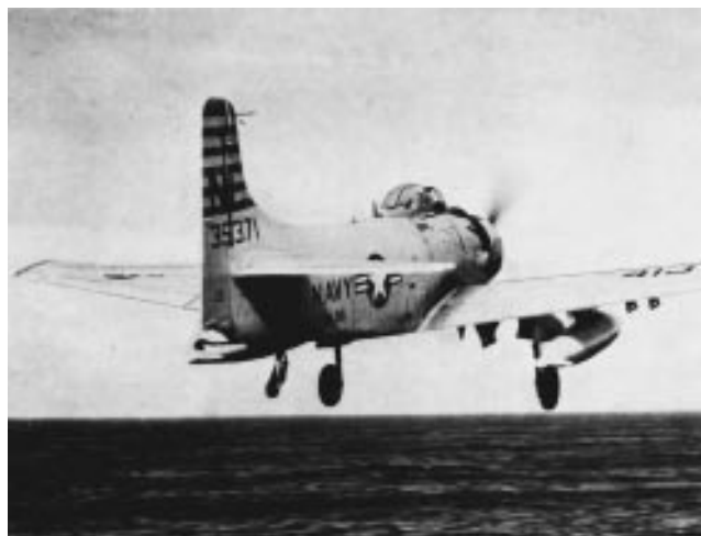
A squadron AD Skyraider launches from Kearsarge (CVA 33) during its 1957-1958 western Pacific cruise.