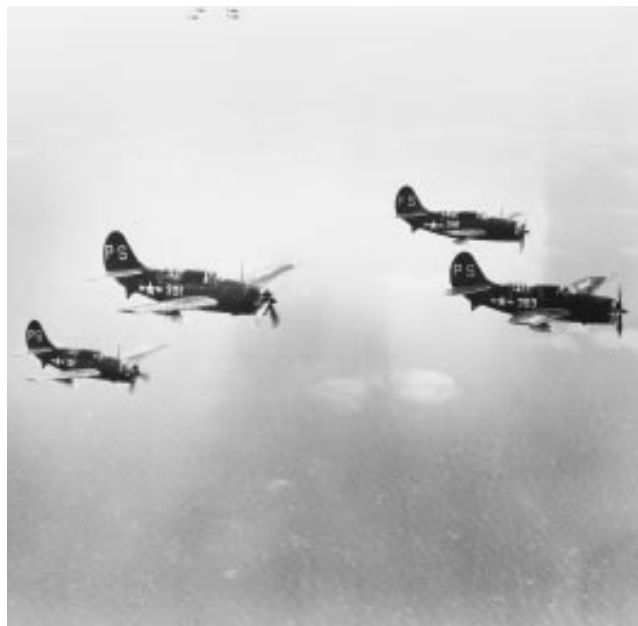
A flight of squadron SB2C-5 Helldivers during deployment to the Med in 1948 aboard Philippine Sea (CV 47).