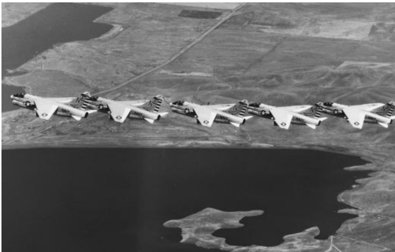
A flight of squadron A-7B Corsair IIs in 1969.