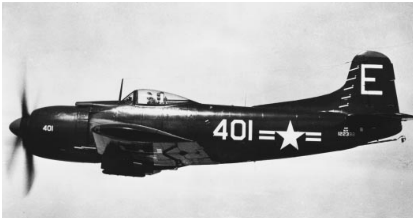
A squadron AM-1 Mauler in flight, circa 1949 (Courtesy Robert Lawson Collection).

Air Wing Tail Code Assignment Date CVG-8 E 15 Sep 1948