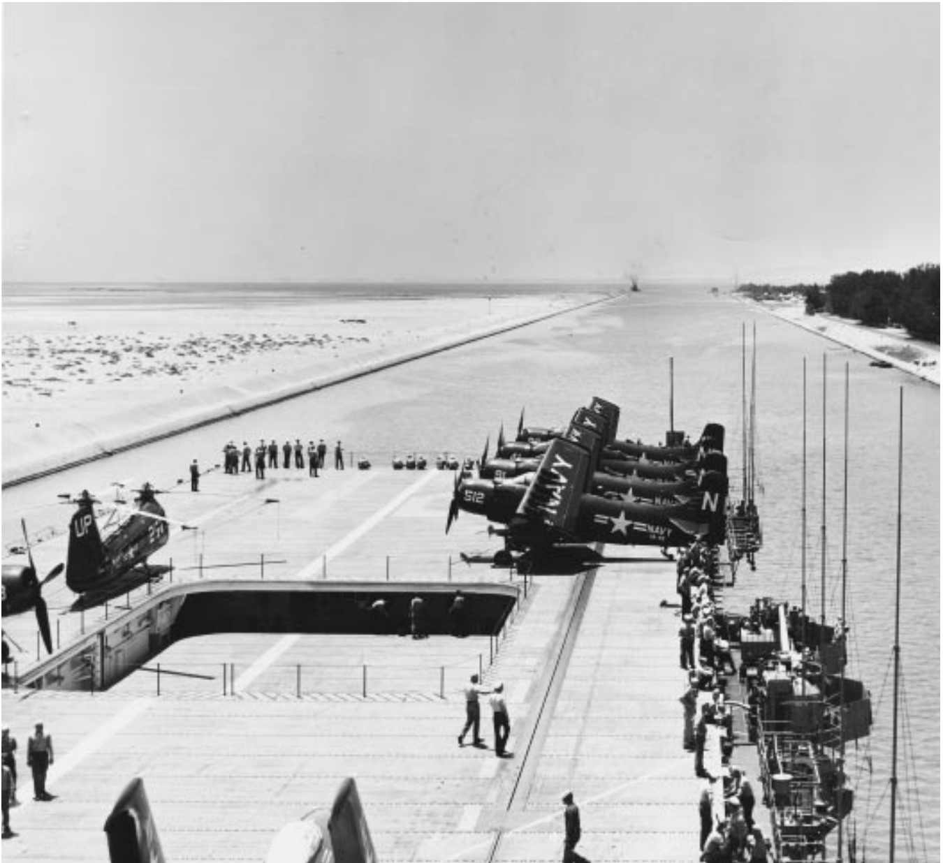
A squadron AD-6 Skyraider positioned on the forward part of the flight deck along with other air wing Skyraiders. The photo was taken during Hornet's (CVA 12) transit through the Suez Canal in June 1954 during her world cruise.