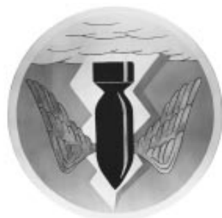
The squadron's second insignia was a more stylized designed reflecting its attack mission.

Following the squadron's redesignation a new insignia was approved by CNO on 24 May 1954. Colors for the winged bomb insignia were: blue background outlined in red; the clouds and wings were silver with black markings; the lightning bolt was yellow, edged with red; and the bomb was black with silver shading.