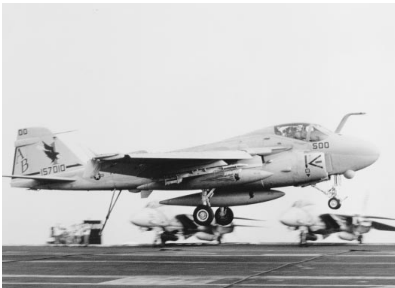
A squadron A-6E Intruder, with CAG markings, landing aboard America (CV 66) in 1993.