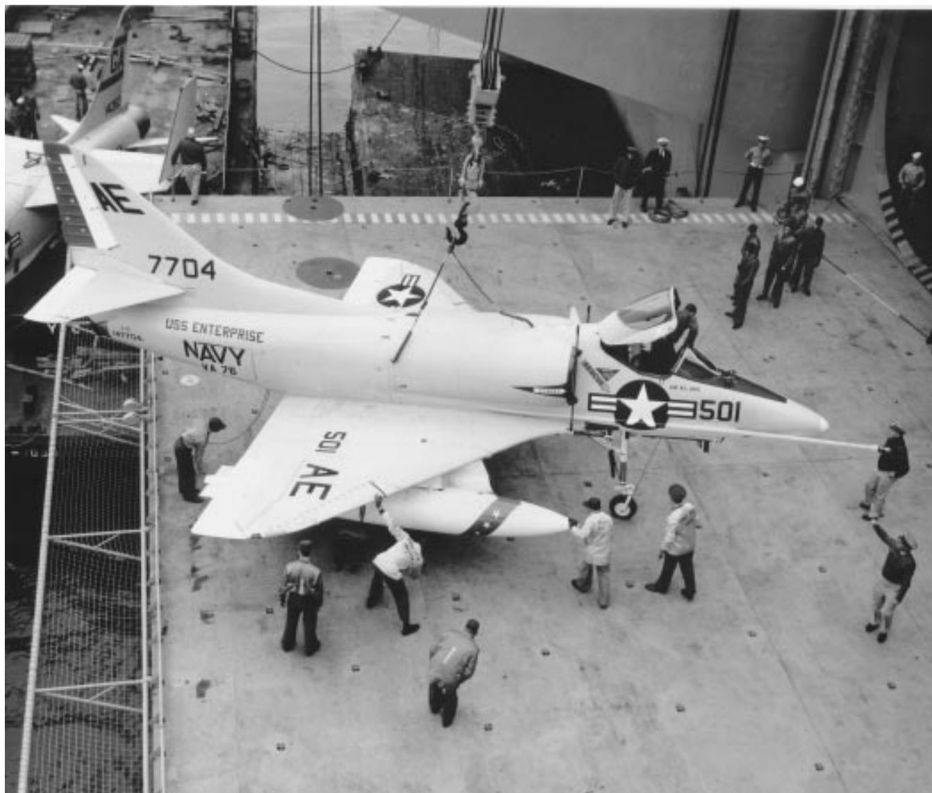
A squadron A-4C Skyhawk on the elevator of Enterprise (CVAN 65) in 1965.