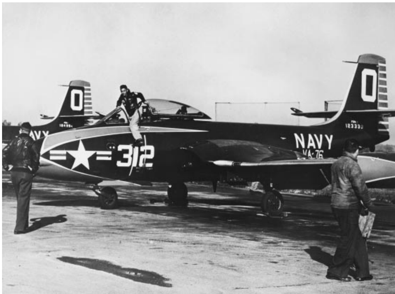
A squadron F2H-2 Banshee in 1956.