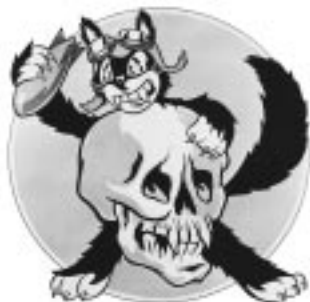
The squadron insignia was approved for use in December 1943.

The squadron insignia was approved by CNO on 9 December 1943. Colors for the cat and skull insignia