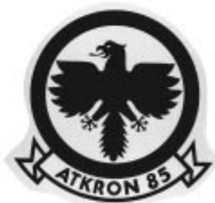
The stylized black falcon was used by the squadron for over 35 years before its disestablishment.