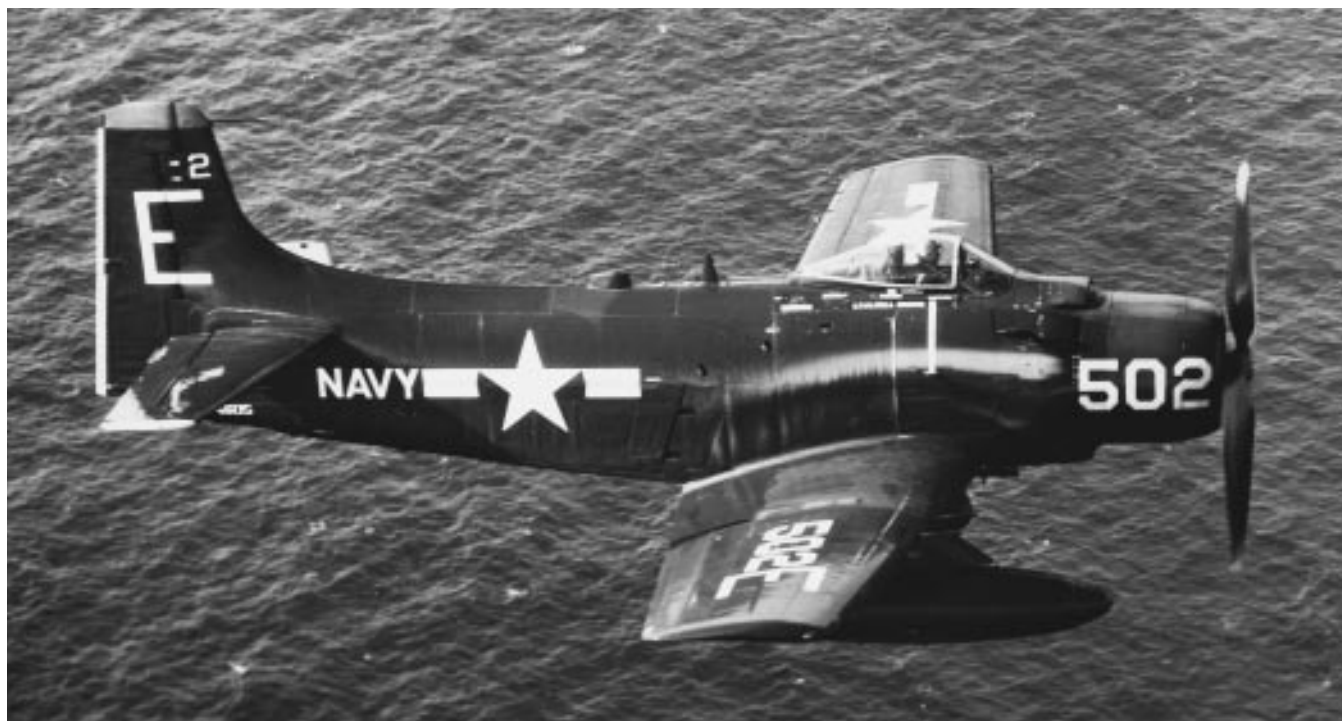
A squadron AD-6 Skyraider during its deployment to the Med aboard Lake Champlain (CVA 39) in 1954–1955.

Dec 1993: Squadron aircraft provided support for reconnaissance missions over southern Iraq, part of Operation Southern Watch.