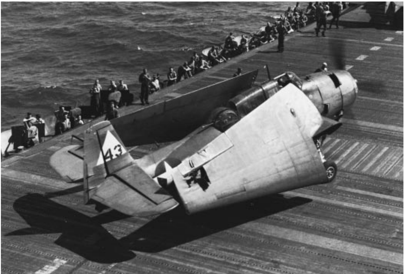
A squadron TBM-1C aboard Enterprise (CV 6) in October 1944. Note the damage on the wing of the aircraft.