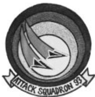
The stylized aircraft design was the last insignia used by the squadron.

A new insignia was approved by CNO on 19 November 1965. Insignia colors for the stylized aircraft with a series of circles were: a dark blue outer circle followed by a medium blue circle, then a light