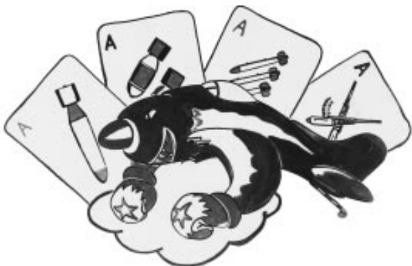
The squadron's short-lived insignia.

The squadron's insignia was approved by CNO on 9 May 1949. The following colors were used in the