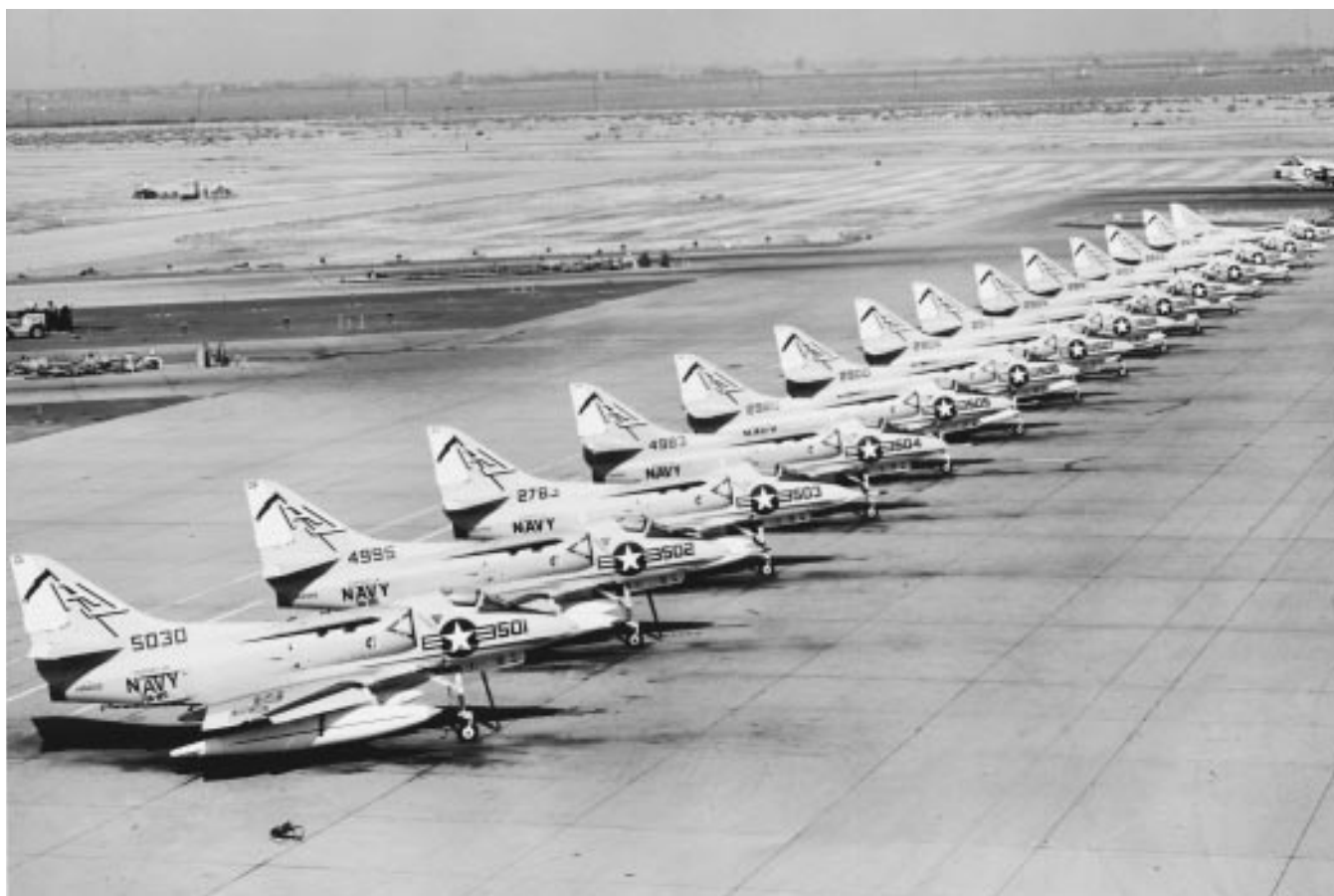
All 14 of the squadron's A-4B Skyhawks are parked in numerical order on the flight line in 1967.