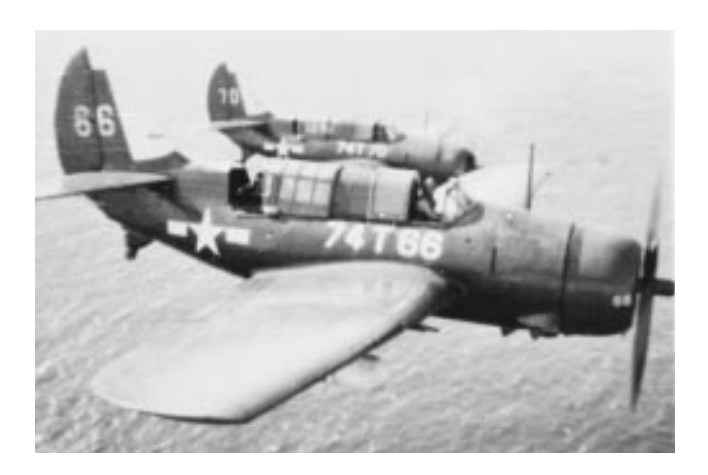
A rare photo of a squadron SB2C in post-World War II markings. What is even more interesting is the fact that a torpedo squadron was assigned an aircraft designed primarily as a bomber.

26 Mar 1993: The squadron held a disestablishment ceremony at NAS Oceana, it was officially disestablished on 31 March 1993.