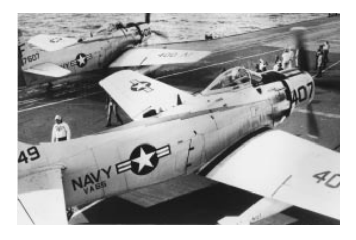
Squadron AD-6 Skyraiders are directed to the catapult aboard Intrepid (CVA 11) in 1961.