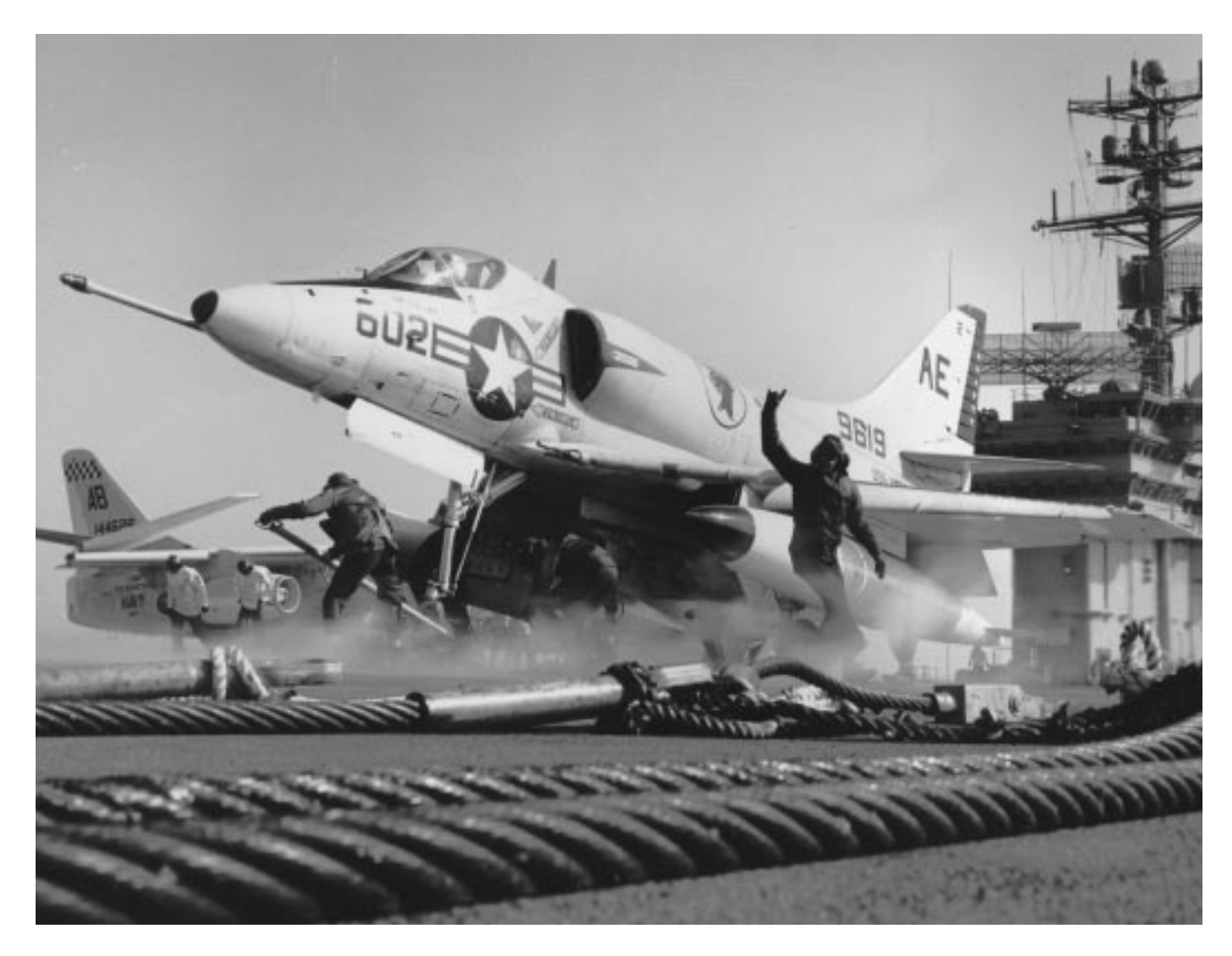
A squadron A-4C Skyhawk is prepared for launch from America (CVA 66) in 1965.