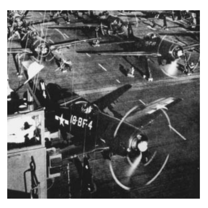
A VBF-18 F8F Bearcat on Leyte's (CV 32) flight deck during her goodwill cruise to South America in 1946. In the background are other Carrier Air Group 18 aircraft.

8 Jun 1991: The last two squadron aircraft participated in the Desert Storm Victory Parade Fly Over in Washington, D.C.