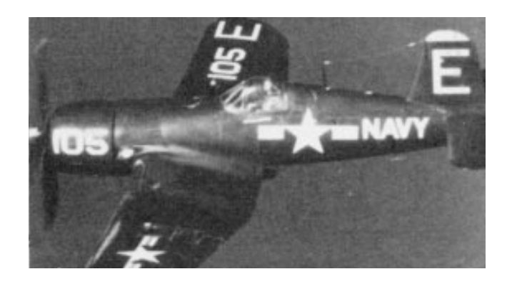
A squadron F4U-4 Corsair during its deployment to the Med aboard Tarawa (CV 40) in 1952.

31 Mar 1987: VA-66 Detachment was disestablished.