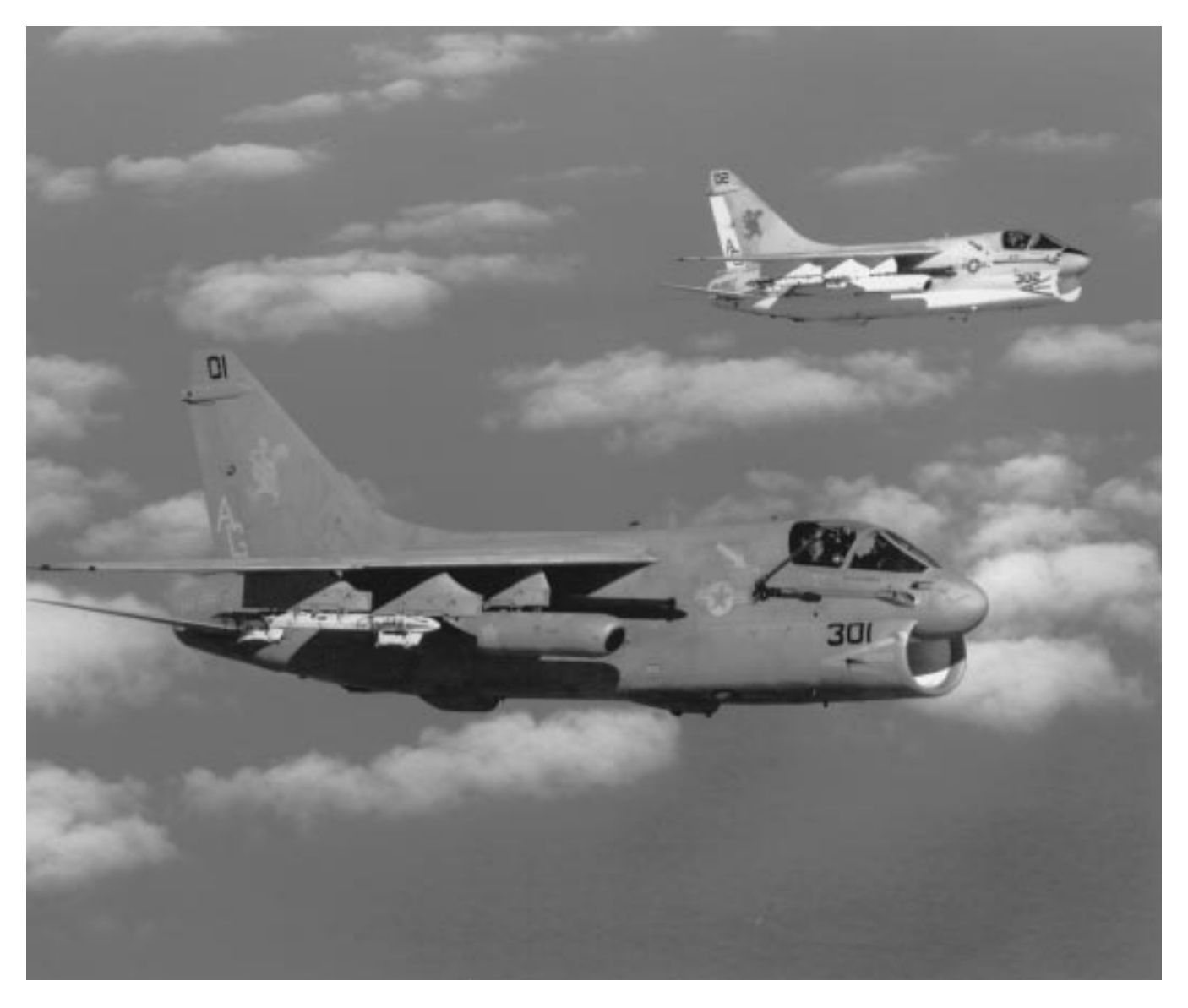
Two squadron A-7E Corsair IIs show the difference between the old and new paint schemes in 1984. The gun-toting rooster insignia is on the tail of both aircraft.