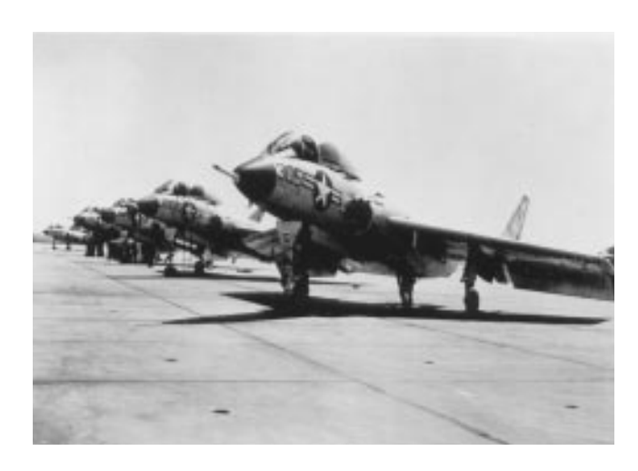
A squadron F7U-3 Cutlass on the flight line, believed to be at NAS Port Lyautey, Morocco. The squadron was stationed at the air station during part of its 1953 Med cruise.