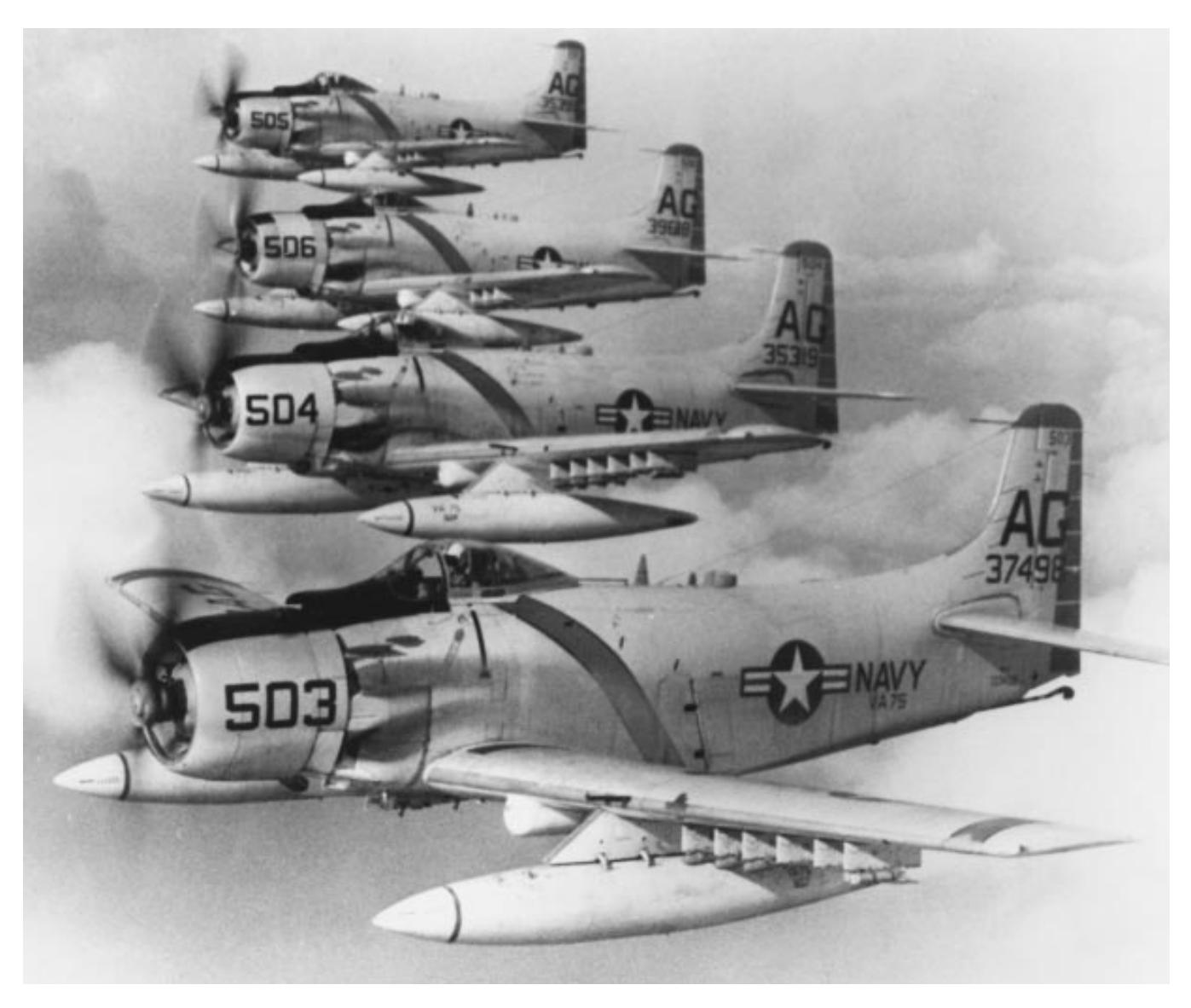
A formation of squadron AD-6 Skyraiders.