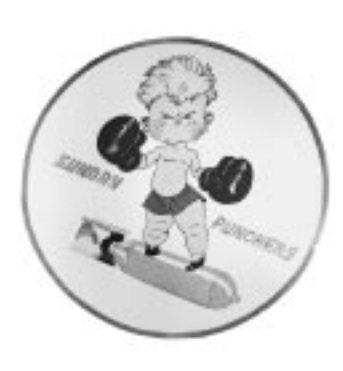
This insignia was used by the squadron from 1947 to sometime around 1950.

for the insignia of a boy riding a bomb were: a light blue background outlined in gold; Sunday Punchers lettering was medium blue and the VA-7A lettering on the trunks was gold; the bomb was medium blue with black highlights; the boy had tan skin with red cheeks,