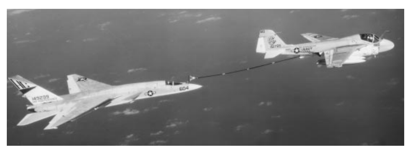
A KA-6D from VA-65 refuels an RA-5C Vigilante, 1971.