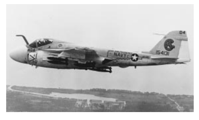
A squadron A-6A Intruder in flight with a load of bombs, 1970.