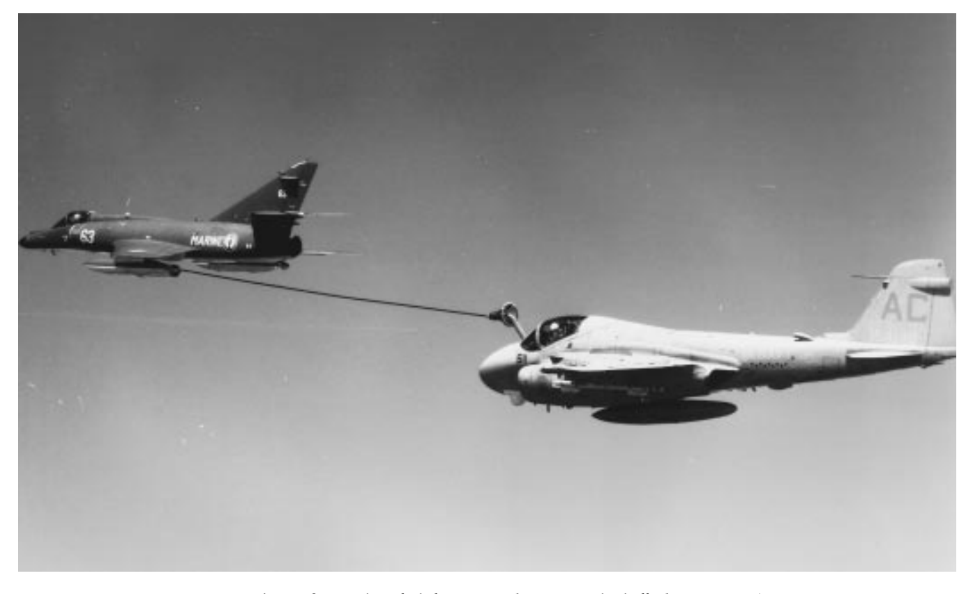
A squadron A-6E Intruder refuels from a French Super Etendard off Lebanon in 1984.