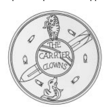
The Carrier Clowns insignia was used by VT-18.

The squadron's first insignia was in use by the squadron prior to its approval by CNO on 24 March