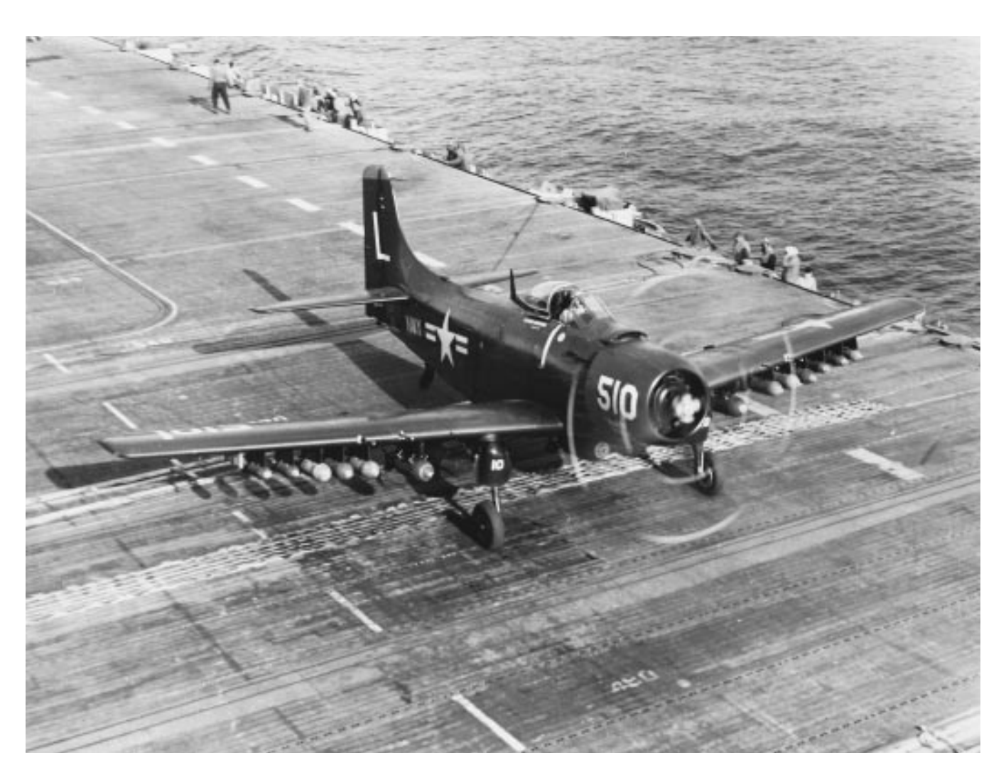
A squadron AD-4 Skyraider launches from deck of Bon Homme Richard (CVA 31), November 1952.

Inclusive Dates Covering Unit Award Oct 1944 Nov 1944