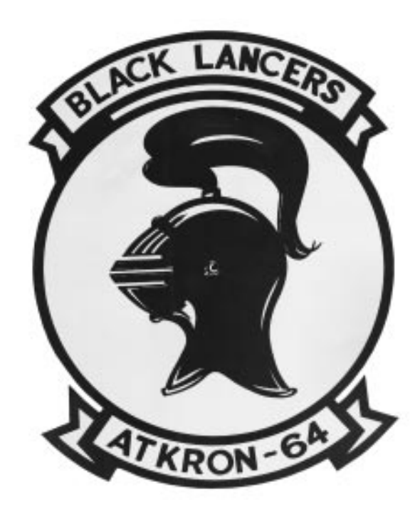
The Black Lancers' insignia.

The squadron's insignia was approved by CNO on 26 December 1961. Colors for the insignia were: a