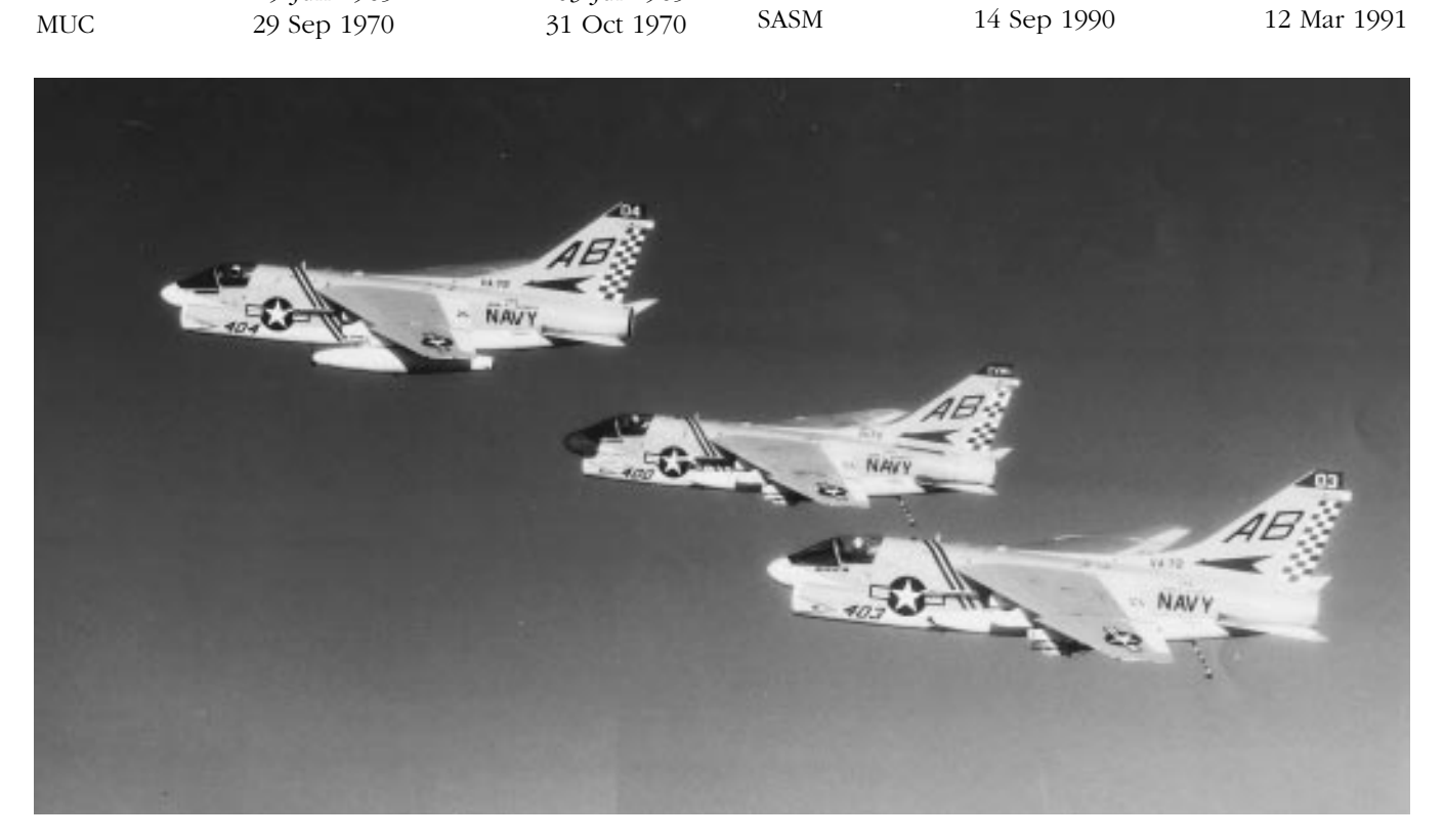
A flight of squadron A-7 Corsair IIs.