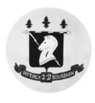
Following the squadron's redesignation as an attack squadron, the knight chess piece insignia was approved.

on 9 August 1945. During the time when the squadron's insignia was approved, VT-74 was flying the SB2C which was nicknamed the Beast. Consequently, the squadron's insignia took on the shape of a beast riding a torpedo. There is no record of the colors used for this insignia.