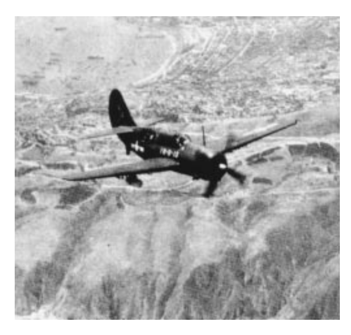
A squadron SB2C-5 Helldiver on a flight over Valparaiso Harbor during its goodwill cruise to South America aboard Leyte (CV 32) in 1946.