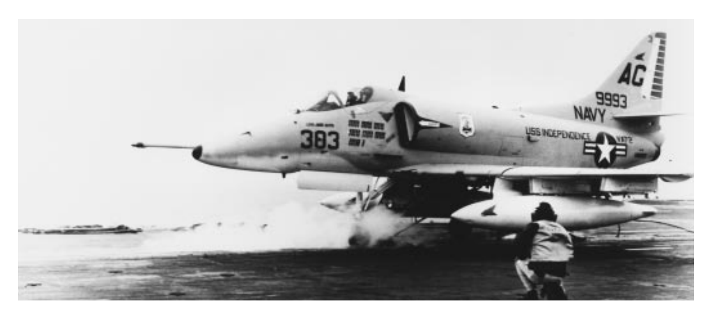
A squadron A-4 Skybawk launches from Independence (CVA 62). Notice the combat markings on the aircraft just forward of the jet intake showing the number of combat sorties flown by the aircraft.