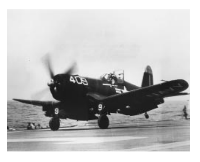
A squadron F4U-4 Corsair launches from Bon Homme Richard (CV 31), circa 1952.