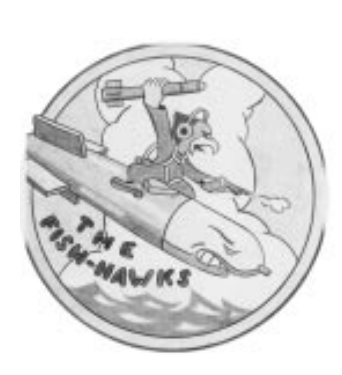
The insignia approved for use by VT-75.

VT-75's insignia was approved by CNO on 10 August 1945. Colors for the Fish-Hawk insignia were: