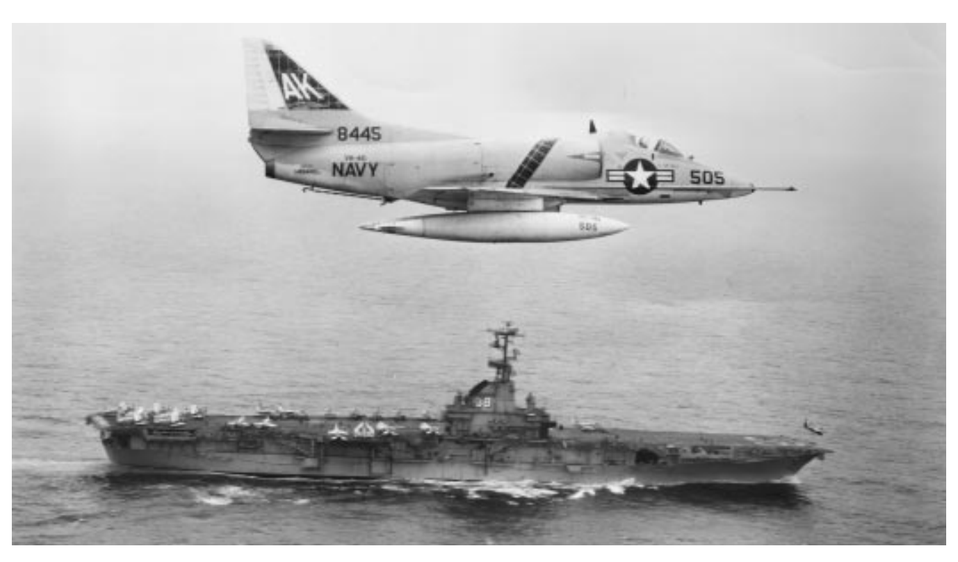
A squadron A-4C Skyhawk flies over Shangri-La (CVA 38) during their deployment to the Med in 1962.