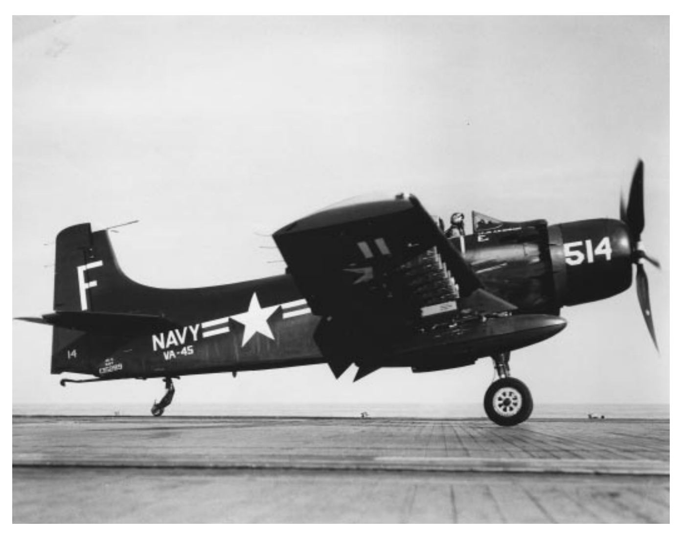
A squadron AD-6 Skyraider launches from the deck of Intrepid (CVA 11) in 1955.