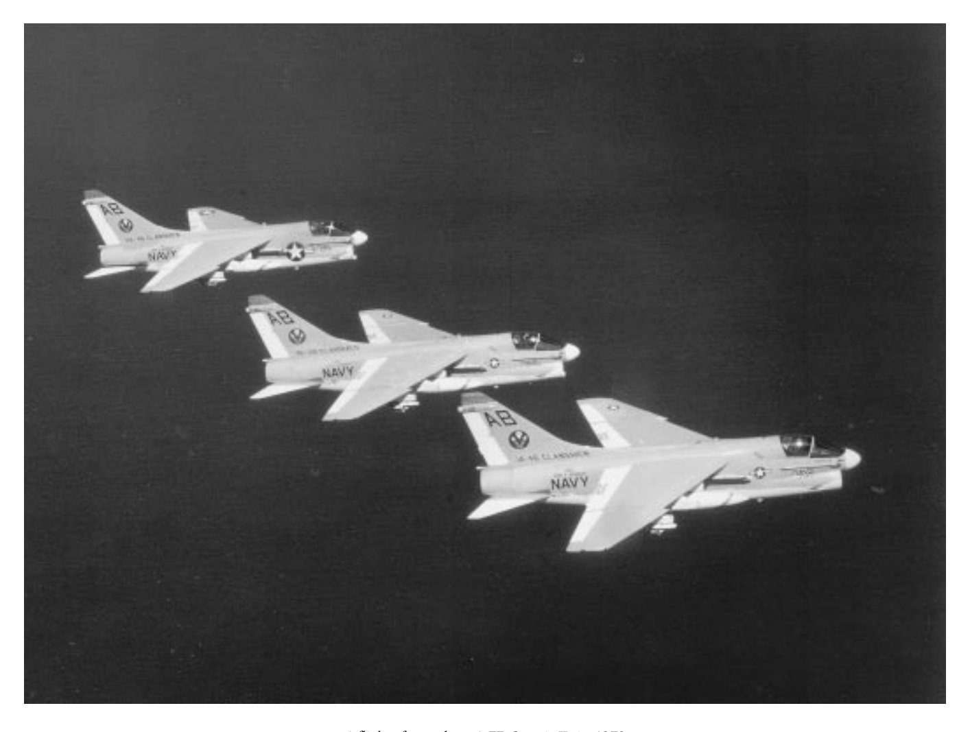
A flight of squadron A-7E Corsair IIs in 1979.