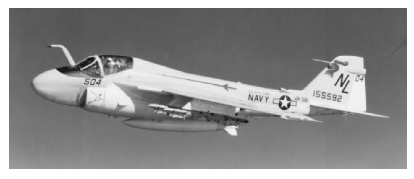
A squadron A-6E Intruder in 1984. Notice the lance and knight helmet markings taken from the squadron's insignia.