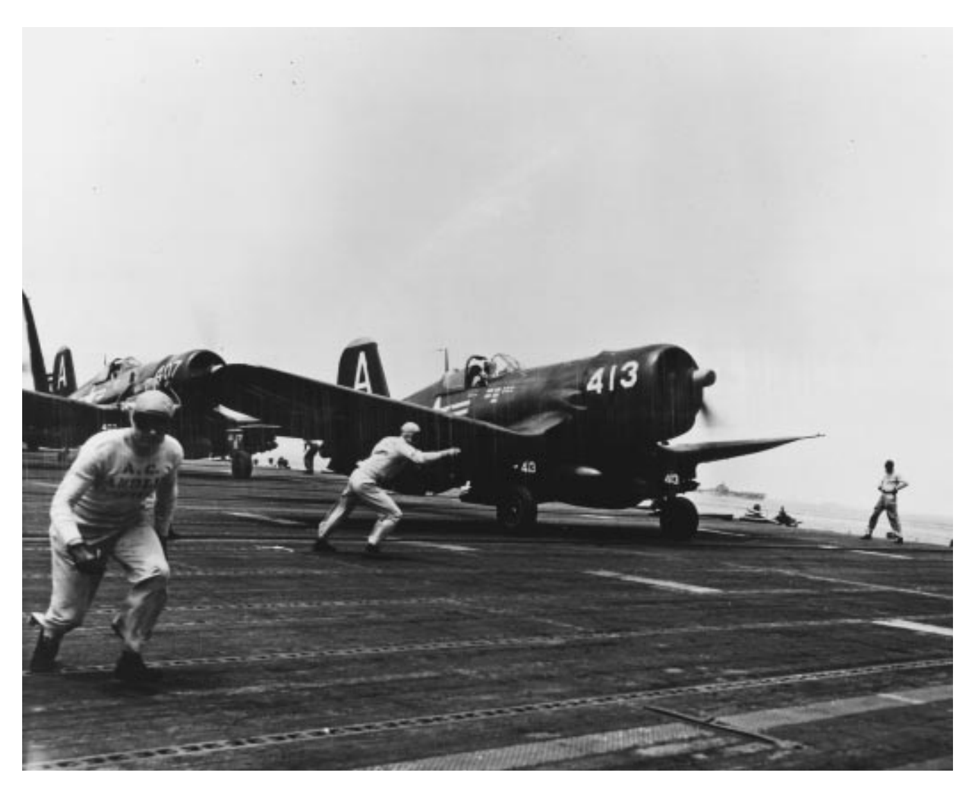
Squadron F4U-4 Corsairs launch from Boxer (CV 21) during a combat deployment to Korea in 1951.

Aug 1988: The squadron flew sorties in support of Earnest Will operations, the escorting of reflagged Kuwait tankers in the Persian Gulf.