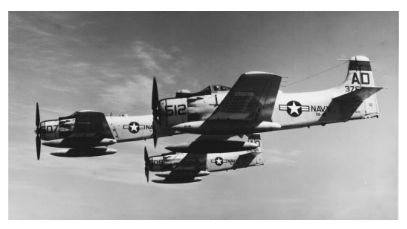
A flight of squadron AD (A-1) Skyraiders.