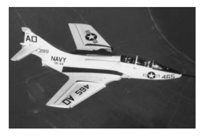
A squadron F9F-8T (TF-9J) Cougar in flight, circa 1964 (Courtesy Robert Lawson Collection).