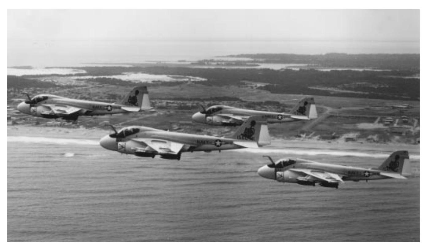
A flight of the squadron's A-6E Intruders on a training mission in 1974.

Inclusive Dates Covering Unit Award Jan 1979 Dec 1981 01 Oct 1986 30 Sep 1988