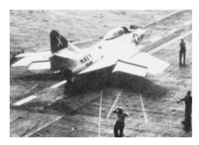
A squadron F9F-8 Cougar preparing for a launch from Randolph (CVA 15).