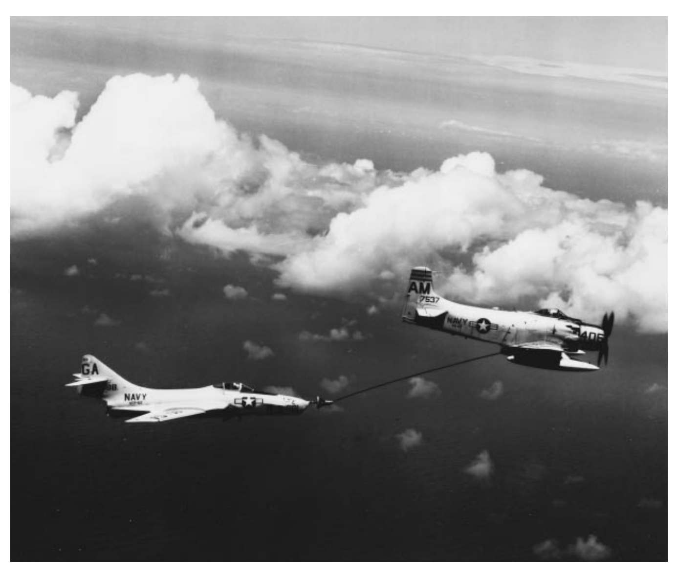
A squadron Skyraider refuels an F9F-8P Cougar from VFP-62 in 1958.