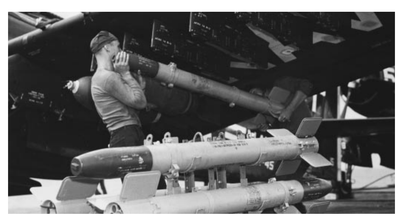
Squadron personnel load 5-inch high-velocity aircraft rockets on one of its AD-6 Skyraiders prior to launch.