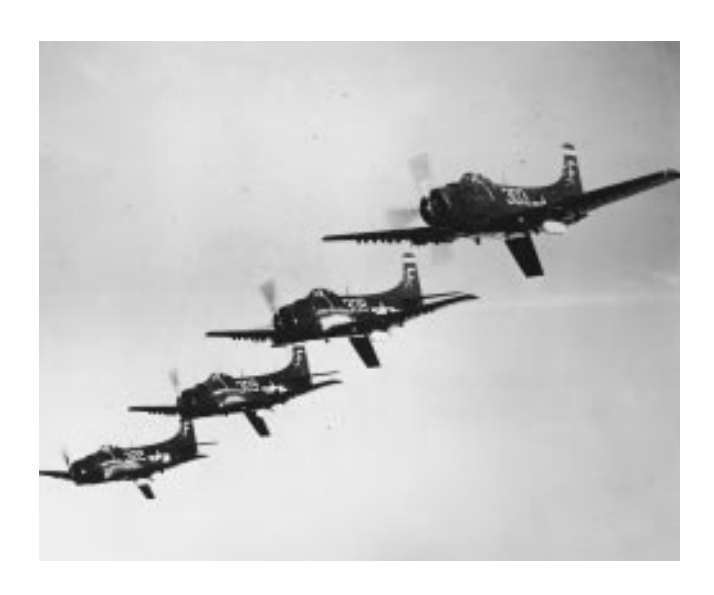
A formation of squadron AD-1 Skyraiders in flight, circa 1948 (Courtesy Robert Lawson Collection).