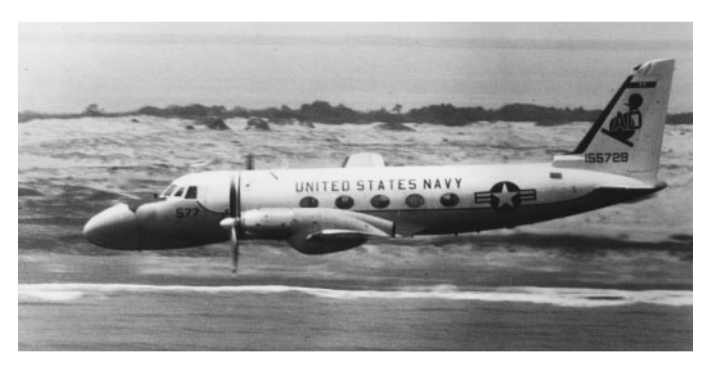
A squadron TC-4C Academe used to train Naval Flight Officers as bombardier navigators.