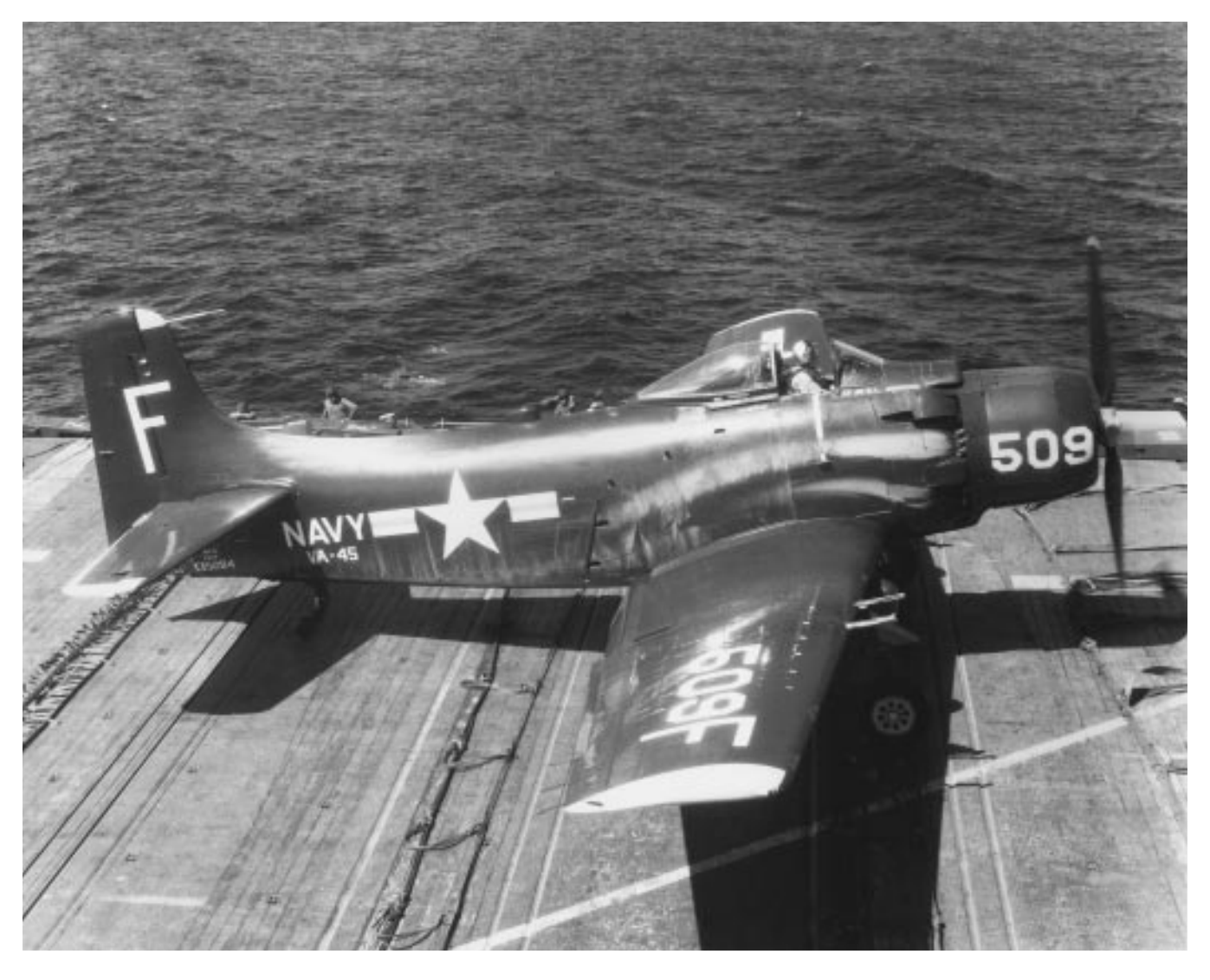
A squadron AD Skyraider taxies on flight deck of Intrepid (CVA-11), circa 1955 (Courtesy Robert Lawson Collection).