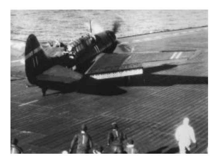
A squadron SB2C-4E prepares to launch from Franklin D. Roosevelt (CVB-42), January 1946.