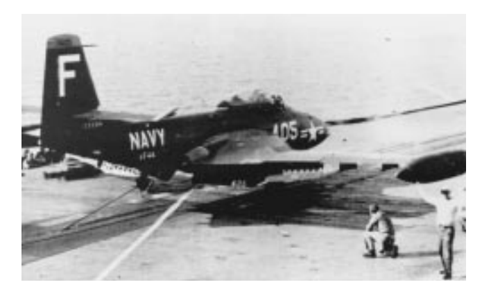
A squadron F2H-2 Banshee is prepared for launch from Intrepid (CVA 11) during her Med deployment in 1955.