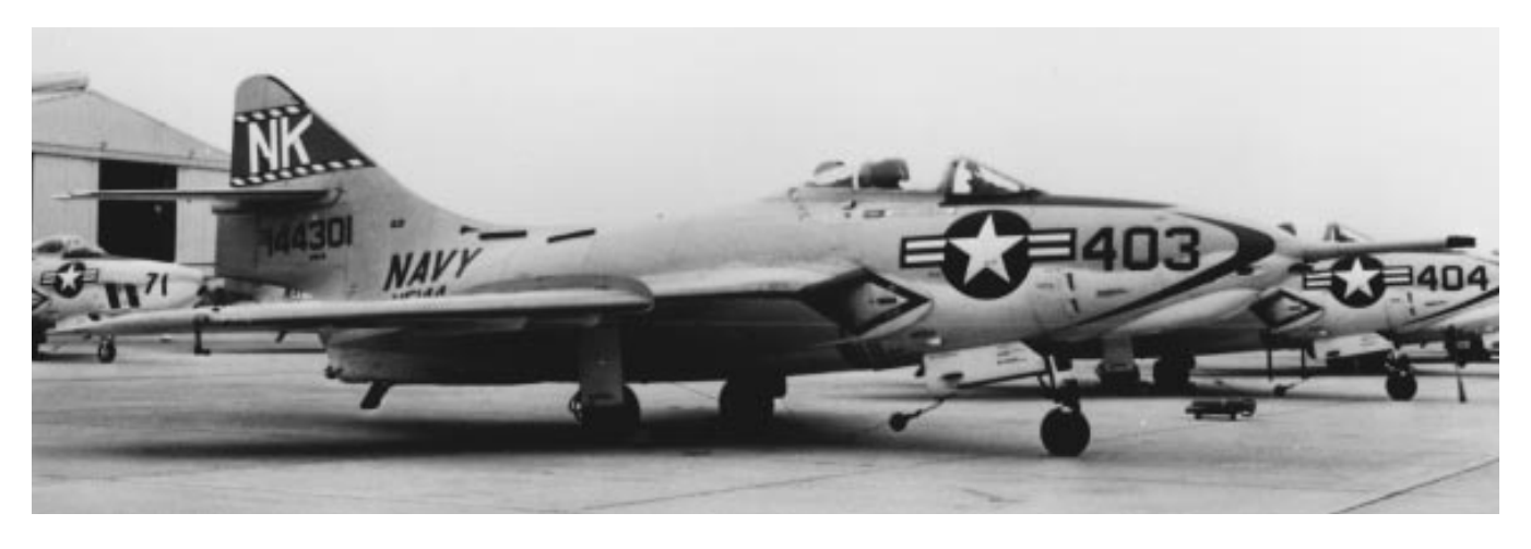
VF-144's F9F-8 Cougar on the flight line at NAS Miramar, California, in 1957.