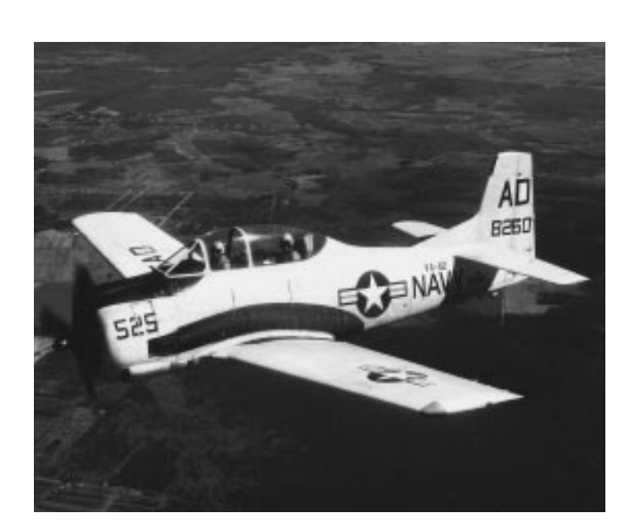
A T-28B Trojan used by the squadron for instrument all-weather flight training.