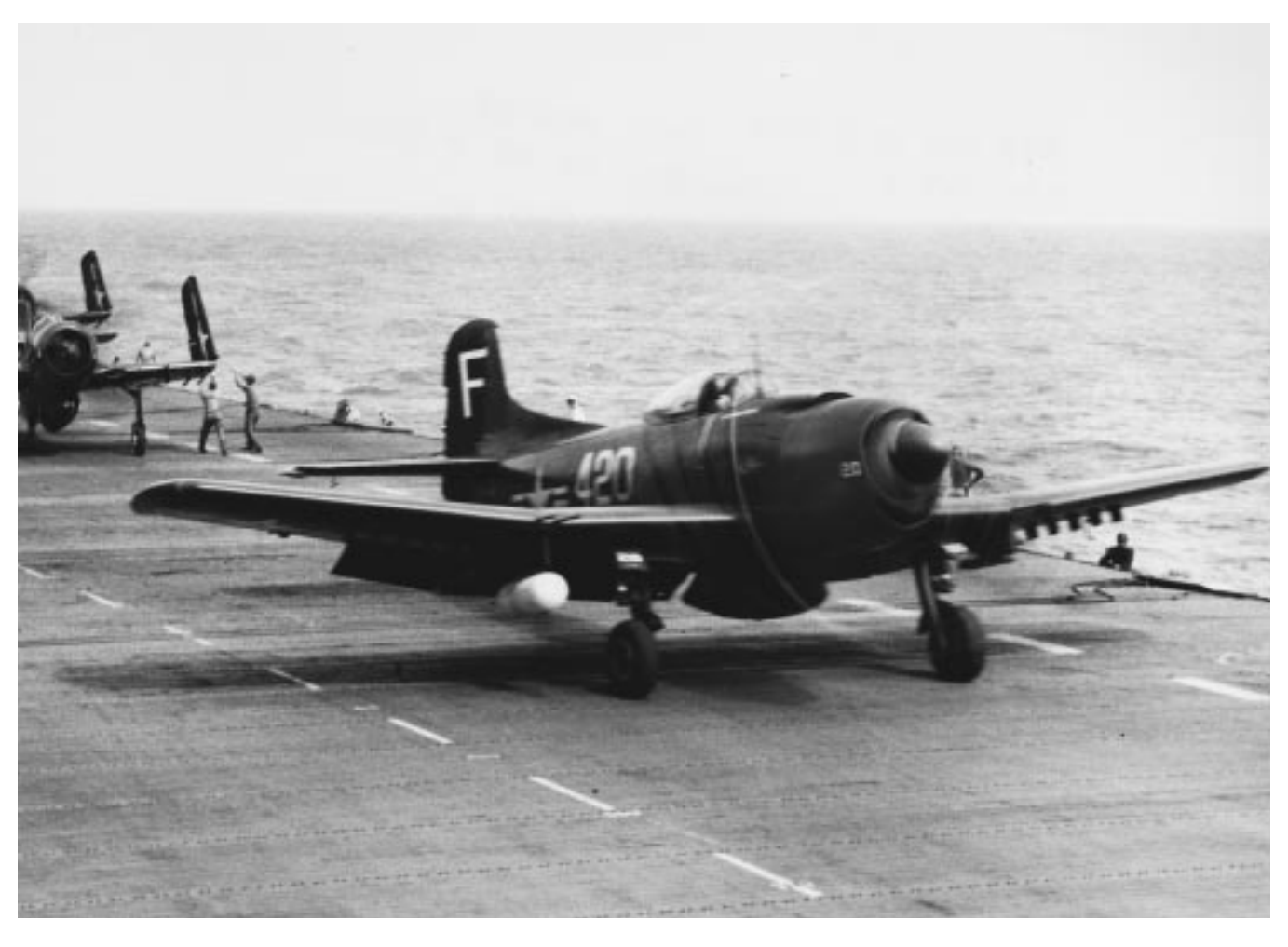
A squadron AM-1 Mauler launches from Midway (CVB 41), circa 1949.