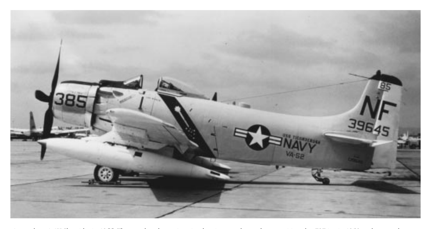
A squadron A-1H Skyraider in 1966. The squadron began it active duty in prop planes, then transitioned to F9F jets in 1953 and returned to props when it received its first Skyraiders in 1958.