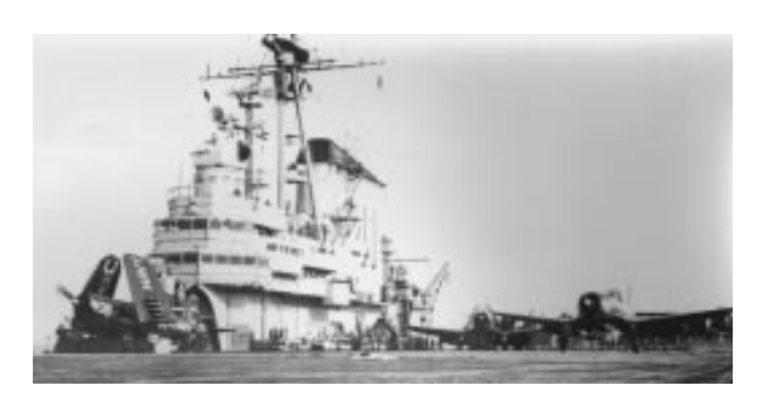
Squadron F4U-4 Corsairs prepare to launch from Midway (CVA 41) during her cruise to the Med in 1953.

Jun 1982: A VA-42 pilot became the first female naval aviator to make an arrested landing in an A-6 during carrier qualifications on Lexington (AVT 16).