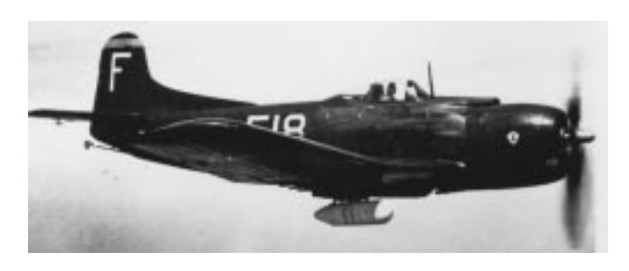
A squadron AM-1 Mauler in flight; note the squadron's insignia on the cowling, circa 1949.