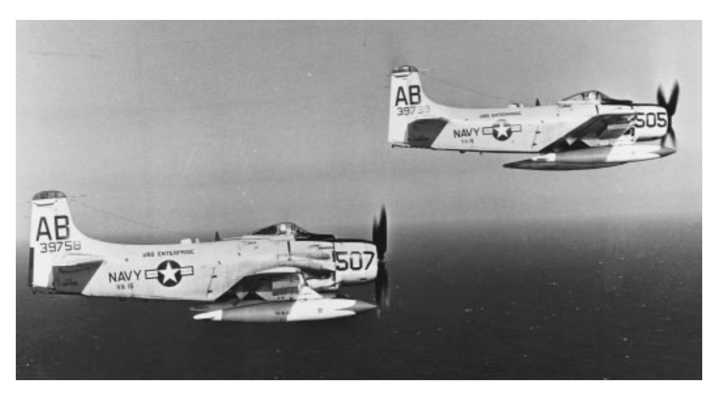
It is believed that this photo of the squadron's AD-6 Skyraiders was taken in 1962 when they operated aboard Enterprise (CVAN 65) during its shakedown cruise in the Caribbean. The squadron never made an overseas deployment aboard Enterprise.

* AD-6 designation changed in 1962 to A-1H.