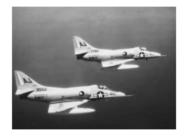
A couple of squadron A-4Cs with markings from their deployment aboard Shangri-La with Air Group 8.

‡ Carrier Air Groups were redesignated Carrier Air Wings on 20 December 1963, hence, CVG-1 became CVW-1.