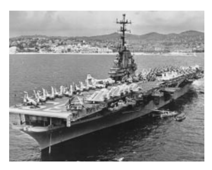
The squadron's AD-6 Skyraiders are spotted on the flight deck aft of the rear centerline elevator. This photo was taken in June 1957 when Lake Champlain (CVA 39) was at anchor in Cannes, France.

† Air Task Group 182's tail code was changed from O to AN in the latter part of 1957. The effective date was most likely the beginning of FY 58 (1 July 1957).