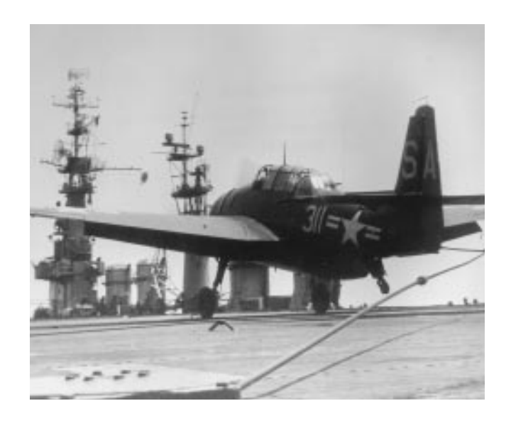
A squadron TBM Avenger catches the wire aboard Saipan (CVL 48).