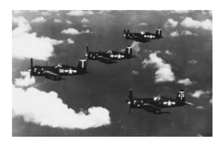
A flight of squadron F4U-4s deployed aboard Tarawa (CV 40) operating from Naval Air Base Kobler, Saipan, in August 1946.

*In 1962, the Navy's aircraft designation system was changed and the A4D-2N was redesignated the A-4C Skyhawk.