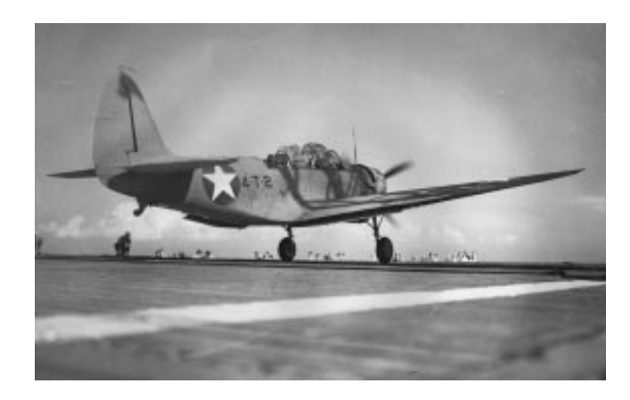
A squadron TBD-1 launches from Ranger (CV 4) sometime in early 1942.

10 Jan 1942: Torpedo Squadron FOUR (VT-4) was established aboard Ranger (CV 4) while the ship was in port at Grassy Bay, Bermuda.