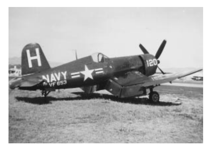
A squadron F4U-4 Corsair, July 1951.