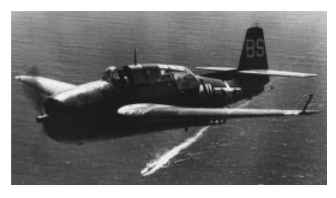
A squadron TBM-3S Avenger in flight, June 1950.

* CVEG-41 was redesignated CVEG-1 on 15 November 1946.