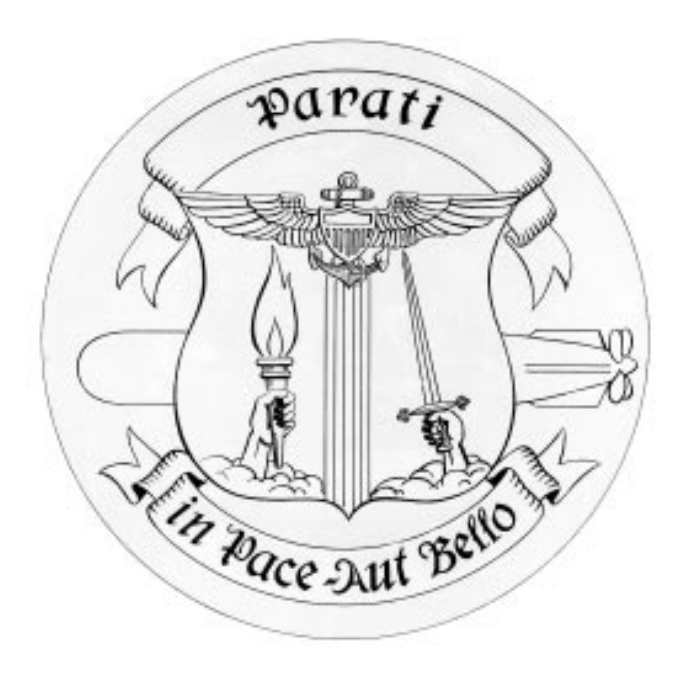
The time frame for the squadron's use of this insignia is unknown.

Disestablished on 5 August 1947. The first and only squadron to be designated VA-22A.