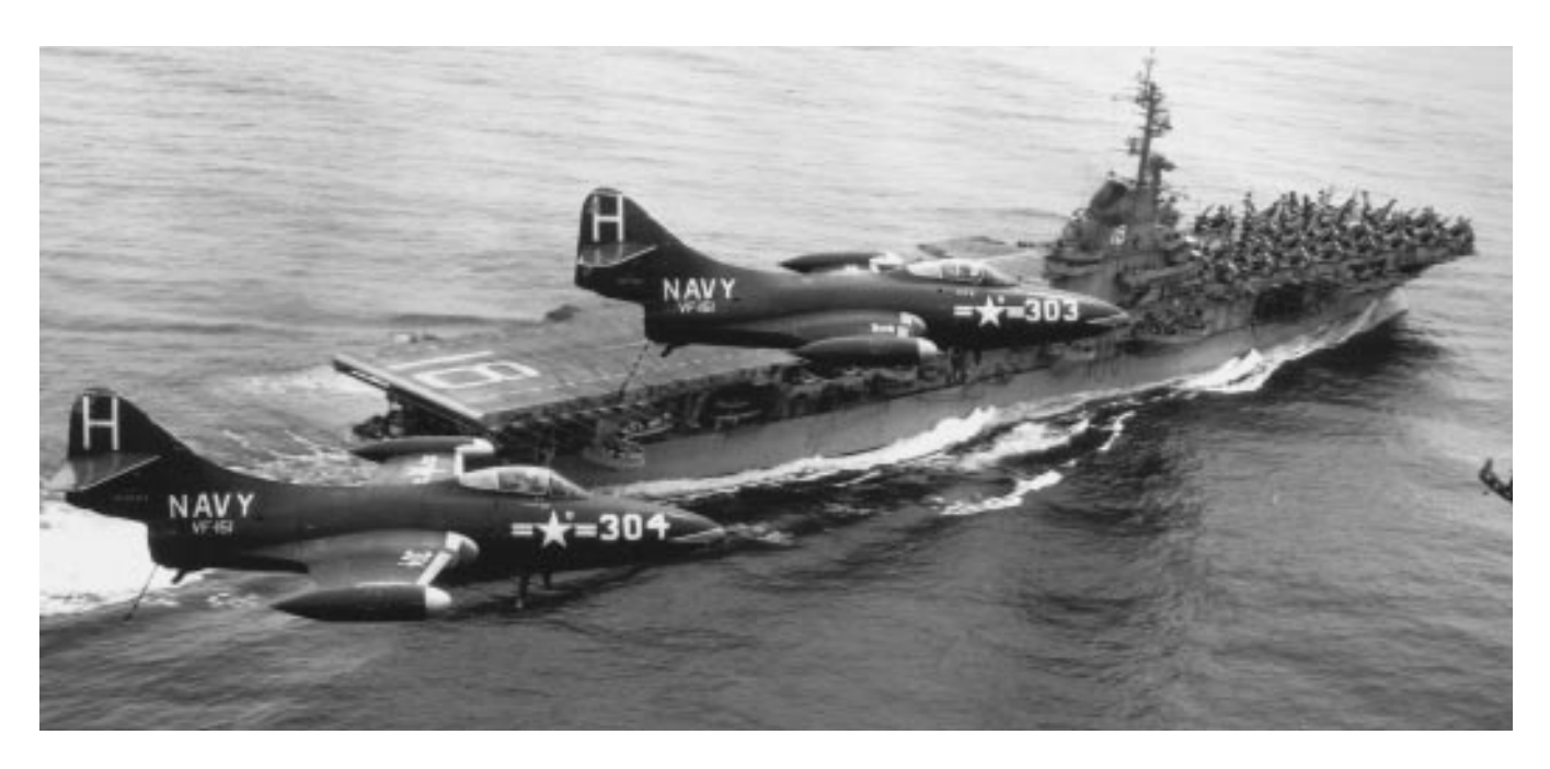
Two of the squadron's F9F-2 Panthers fly over Wasp (CVA 18) during her deployment to the western Pacific between September 1954 and April 1955.

\ddagger The squaron received the F4U-4B sometime between June and August 1951.