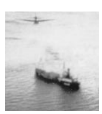
Squadron TBFs attack a German coaster off the coast of Norway in October 1943.

4 Oct 1943: The squadron participated in Operation Leader and struck at shipping targets around Kunna