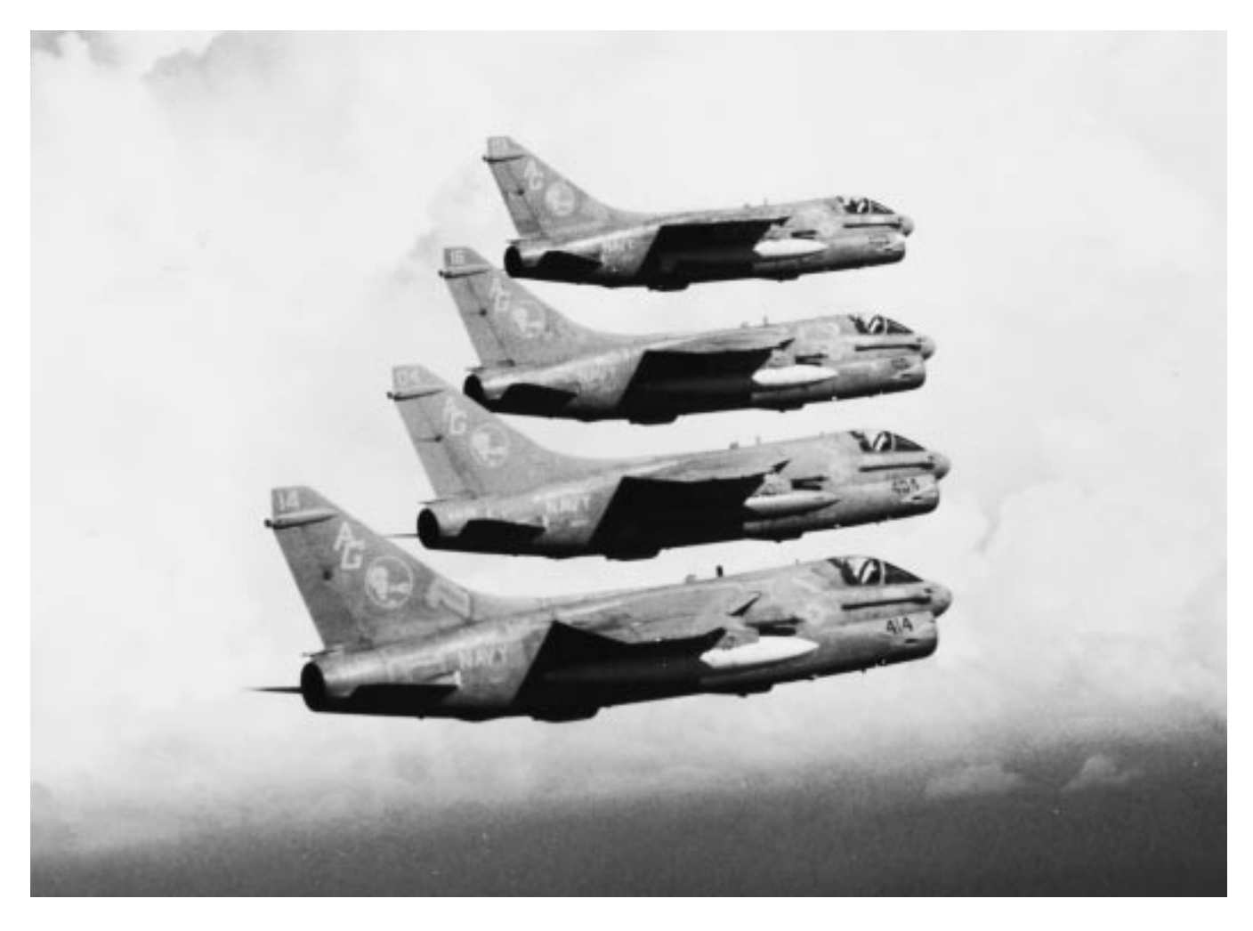
A flight of squadron A-7E Corsair IIs in their low-visibility paint scheme.