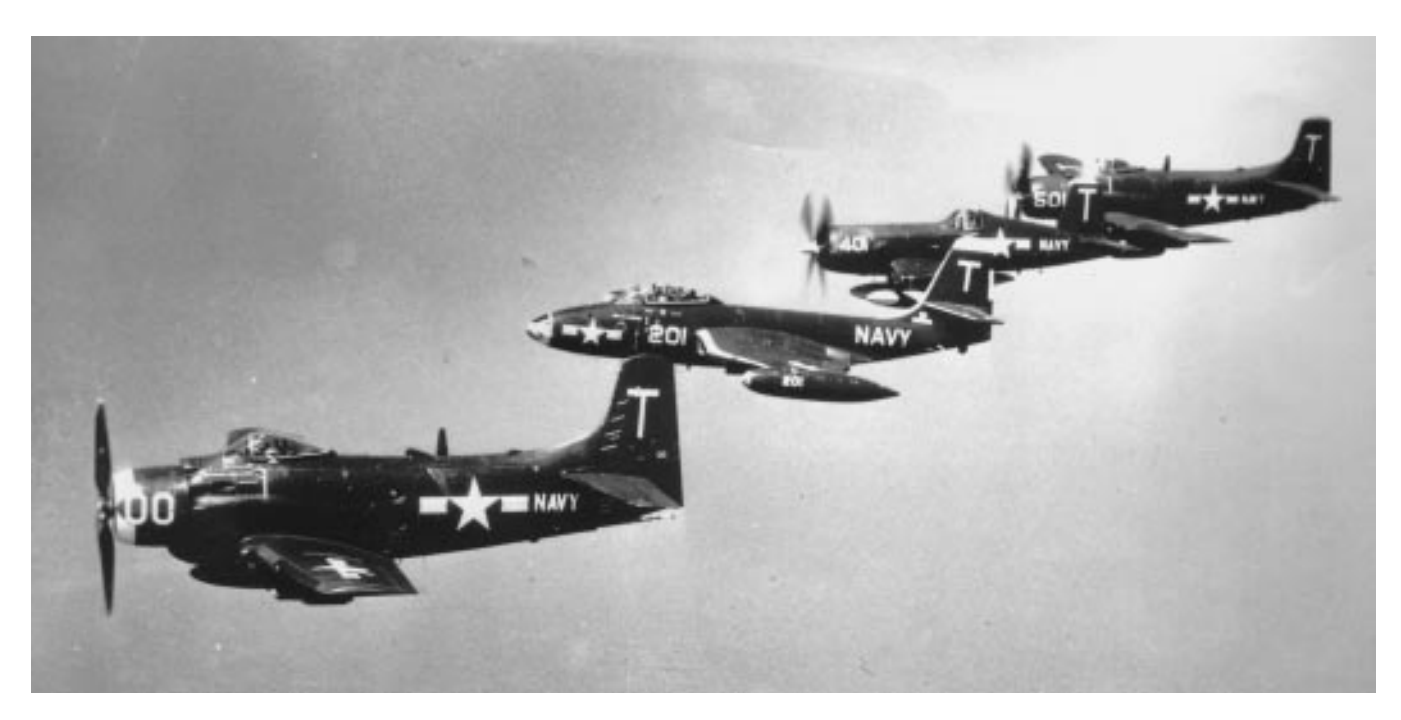
The squadron's F2H Banshee, second from left, in formation with other aircraft from Air Group 1.