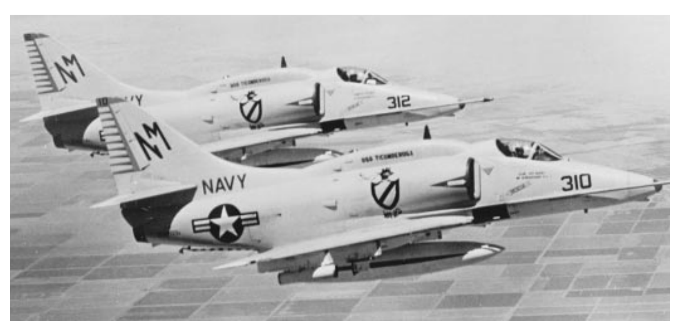
Two of the squadron's A-4F Skybawks fly a training mission over the Imperial Valley of southern California in 1967.