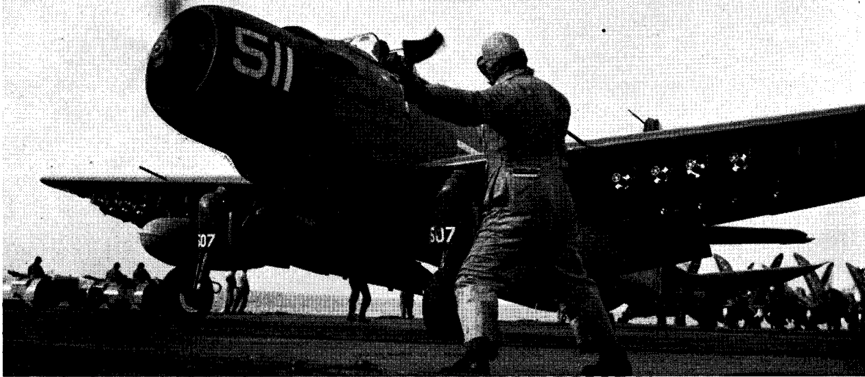
Carrying a full ordnance load of bombs and napalm, a Navy Douglas Skyraider sets out for Korean front

and provides a possible set-up for a countering run. Therefore, almost all runs will wind up in a tail chase with the MIG opening range fast.