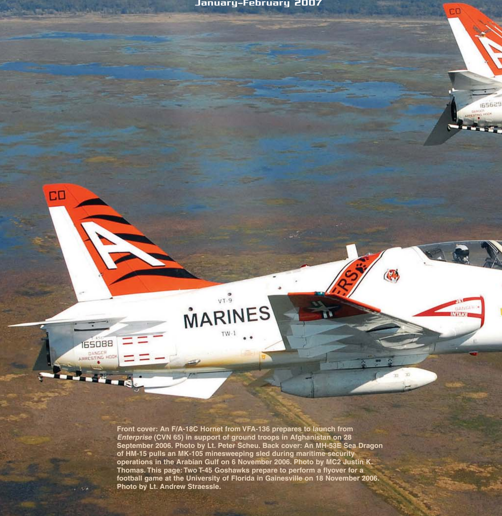
Front cover: An F/A-18C Hornet from VFA-136 prepares to launch from Enterprise (CVN 65) in support of ground troops in Afghanistan on 28 September 2006. Back cover: An MH-53E Sea Dragon of HM-15 pulls an MK-105 minesweeping sled during maritime security operations in the Arabian Gulf on 6 November 2006. This page: Two T-45 Goshawks prepare to perform a flyover for a football game at the University of Florida in Gainesville on 18 November 2006.