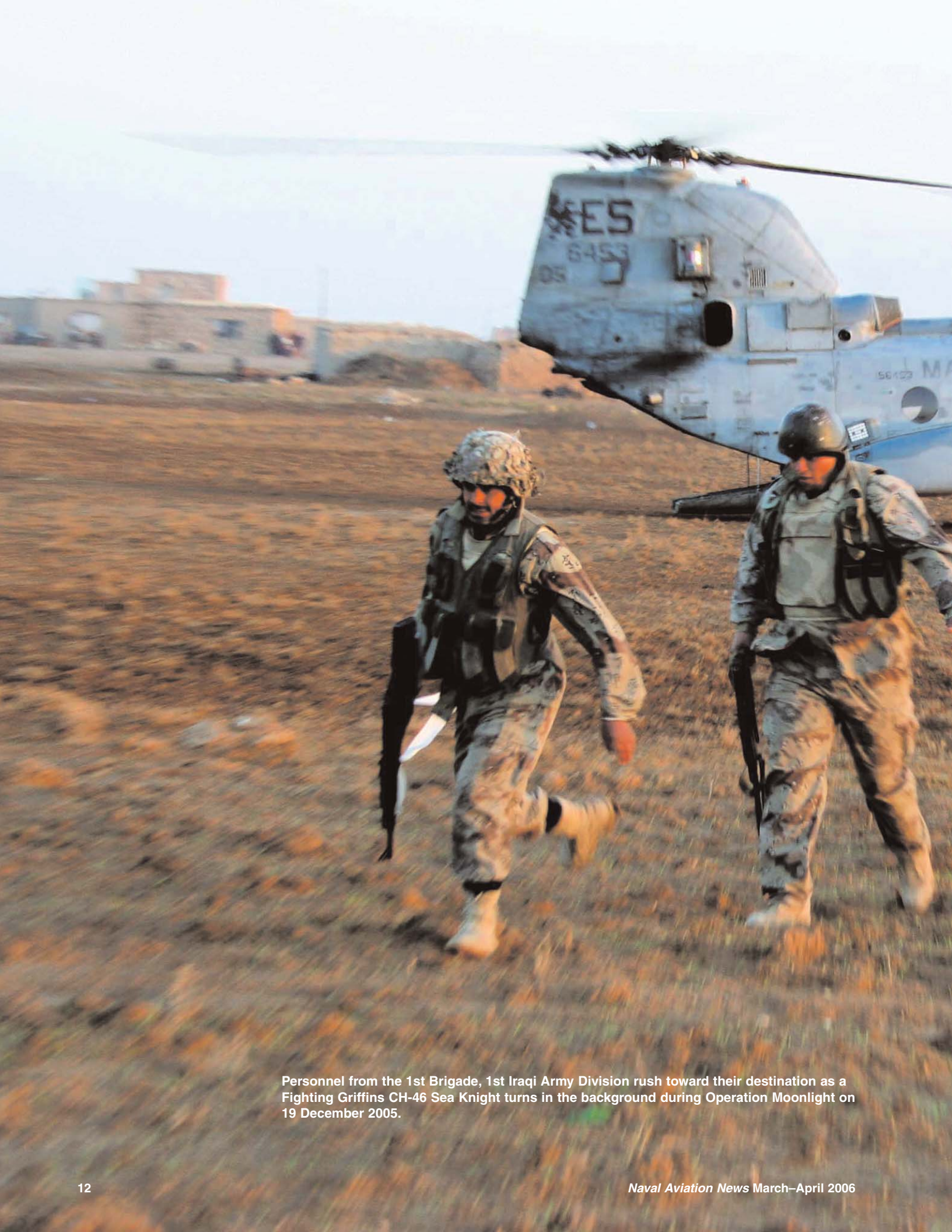
Personnel from the 1st Brigade, 1st Iraqi Army Division rush toward their destination as a Fighting Griffins CH-46 Sea Knight turns in the background during Operation Moonlight on 19 December 2005.