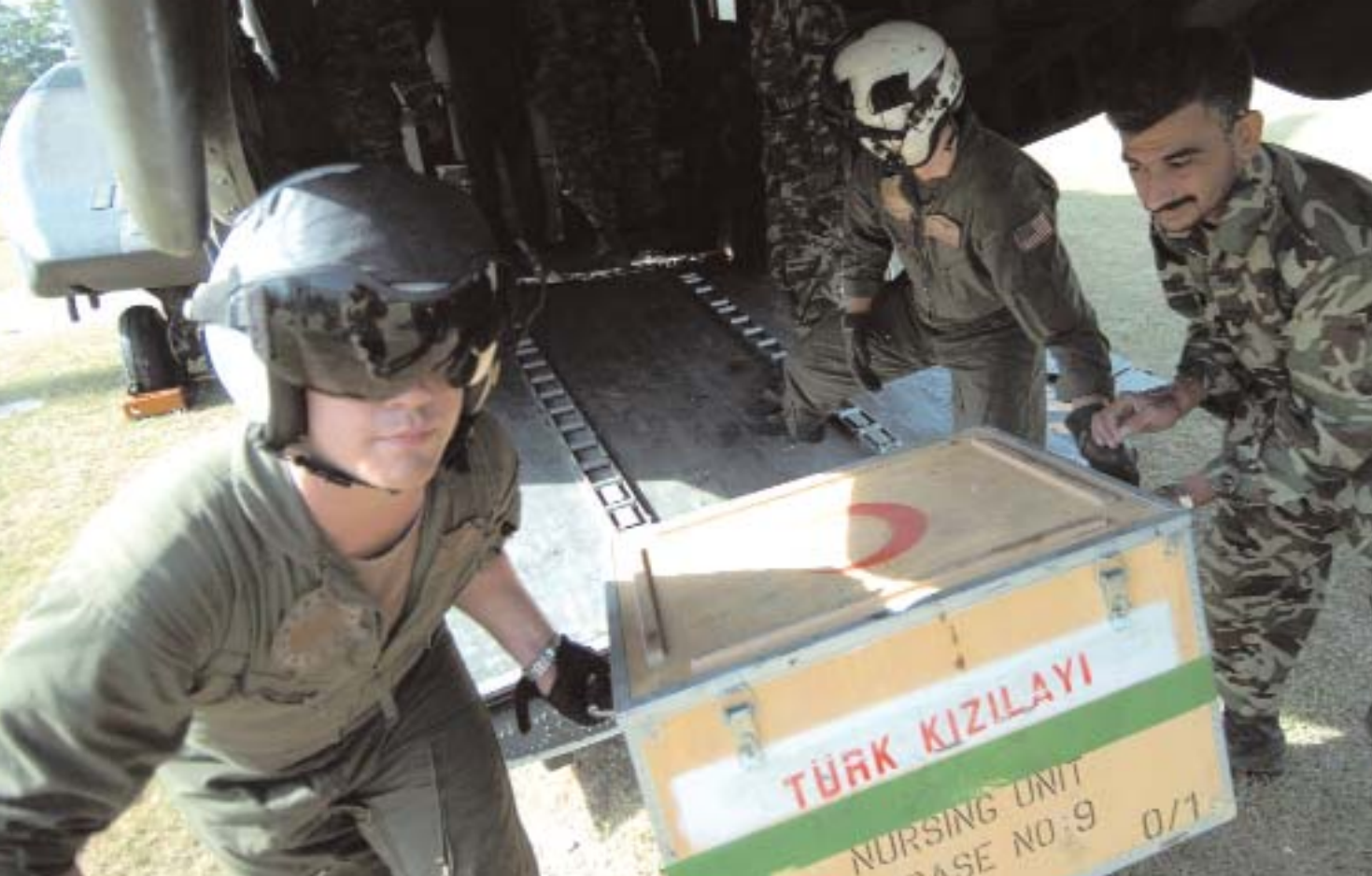
Above, an HM-15 aircrewman and a Pakistani soldier unload medical supplies from a squadron MH-53E Sea Dragon. Two helos from the squadron's Bahrain detachment made the 3-day flight to northern Pakistan to assist in the relief efforts. Right, an HSC-26 MH-60 Seahawk, Army CH-47 Chinook, and a Pakistani Mi-17 on the ramp at Chaklala Airfield reflect the joint nature of the relief effort. Below, VR-64 flew numerous missions delivering supplies to Pakistan in the C-130T Hercules.