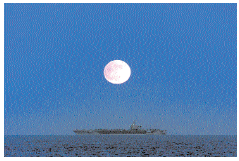
EW2 Christopher Ware photographed Carl Vinson (CVN 70) from the deck of Ingraham (FFG 61) during a full moon and calm seas on 20 November 2002.