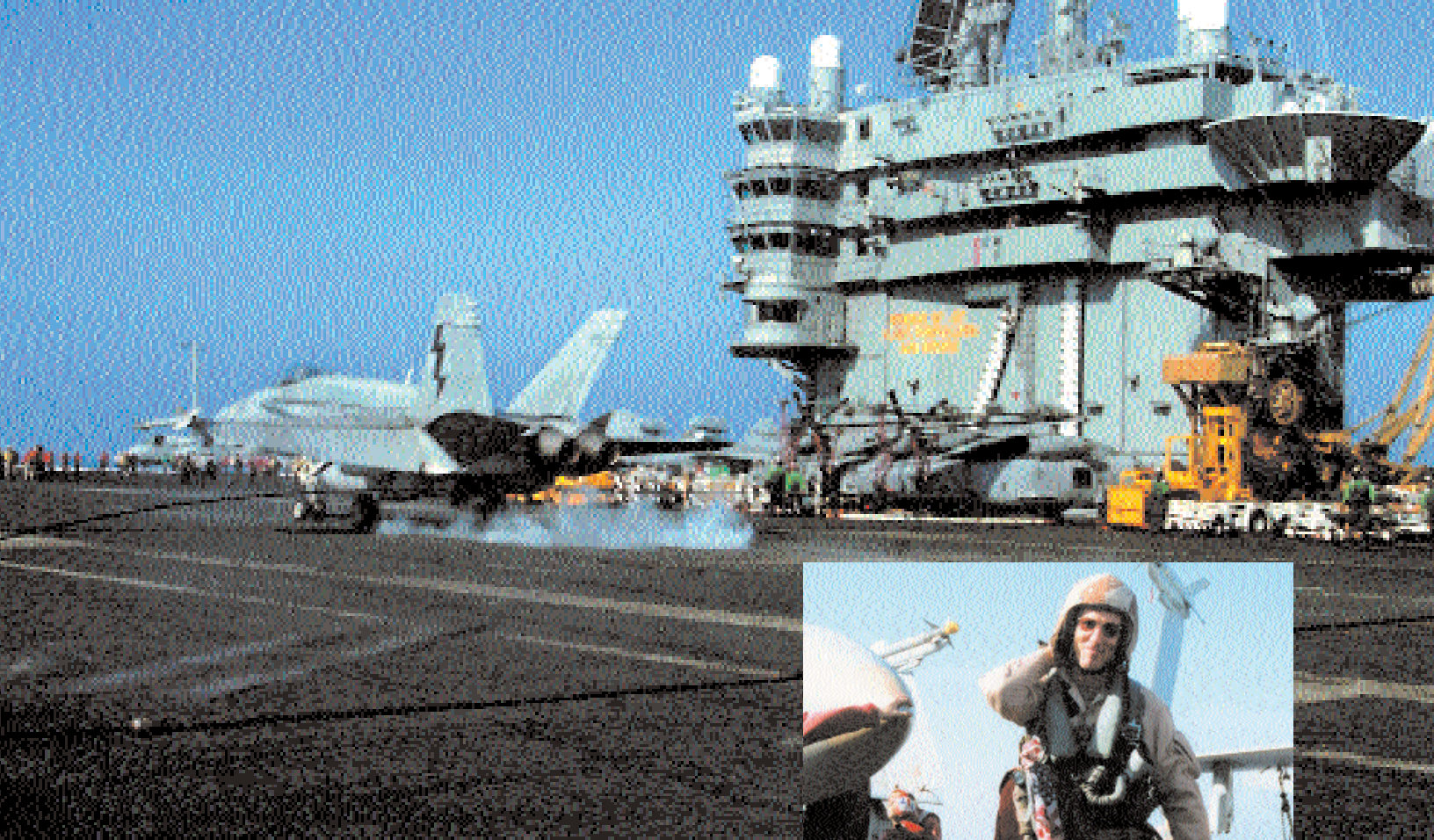
Right, Capt. Jeff Cathey, Deputy Commander CVW-1, surpassed 4,000 hours in an F/A-18 Hornet on 1 November 2001 while flying in support of Operation Enduring Freedom. Above, Capt. Cathey lands safely on the flight deck of Theodore Roosevelt (CVN 71) after his milestone flight.