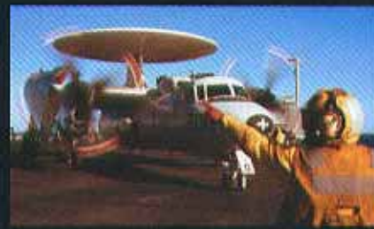
PH2 Jason Scarborough

In the war against terrorism, Naval Aviation forces are prepared to endure with steady aim, swift delivery and deadly impact until the mission is complete. ✈