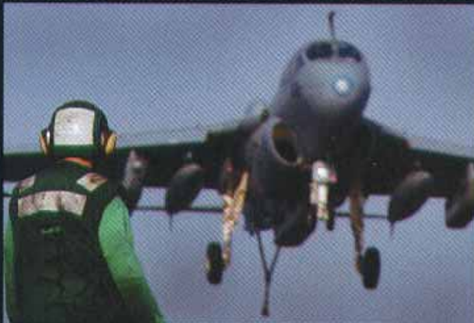
PH3 Saul Ingle