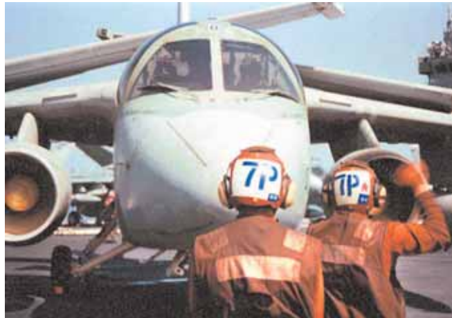
PH3 Keryll Caccho

One person was lost at sea during an attempted search and rescue hoist by a Helicopter Antisubmarine Squadron 14 HH-60H Seahawk in the Arabian Sea on 7 November.