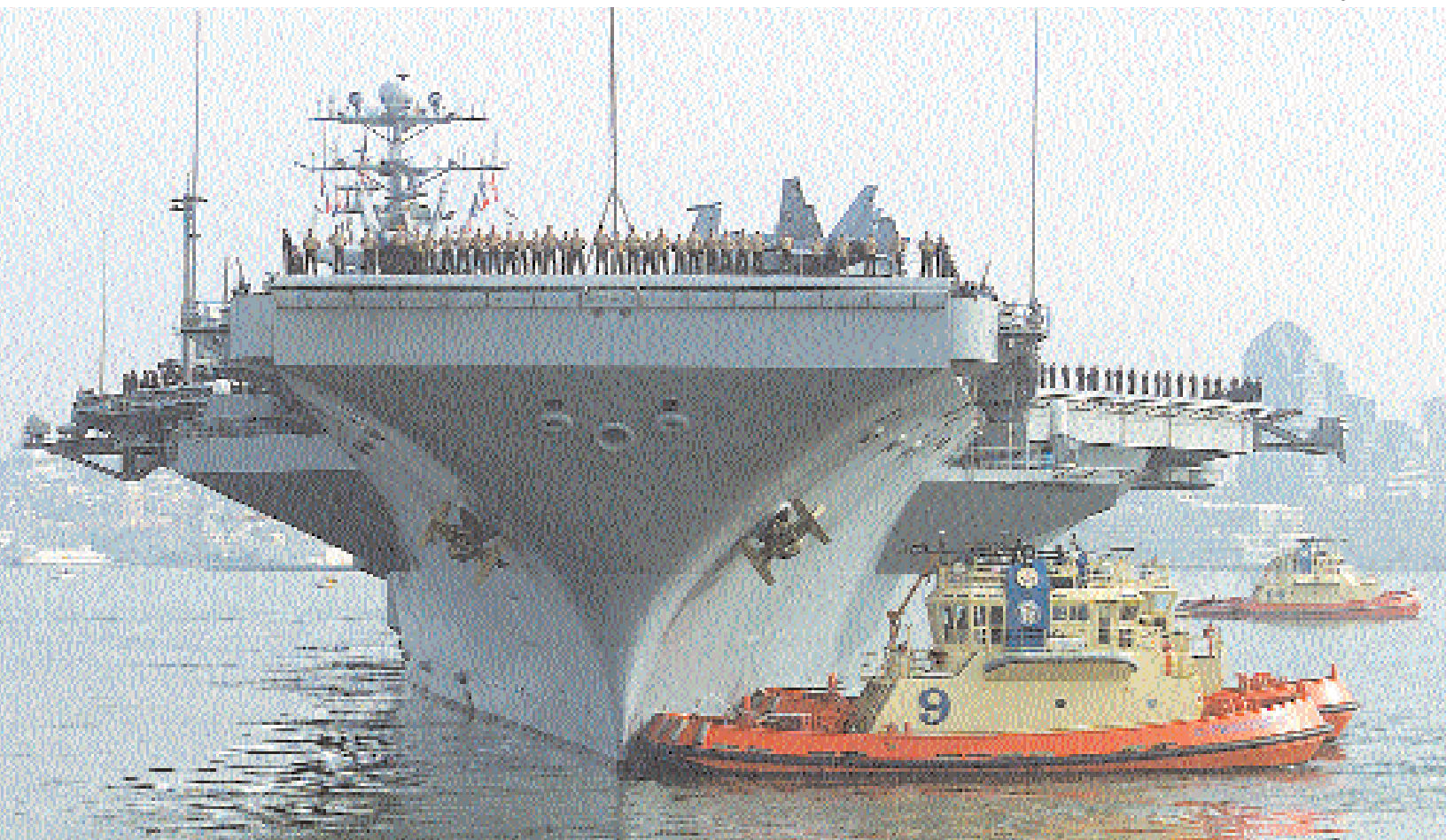
PH1 Chuck Cavanaugh