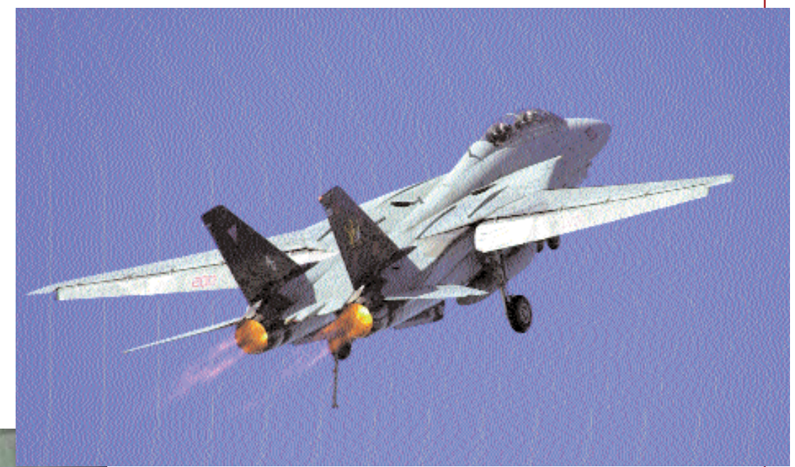
PHAN James Wagner

Fleet photographers captured these images as Dwight D. Eisenhower (CVN 69) conducted flight deck certification in the Atlantic Ocean in early November. Right, an F-14B Tomcat of Fighter Squadron 11 terminates a low, slow pass by the flight deck on 6 November. Below, Ike CO Capt. Mark McNally observes flight ops as ammunition is transferred to Enterprise (CVN 65) on 8 November.