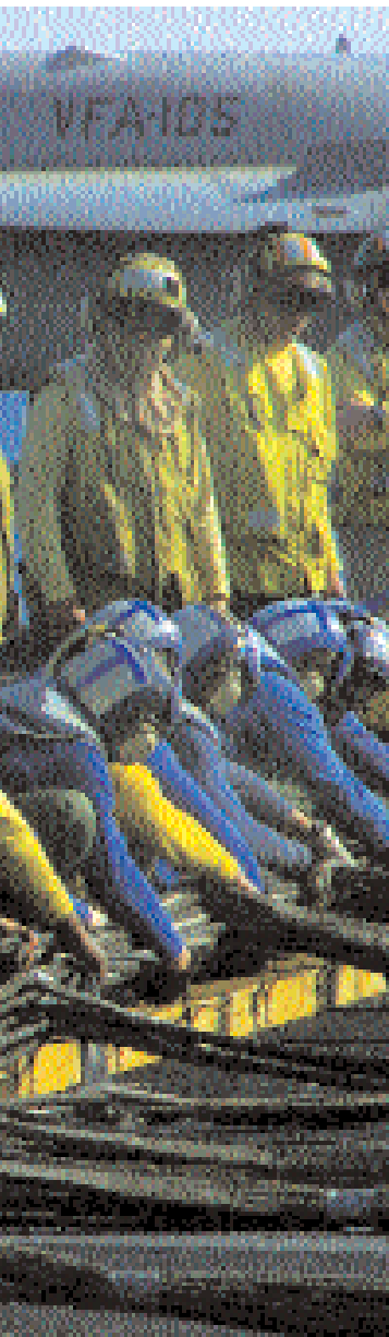
Sailors aboard Harry S. Truman (CVN 75) rig the emergency barricade during a flight deck drill while training in the Atlantic Ocean on 9 May.