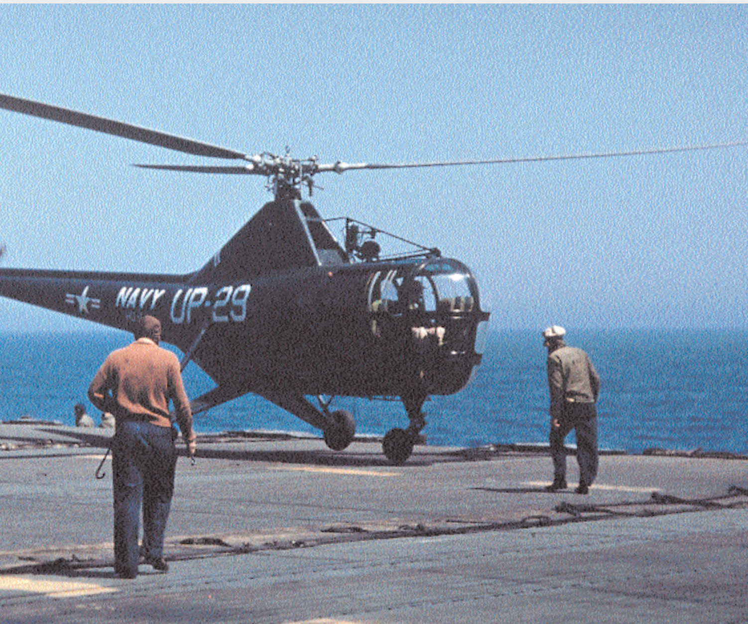
Above, the deck crew aboard Boxer (CV 21) prepares for an HO3S helicopter to land. These helos were among the first to conduct plane guard during carrier operations, and were instrumental in rescuing downed pilots in Korea. Right, Navy long-range patrol aircraft like this P4Y-2 Privateer flew a wide variety of missions, most notably flare drops over North Korean mountains to assist night intruder missions flown by Marine and Air Force planes.