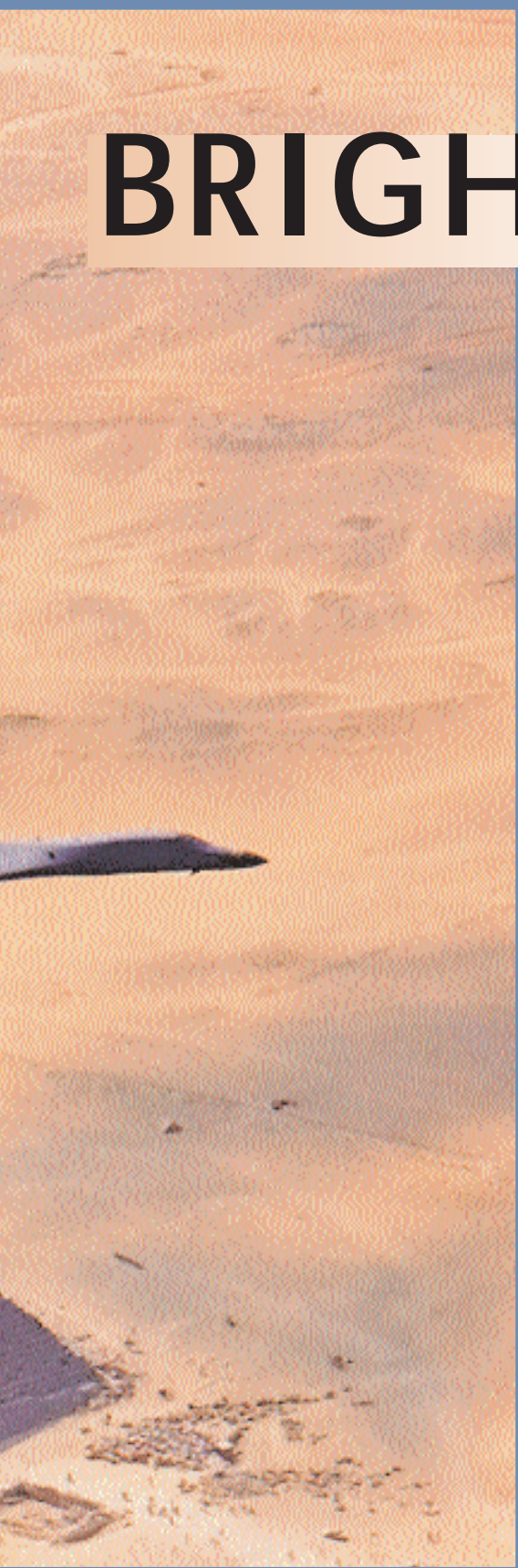
SSgt. Jim Vazmegyi

Left, this formation flying over the pyramids of Cairo illustrates some of the variety of aircraft participating in Bright Star 00 from Egypt, France, Greece, Italy, the Netherlands and the U.S. Counterclockwise from top: MiG-21, two F/A-18s, F-14, Mirage 2000, F-4, F-16, AMX, Mirage 5, Alpha Jet, F/A-18, F-16 and B-1. Below, some of the deployed Marines got into the Egyptian spirit by building a Sphinx sand sculpture.