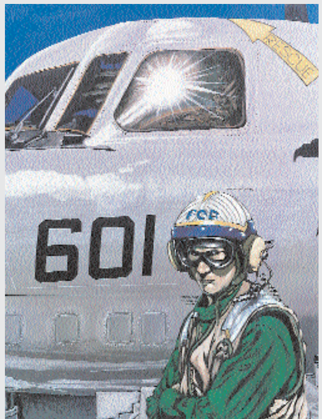
Left, in “Defenders of Freedom, Past and Present” the battleship Missouri (BB 63) represents days gone by while Kitty Hawk (CV 63) is part of today’s fleet. Above, “The FOD Man’s Scowl” captures a “green shirt’s” all-business demeanor as he stands beside an E-2C Hawkeye . Below, “Dawn” arrives aboard a carrier as flight deck personnel get ready for the day’s operations. Rendered in acrylic on illustration board, all paintings are part of the Navy Art Collection.