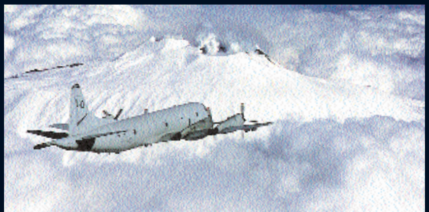
PHAN Alesha Stanaitis caught a VP-10 P-3 Orion flying over Mt. Aetna, Sicily.