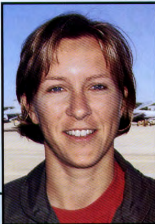
101