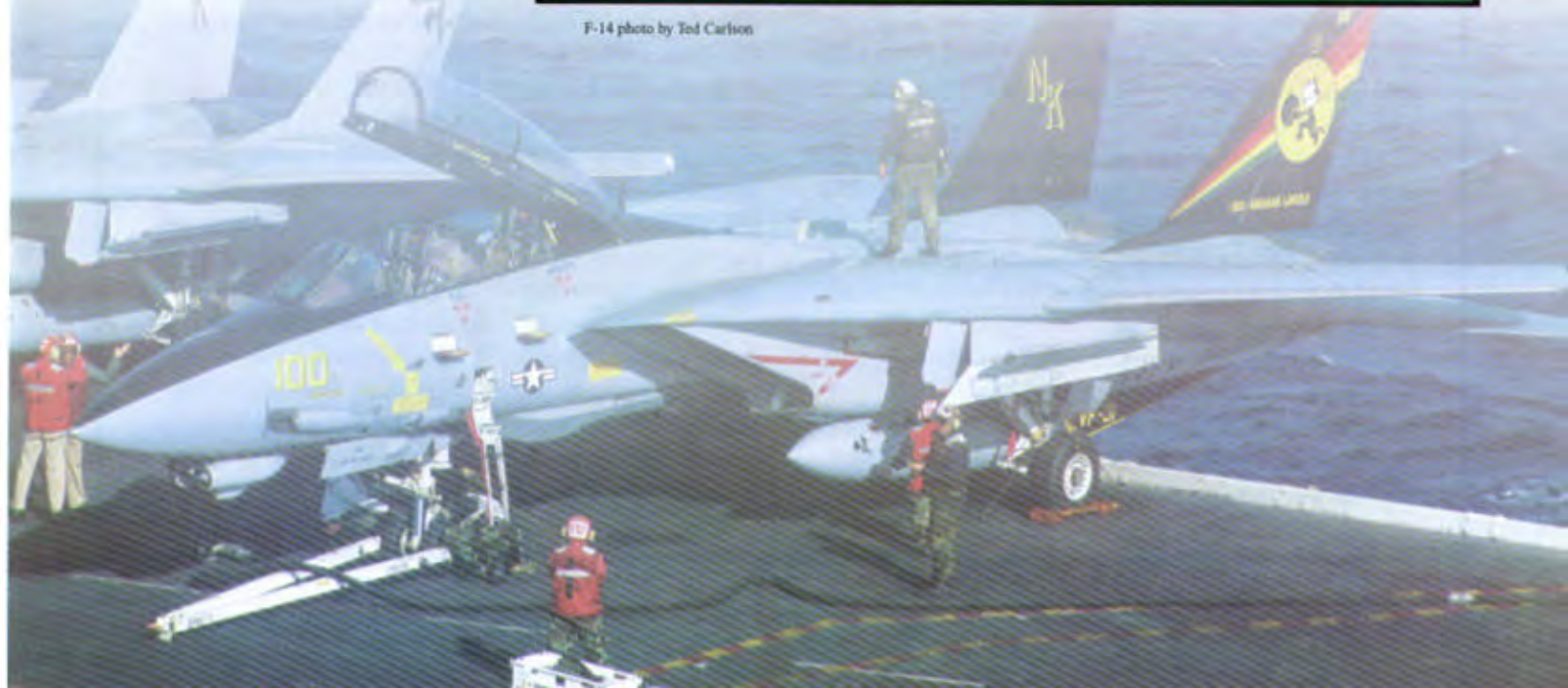
F-14

The Navy "has really helped me personally and professionally. You earn pride in what you're doing, some ownership in the military and the knowledge that you're part of a family. There's no job that's going to be 100-percent satisfying every day, but there have been a lot more 100-percent days than 50-percent days. It has exceeded every expectation."