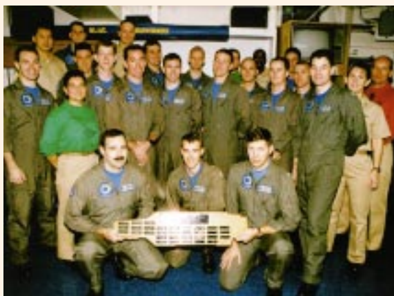
The Blue Diamonds of VFA-196 won their 13th consecutive CVW-9 Top Hook award while on board Nimitz (CVN 68). The Top Hook is awarded for ball-flying excellence as seen by the LSOs during a specific line period.

Cdr. George W. Hoover, USN (Ret.) , a space program pioneer and the innovator of numerous avionics devices, died on 12 March at age 82. A combat-tested fixed- and rotary-wing pilot with more than 5,000 flight hours in 100 aircraft types, he devoted a lifetime to making the cockpit a more efficient control center. He was instrumental in the