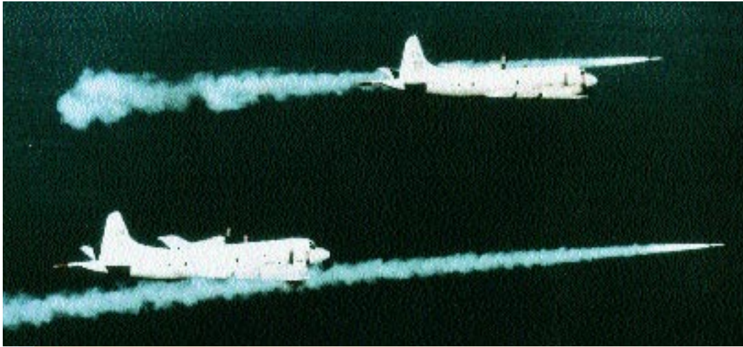
Two P-3C Orions from VP-45, NAS Jacksonville, Fla., fire Zuni rockets off the coast of Puerto Rico.

tions. The exercises involved a search and rescue operation and air-to-air training.