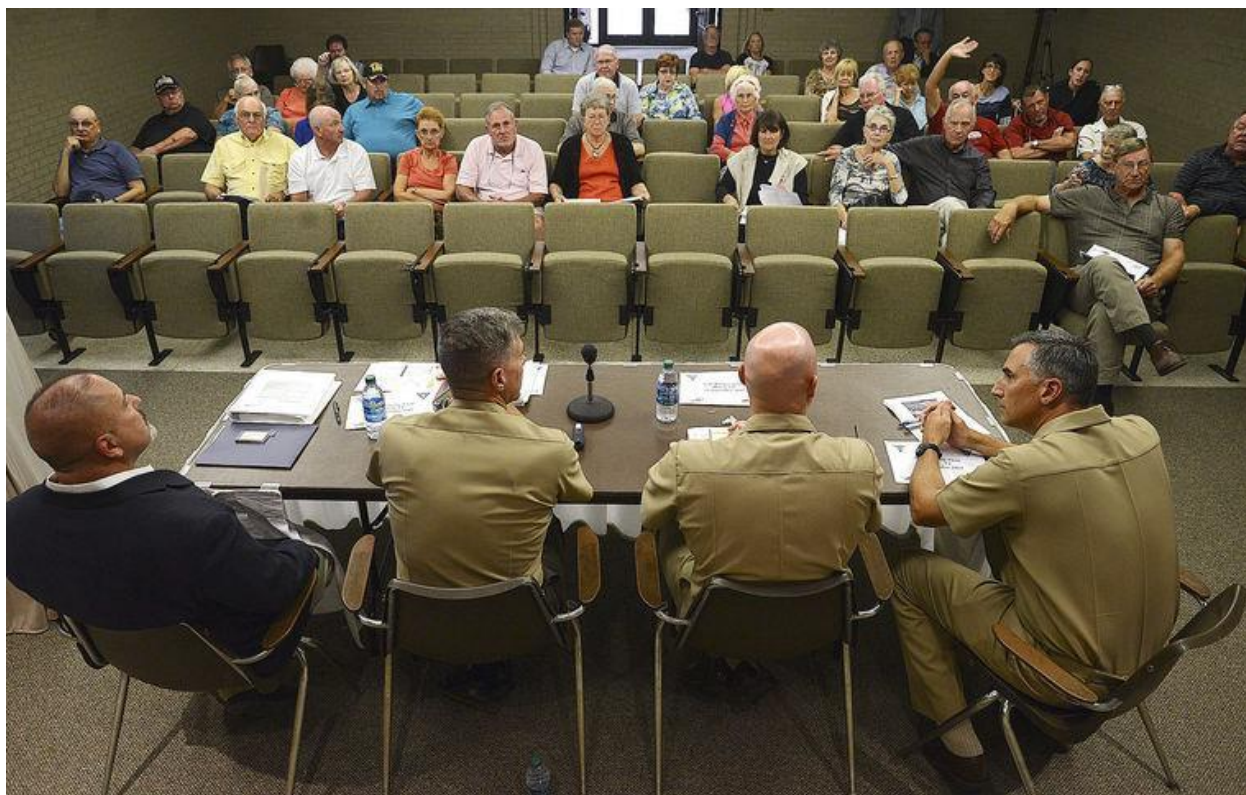
NAS Whiting Field and Training Air Wing FIVE continue to model “Good Neighbor” policies across the local area! Above, NAS Whiting Field and TRAWING-5 meet with citizens to encourage and participate in dialogue to address noise concerns and military flight activities.