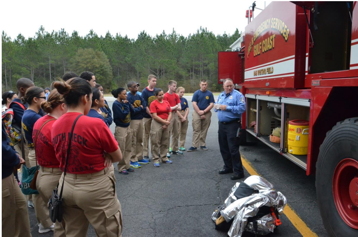
NAS Whiting Field continues to be a model in Community Outreach! The installation provided more than 30 tours for more than 700 visitors in 2015. Here, Junior Reserve Officer Training Corps (JROTC) students participate in a tour of the base fire department.