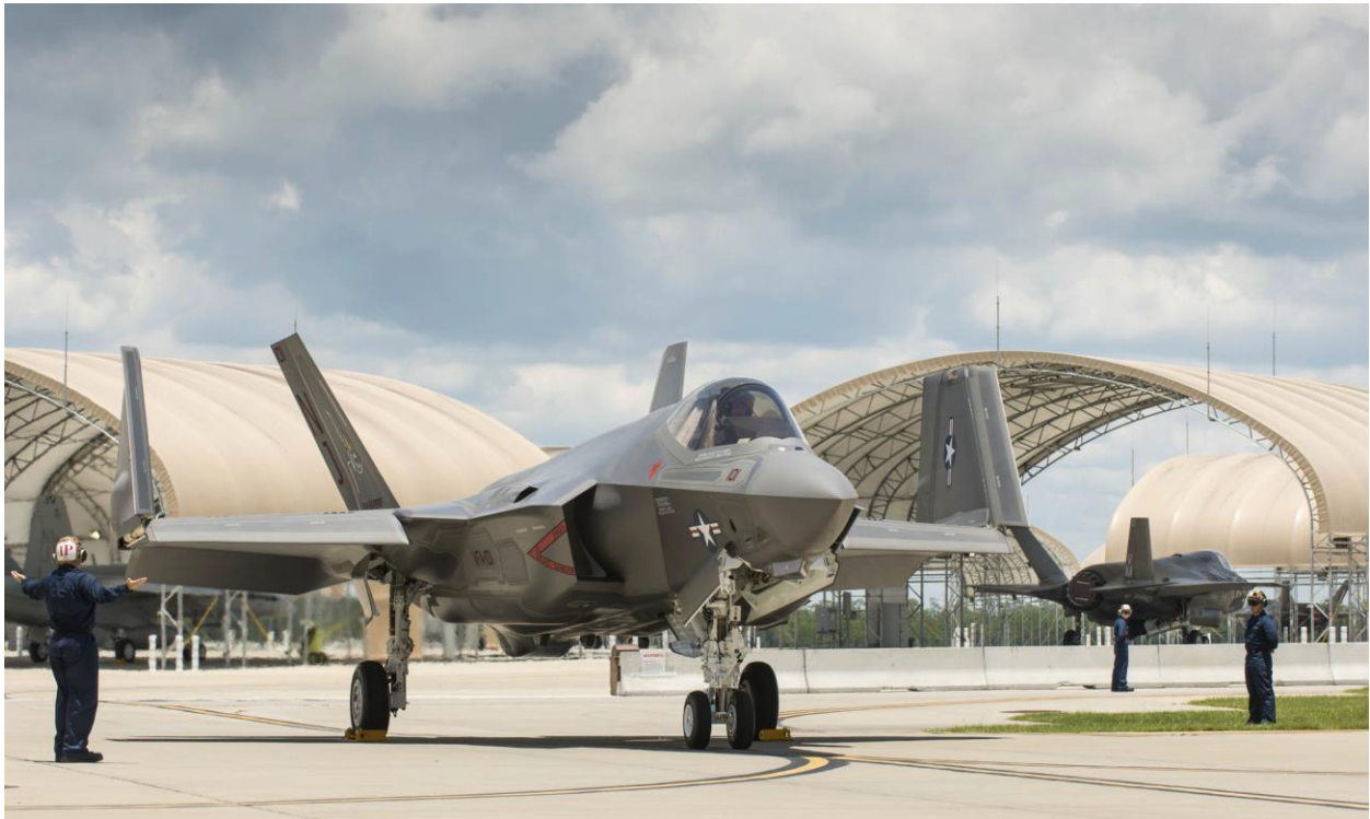
A Navy VFA-101 F-35 prepares to taxi out for flight operations. NAS Whiting Field provides operational support onboard Eglin Air Force Base and Navy Outlying Landing Field Choctaw is integral in next generation warfighter training.