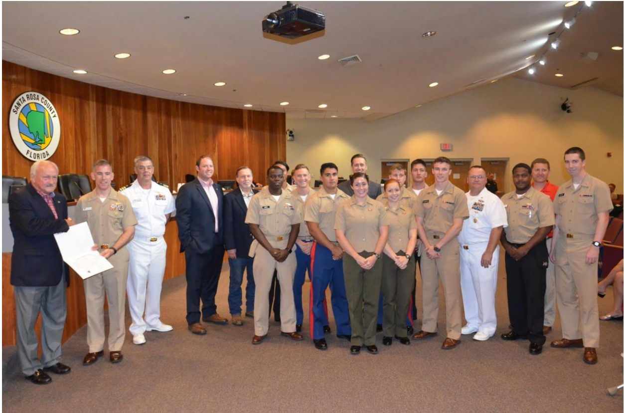
Members of the NAS Whiting Field team attend the May 11 Santa Rosa County Board meeting where the County Commissioners signed a proclamation declaring the month of May through 14 June as “Military Appreciation Month” in the county.