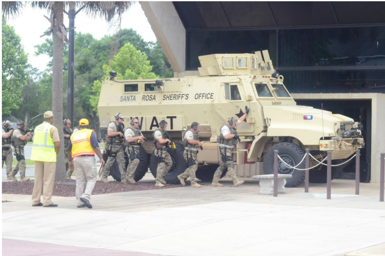
NAS Whiting Field participates in an Anti-terrorism Force Protection “Active Shooter” exercise with SWAT, NCIS, Security and local law enforcement agencies during Higher Headquarters Operational Assessment, May 2015.