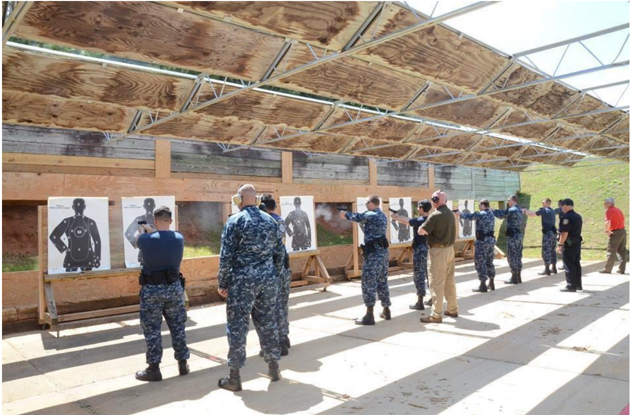
The NAS Whiting Field Security Department plays a major role in the qualification of 1,093 military and civilian personnel including NCIS, SWAT and local law enforcement entities.