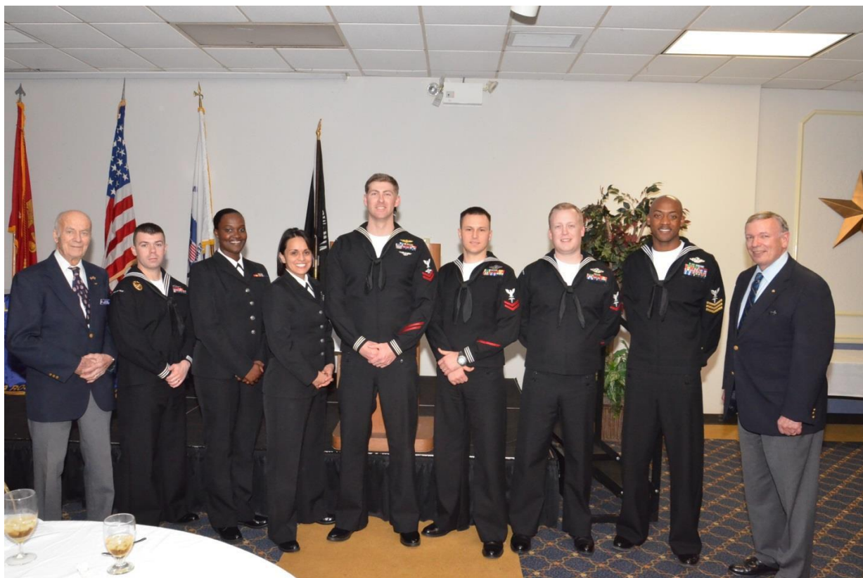
The Navy League Council show their appreciation for the men and women of NAS Whiting Field with their annual awards banquet recognizing Sailors and flight instructors of the year.