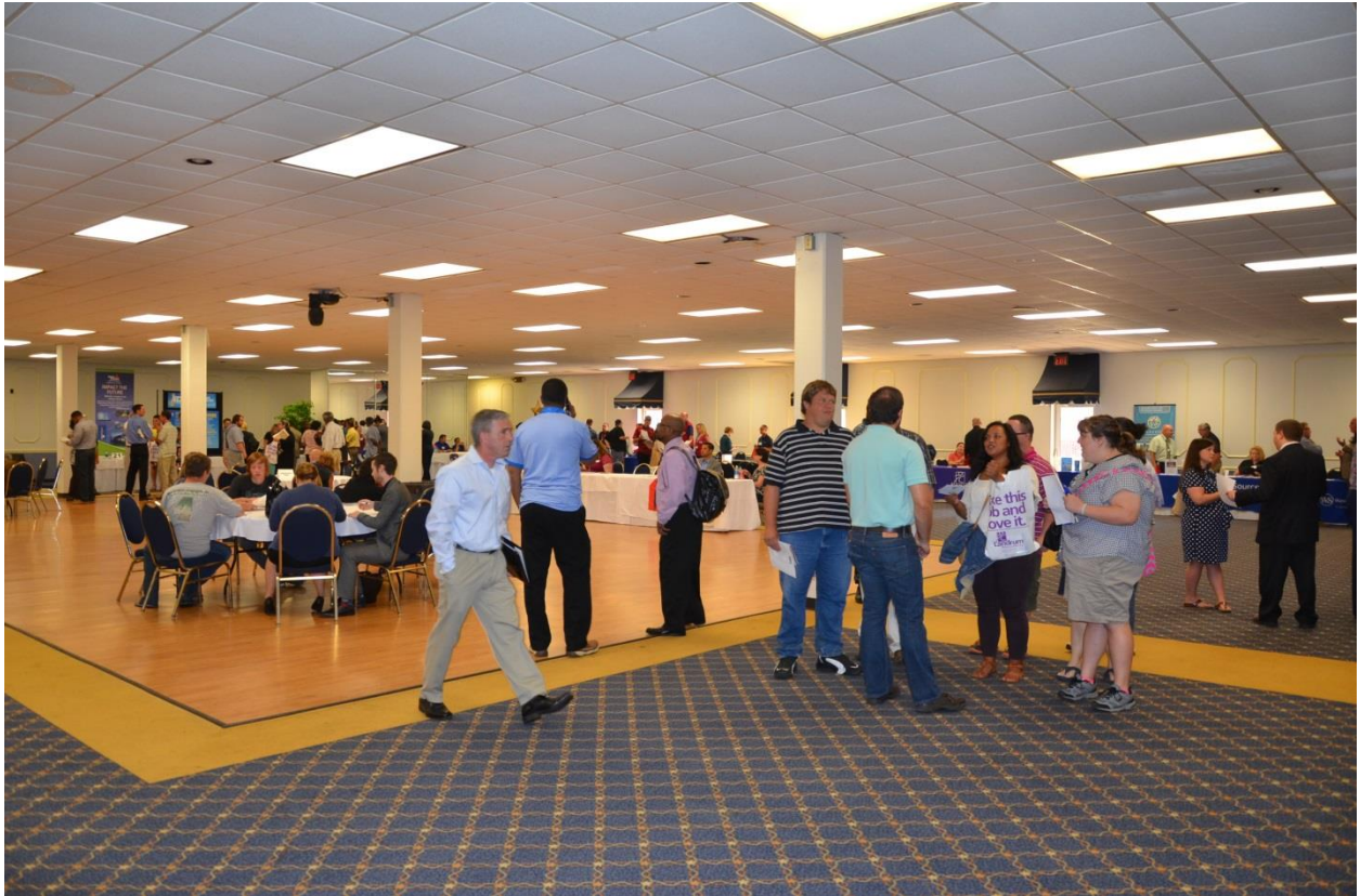
The Fleet and Family Support Center (FFSC) at NAS Whiting Field hosts its 26 th annual Job Fair in the installation's Sikes Hall. The event hosted 45 employers and nearly 700 job seekers, and is NAS Whiting Field's largest single community relations project.