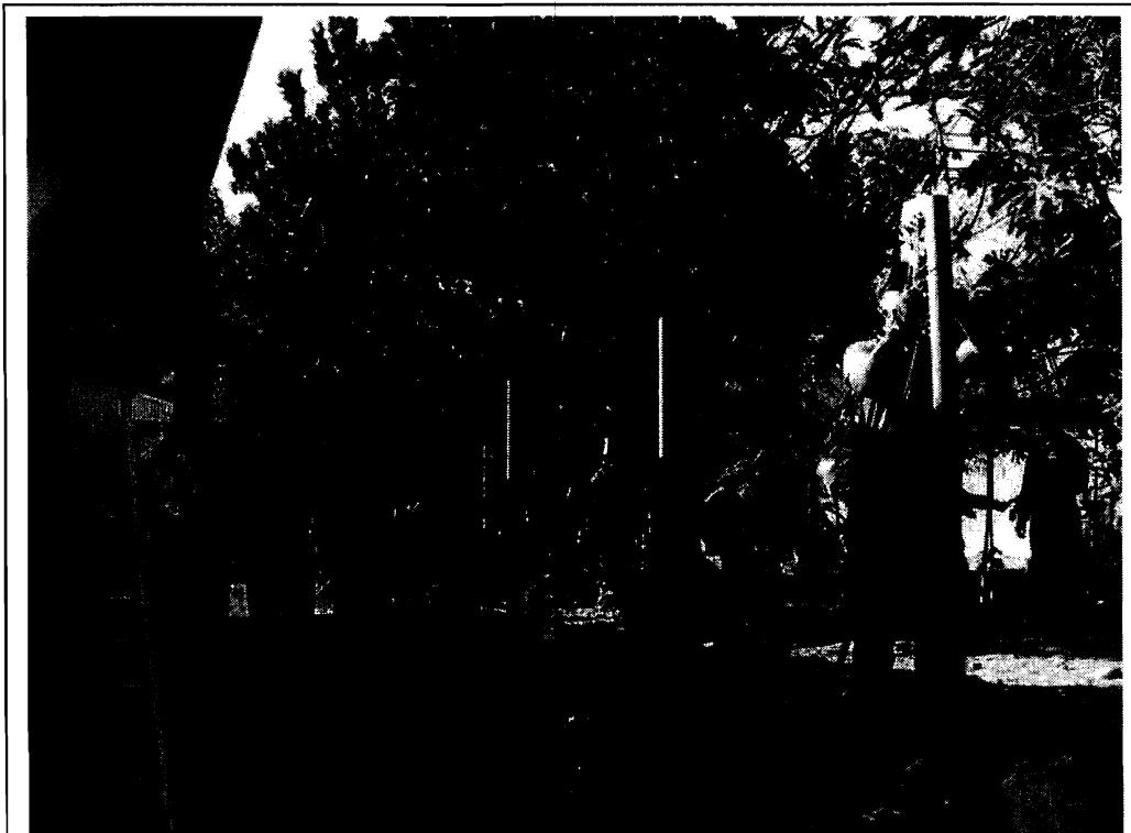
Australian volunteers from Force Logistics Squadron, Seabees from NMCB 5 and CHOSIN volunteers hard at work at the Ryder-Cheshire Foundation project site.

with an awning where residents wash dishes and do their laundry. "This is such a wonderful gift to the residents because prior to the concrete floor, they did their dishes and laundry on the dirt which eventually turned to mud", remarked Ann Mills, an Australian staff volunteer. In addition to the extension, the international crew of volunteers used the excess cement to construct concrete platforms for the water tank and water pump, as well as build an access ramp to the recreation room in order for residents in wheelchairs to have easy access to it. The three CHOSIN volunteers will work on the project for the duration of the port visit.