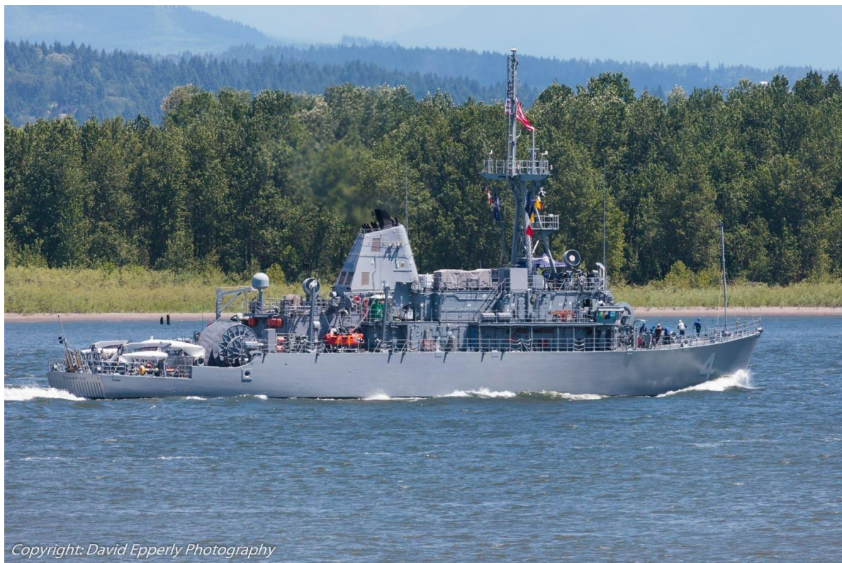
USS CHAMPION MCM-4 (JUN15)