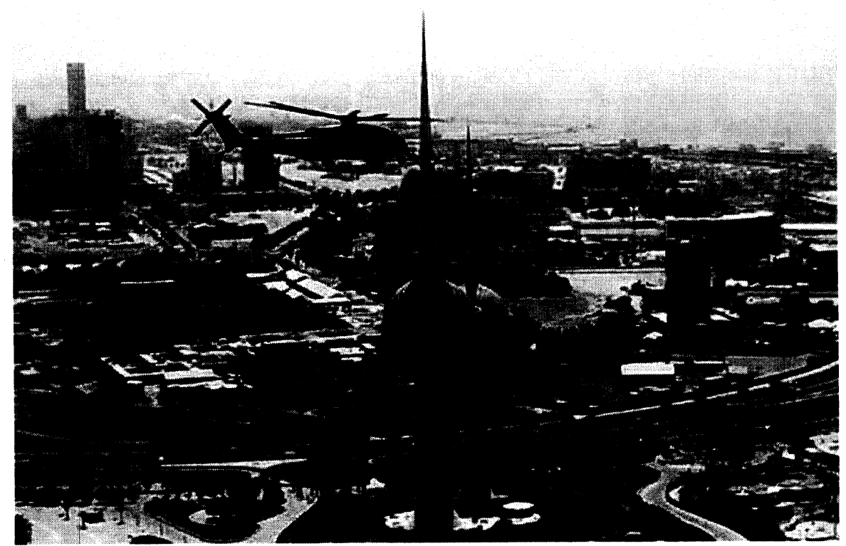
A HM-15 MH-53E Helicopter over Kuwait City.

The superb results and four-star accolades received by both detachments, were a tribute to the work ethic and dedication of the HM-15 Blackhawk aircrews and both aircraft and MCM maintenance professionals. As a direct reflection of HM-15's accomplishments, COMINEWARCOM and COMNAVAIRLANT selected HM-15 to remain in Bahrain as the permanent forward deployed MH-53E AMCM and heavy-lift VOD capability in the Fifth Fleet AOR.