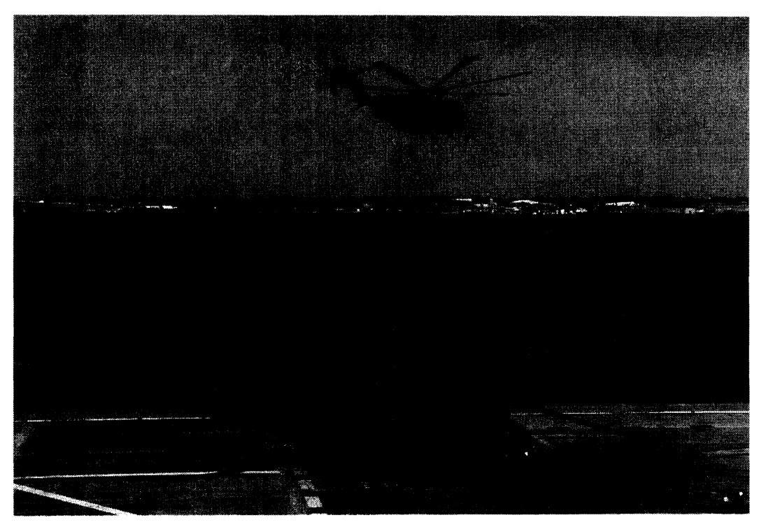
Two HM-15 MH-53E supporting Gomex 04-1 AMCM operations from Coastal Systems Stations Panama City, FL.

The Blackhawks are proud of their performance and participation in the highly successful GOMEX 04-1 Fleet exercise. The ability of HM-15 to rapidly detect and counter all threat exercise mines during the exercise reinforced the importance of maintaining a robust dedicated AMCM capability to meet he current global mine threat.