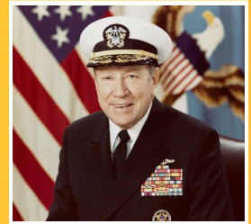
William J. Crowe Admiral

Born in Owensboro, KY, Morton graduated from the Naval Academy in 1930. He commanded the submarine USS Wahoo (SS 238) during World War II and was responsible for sinking 19 ships totaling 55,000 tons. Morton and his submarine were known as "The One-Boat Wolf Pack." In 1943, Wahoo was attacked by Japanese antisubmarine forces and sank off the coast of Japan. Morton received the Navy Cross, three gold stars, and the Army Distinguished Service Cross.