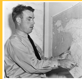
Dudley W. Morton Commander

Born near Lexington, KY, Jouett commanded several ships during the Civil War and was severely injured during hand-to-hand combat with a Confederate commander. After the war, he commanded the North Atlantic Squadron and led the ships that forced the opening of the Isthmus of Panama. Jouett retired in 1890 and a special act of Congress granted him full pay for the remainder of his life due to his excellent service.