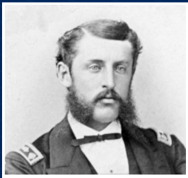
Charles Vernon Gridley Captain

Born in Logansport, IN, Gridley served as captain of Olympia (Cruiser No.6). Leading Olympia during the Battle of Manila Bay on May 1, 1898, Gridley's ship played a pivotal role in assuring U.S. victory in the battle.