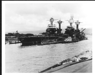
USS Tennessee (BB 43) alongside the sunken USS West Virginia (BB 48) during the Pearl Harbor Raid.