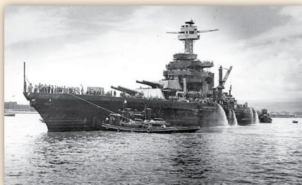
USS West Virginia (BB 48) Approaching drydock at Pearl Harbor Navy Yard June 8, 1942, just over six months after she was sunk in the Japanese air raid on Pearl Harbor.

1 Number of U.S. Navy Ships Sunk, Raised, Repaired...and Present at Tokyo Bay During Japan's Formal Surrender Sept. 2, 1945