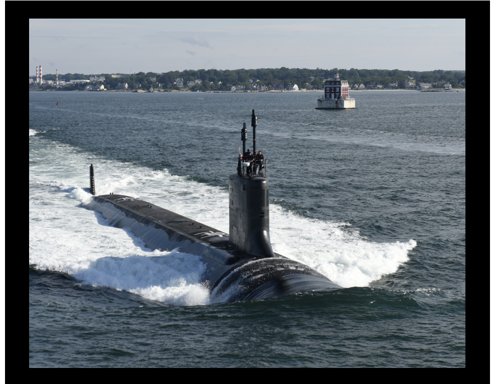
Photo of a Virginia-class attack submarine