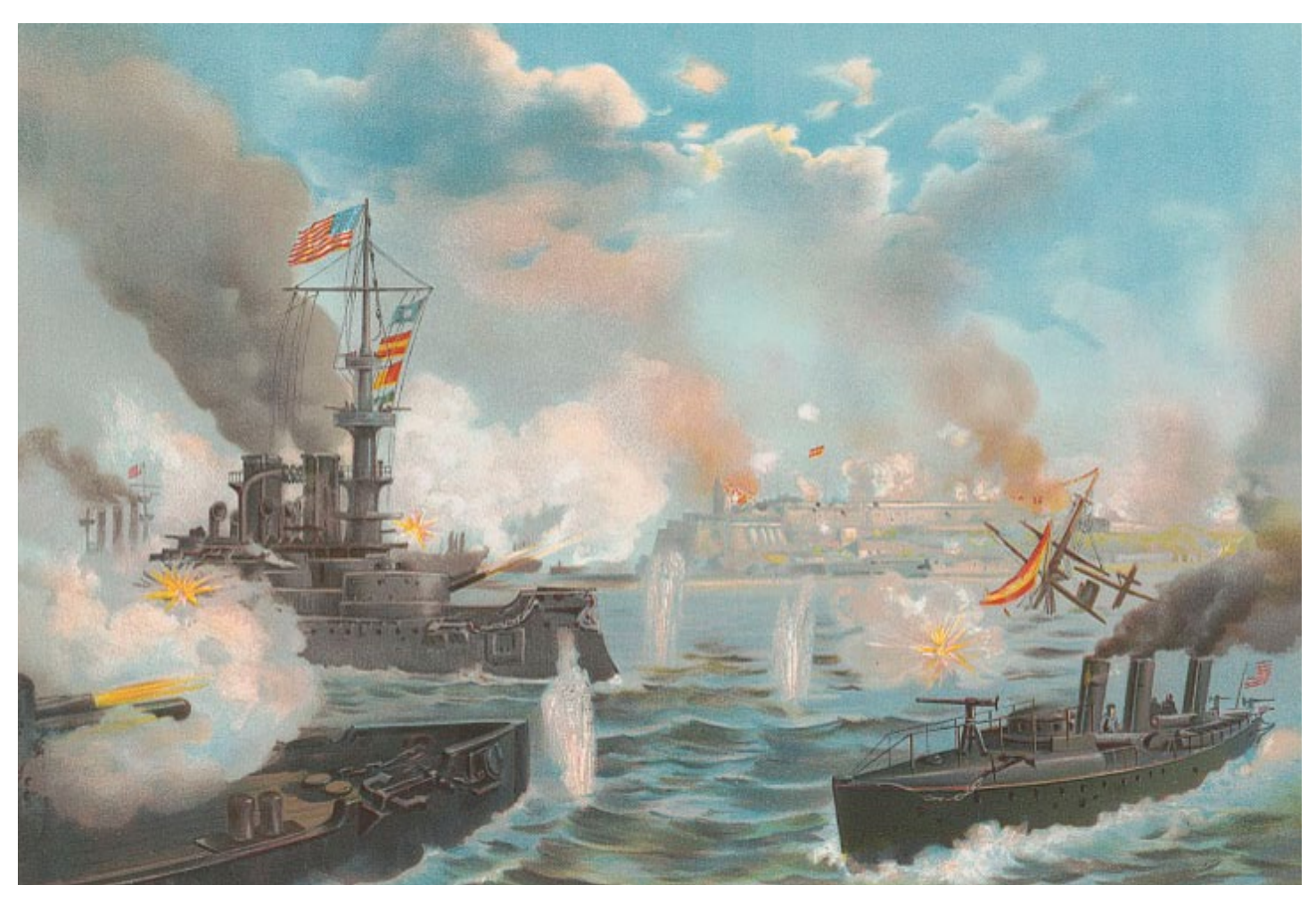
U.S. Navy ships bombard San Juan, Puerto Rico, on May 12, 1898