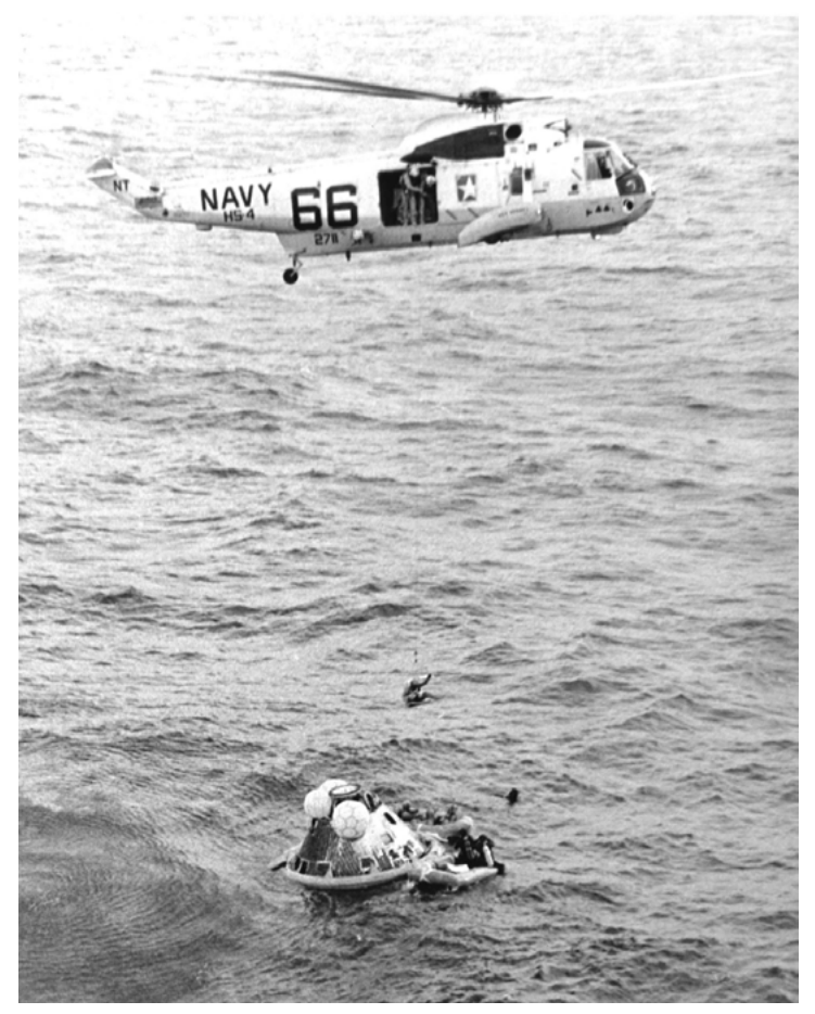
A helicopter from HS-4 picks up the astronauts from the Apollo 11 Command Module following splashdown on July 24, 1969.

Apollo II was the first lunar landing mission. Apollo II was launched on 16 July 1969. Task Force 130 participation in the Apollo II mission consisted of planning for and executing the location and retrieval of the astronauts and command module for a landing in the Pacific Command Area. Task Force 130 was ready in all respects to accomplish the mission. Forces assigned included USS Hornet (CVS-12), USS Goldsborough (DDG-20), Helicopter Antisubmarine Squadron Four (with eight SH-3D helicopters), Carrier Airborne Early Warning Squadron III Detachment 12 (with four E-IB aircraft), two C-IAs from Fleet Tactical Support Squadron Thirty, personnel from Underwater Demolition Teams Eleven and Twelve, Air Force HC-130s and pararescue teams assigned by 41st Aerospace Rescue and Recovery Wing, two US-2C aircraft from Fleet Composite Squadron One, and one WC-121 aircraft from Airborne Early Warning Squadron One. The Public Affairs Office supervised the embarkation of 118 civilians, including 70 newsmen and technicians, on the prime recovery ship, Hornet. In addition, the Public Affairs Office provided one officer and one enlisted representative aboard Hornet. Hornet deployed from Pearl Harbor to the abort station along the Mid-Pacific recovery line and then to the end-of-mission target point.<sup>1</sup>