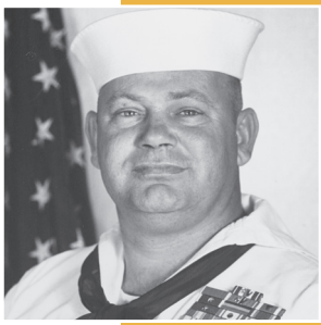
(Above) 1966-Boatswain's Mate First Class James Williams (Eastern Cherokee) earned the Medal of Honor during the Vietnam War. He was the Navy's most decorated Sailor.

courageous actions during the Vietnam War. In 2002, Naval aviator and test pilot Commander John Herrington (Chickasaw) served on the Space Shuttle and was the first Native American in outer space.