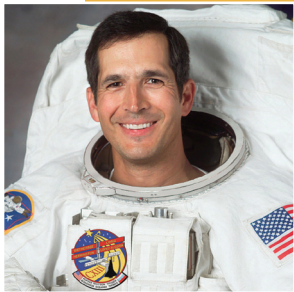
(Above) 2002-Naval aviator and Astronaut John Herrington (Chickasaw) served on the Space Shuttle and was the first Native American Astronaut.