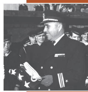
(Above) 1944-Lieutenant Commander Ernest Evans (Oklahoma Cherokee/Creek) served as commanding officer of the destroyer USS Johnston (DD-557) during the Battle of Samar. The Navy posthumously awarded him the Medal of Honor for his leadership during the battle in which he sacrificed his ship to save others.