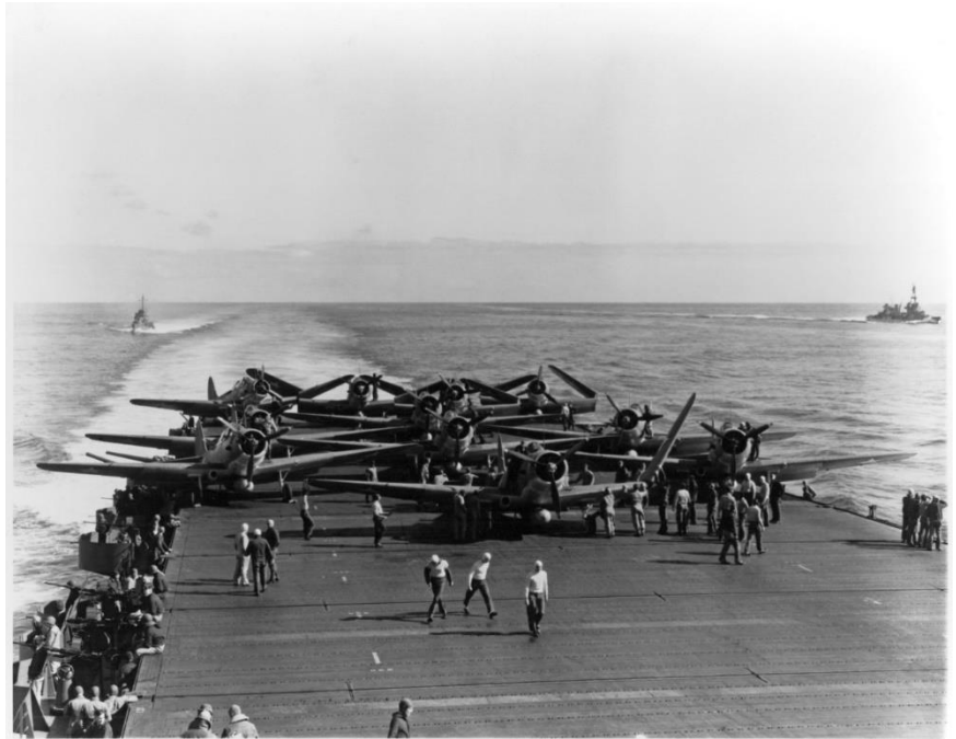
Naval aviators during the Battle of Midway, 4 June 1942

Not only did the American code breakers establish the location of the Japanese attack, they also figured out the planned locations of the Japanese fleet and the date and time they would attack. This allowed Navy leadership to plan for the attack and prepare their own counterattacks against the Japanese. When the Japanese arrived at Midway on June 4, the U.S. Navy was ready and they attacked with gusto. The Battle of Midway was a major victory for the United States and marked the key turning point for the war in the Pacific. For the rest of the war, the Japanese Navy remained on the defensive. For their invaluable contribution to the Battle of Midway, the Navy code breakers were awarded medals by the President.