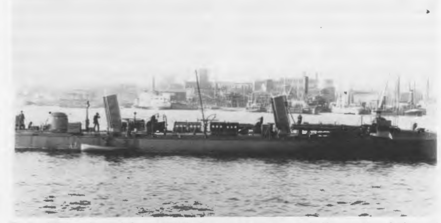
The Norfolk-based torpedo boat, USS Winslow (TB-5). Along with the Newport News-built patrol gunboat Wilmington, Winslow lead an attack on three Spanish gunboats tied up at Cardenas.

Bagley's death occurred during a daring raid on the small town of Cardenas, Cuba during the early stages of the Spanish American War. Winslow