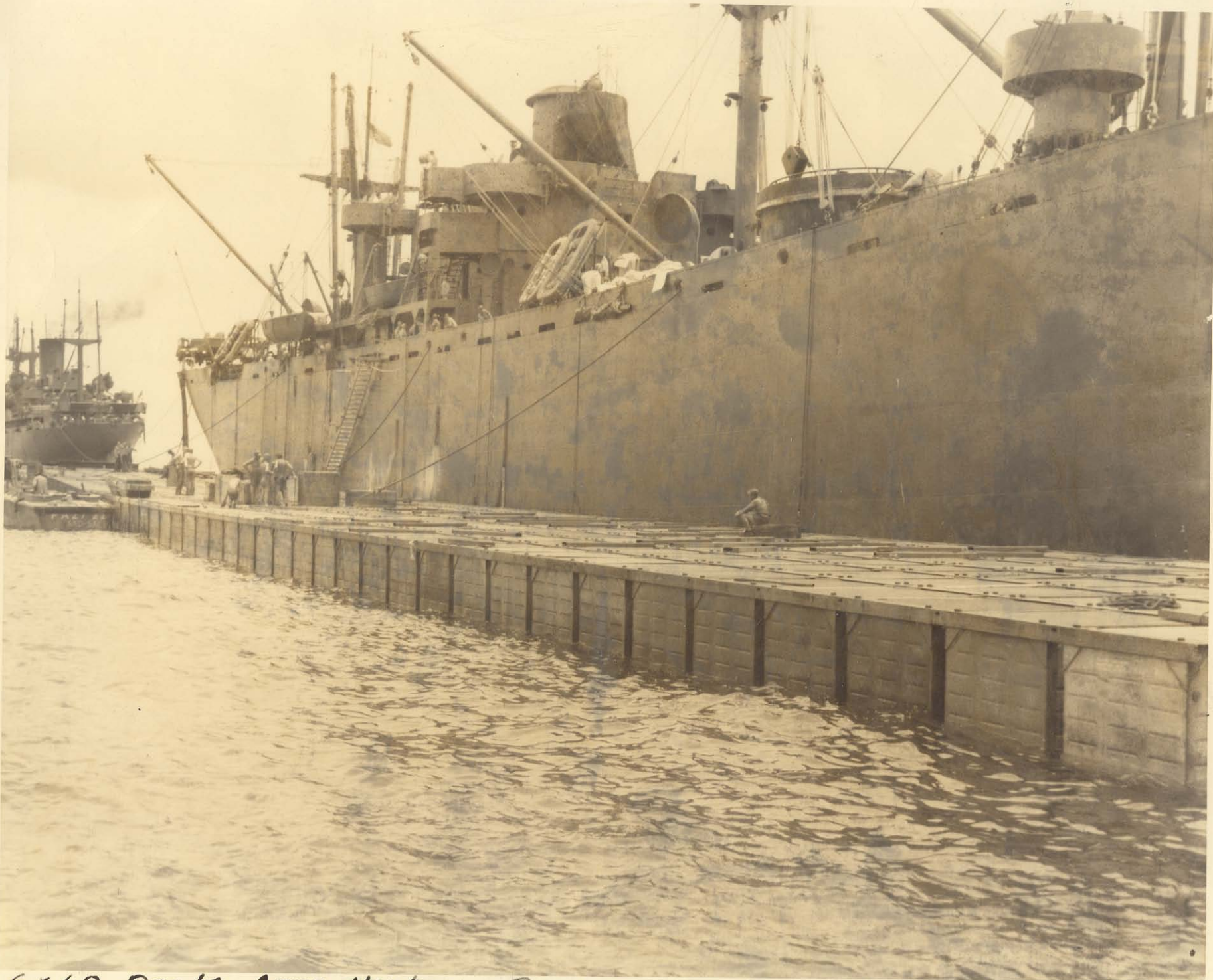
6x60 Dock Apra Harbor, Guam - Assembled by CED 1044