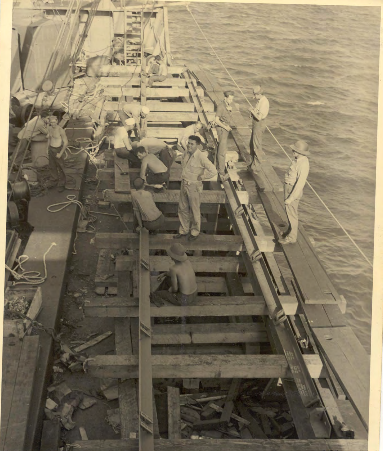
CRIBBING IN PLACE FOR ASSEMBLING A PONTOON STRING FROM THE DECK OF THE USS VEGA