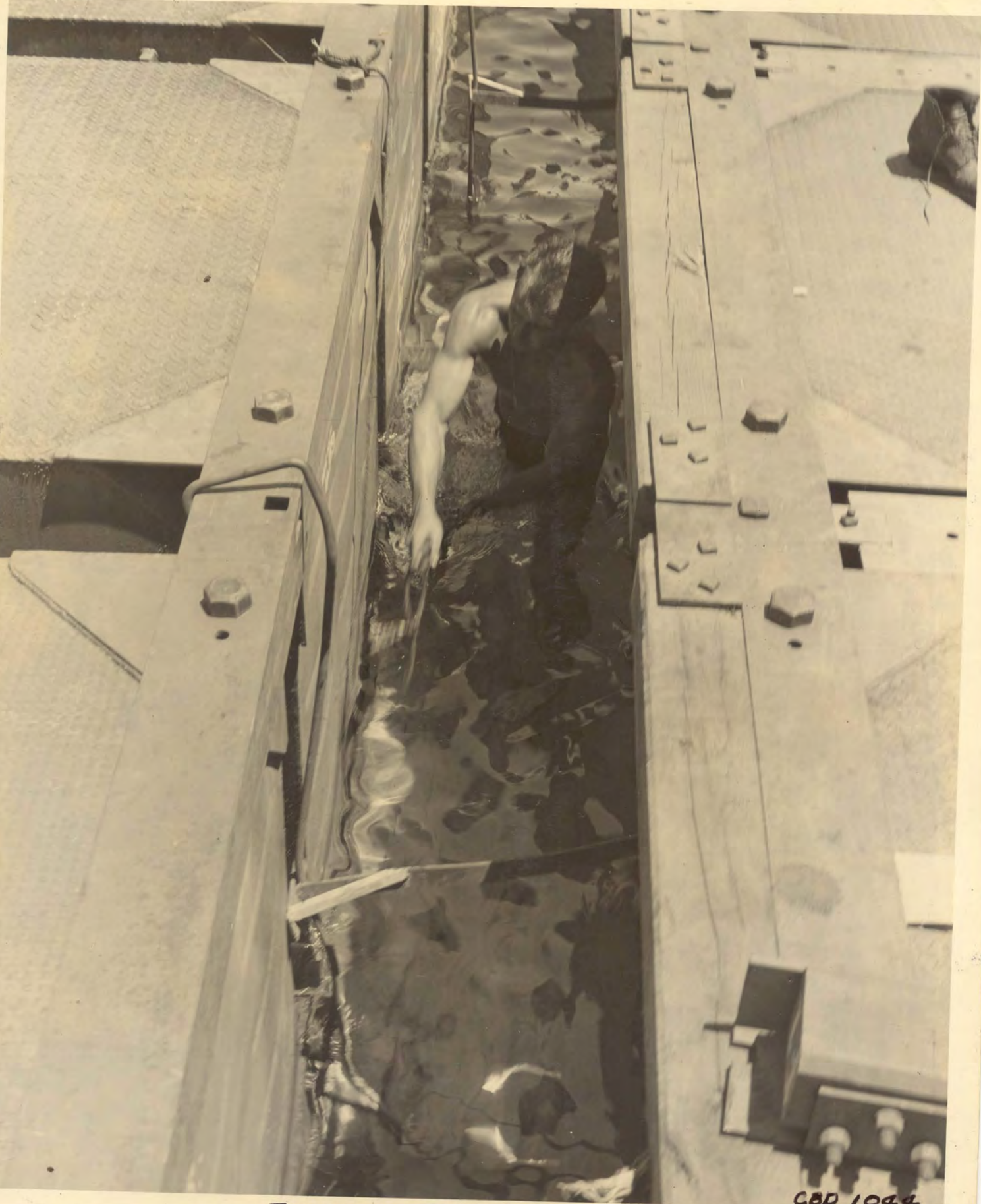
INSTALLING BOTTOM TIE RODS