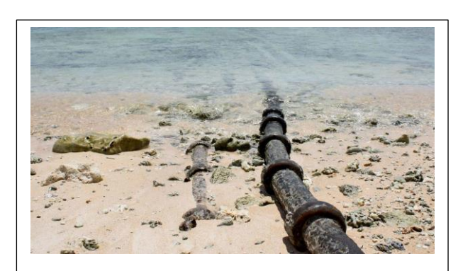
Split Pipe Cable Protection Near Shore

When the UCT's were formed, their tools and equipment mainly consisted of ones that were powered by electricity and air. None of these could be used underwater so a whole new concept in tool development was needed. The Navy Civil Engineering Laboratory (NCEL)