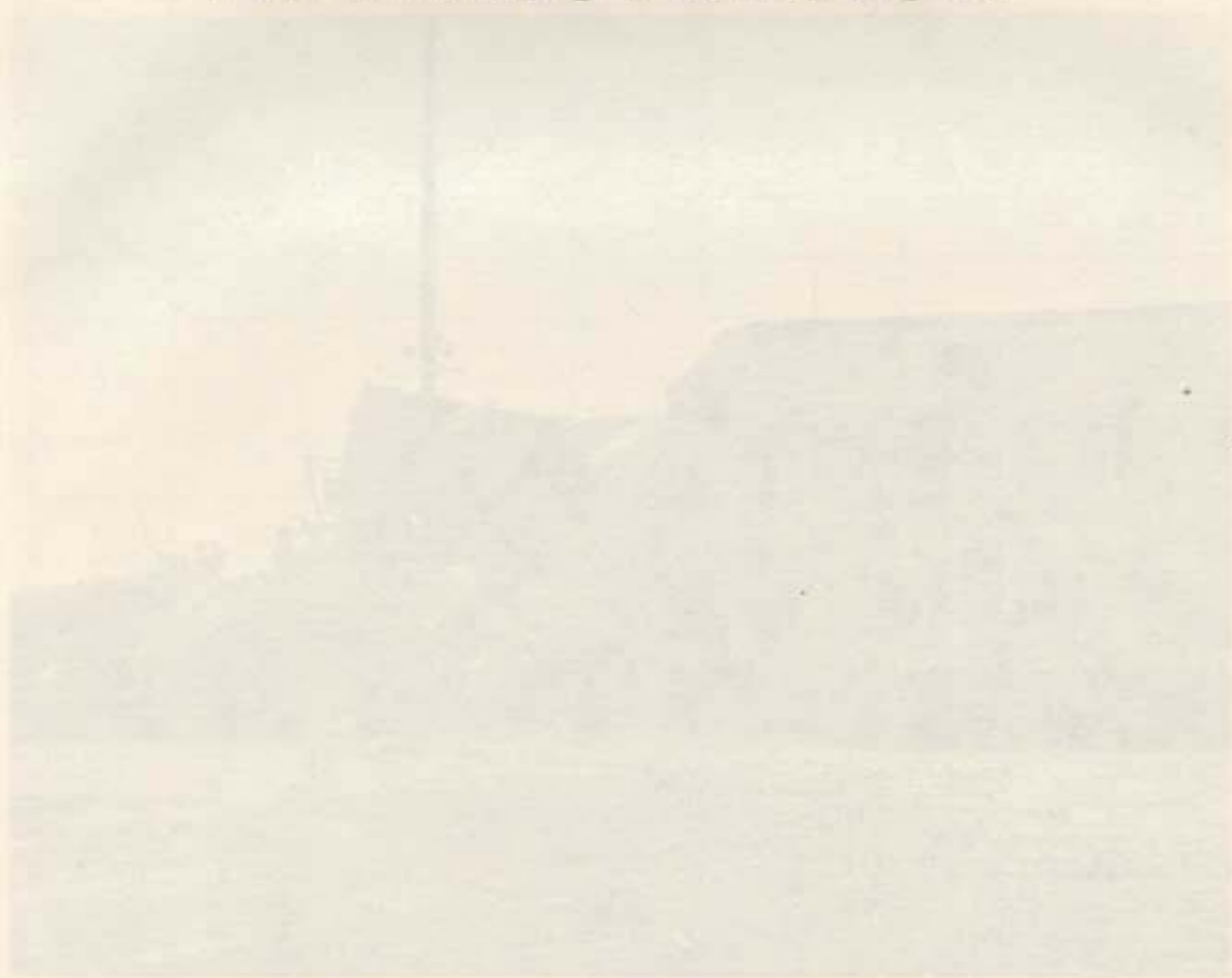
VIEW OF EXPLOSIONS ASSISTED IN WEARDING HEAVILY REINFORCED CONCRETE STRUCTURES